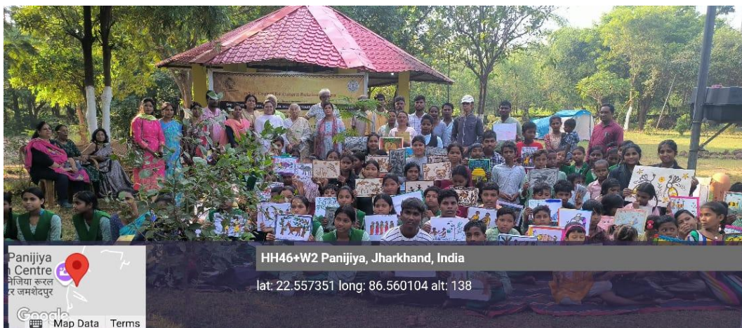
Fig 2. Group Photo