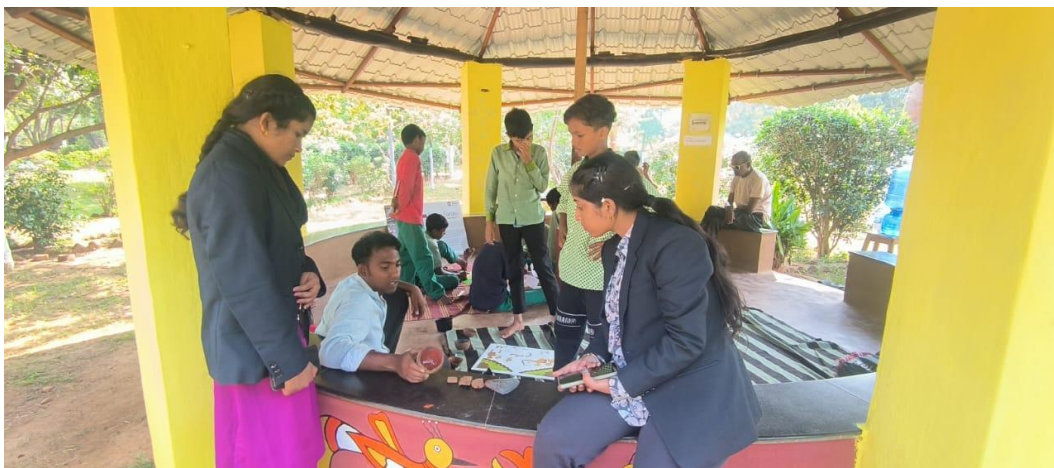
Fig 3. Painting Session