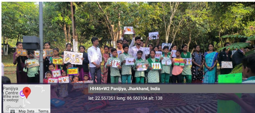
Fig1. Geo Tag Photo