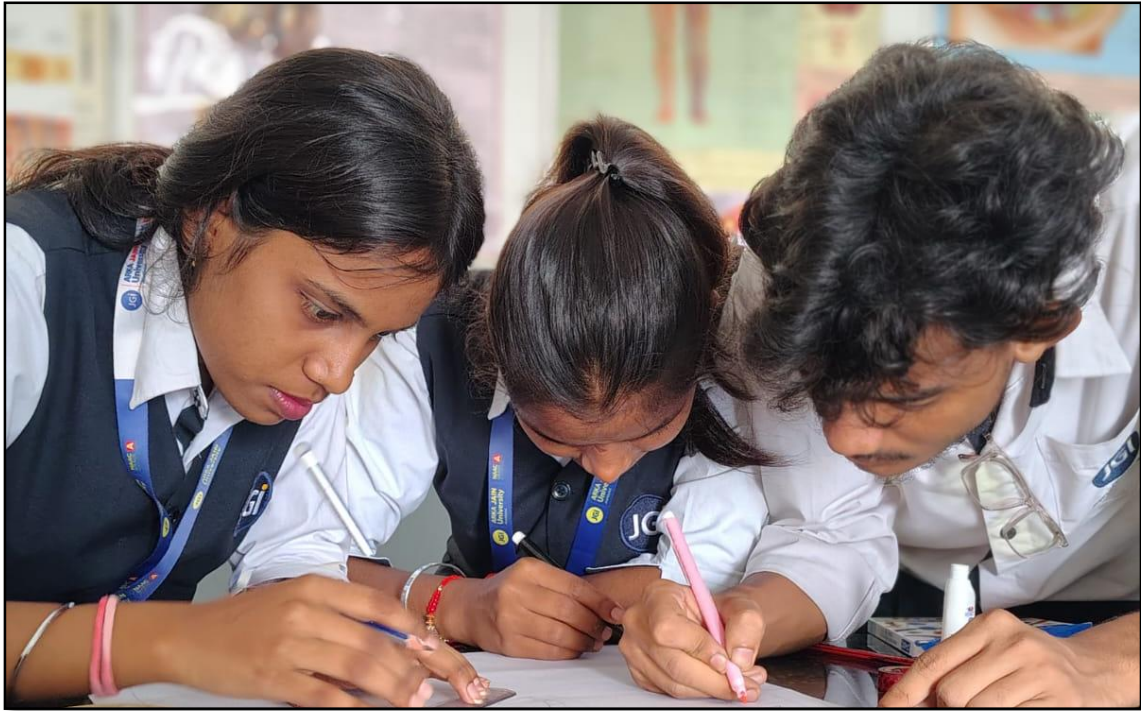
Participants portraying the thoughts