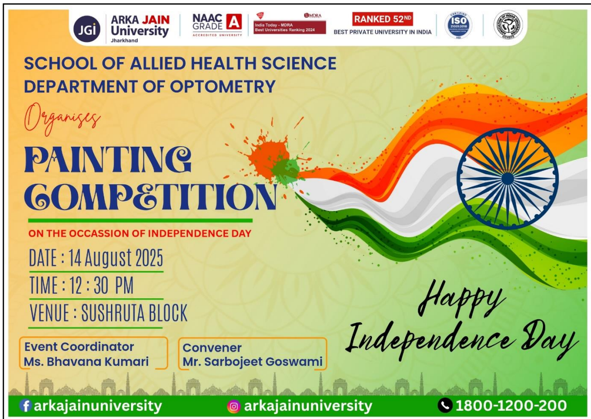
Poster of the Event