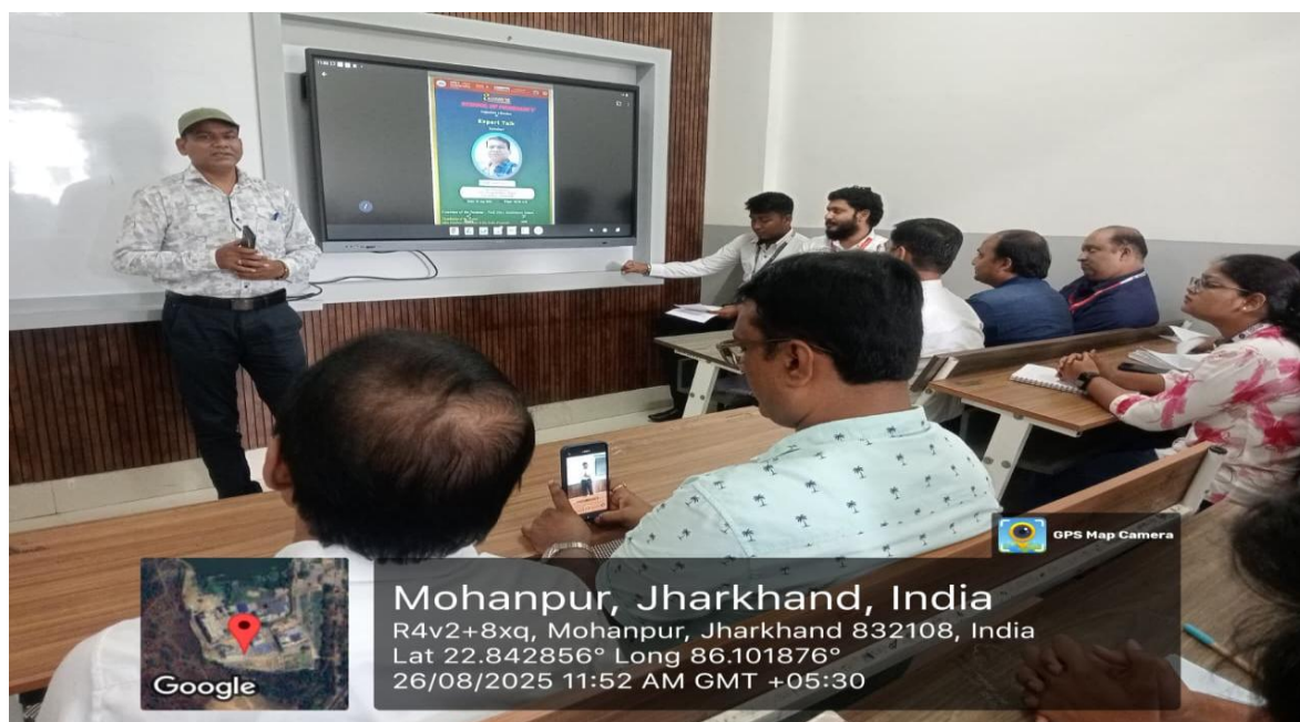
Fig. 2- Students and Faculties engrossed in the session.