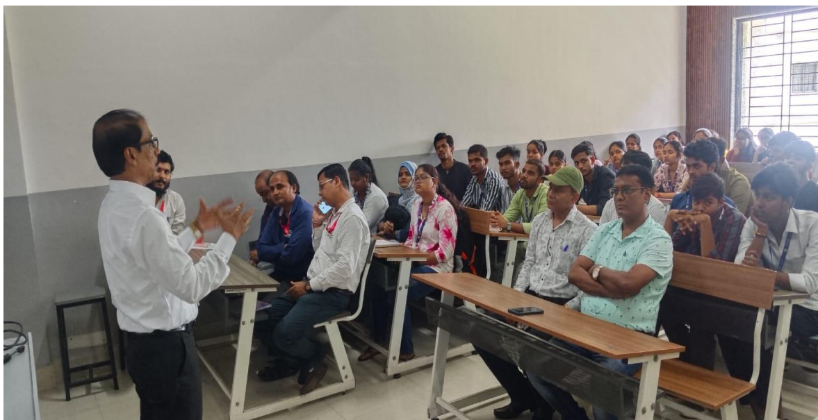
Fig. 3- Address by the Dean, School of Pharmacy, during the session.