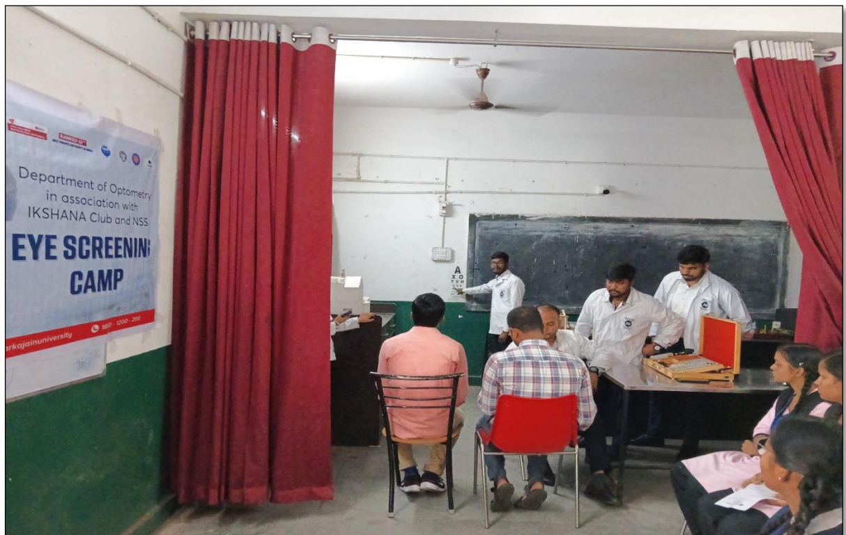
Fig. 4- Examiner taking Visual Acuity