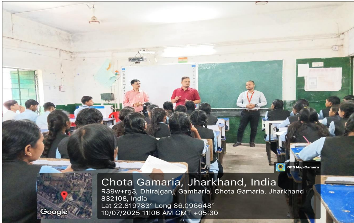
Fig.1 - Awareness about myopia for school children.