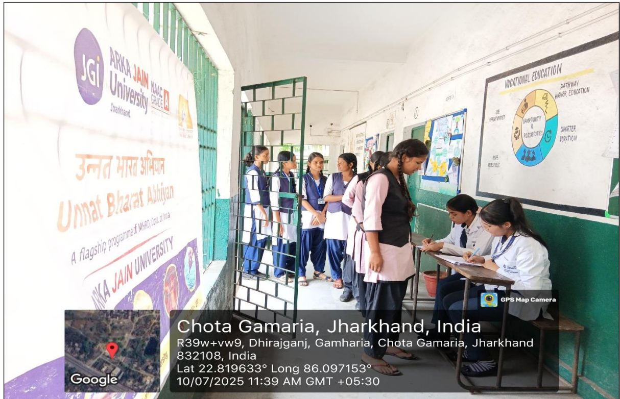
Fig. 3- Registration Counter for all students and staffs.