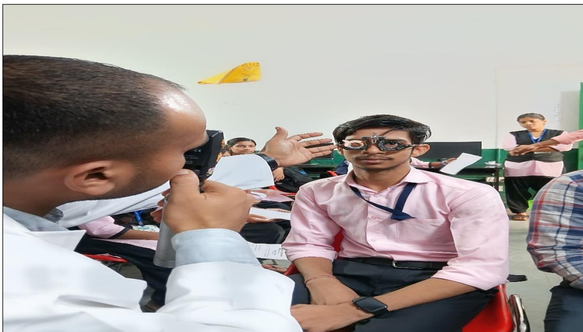
Fig.2 - Examiner Performing subjective refraction