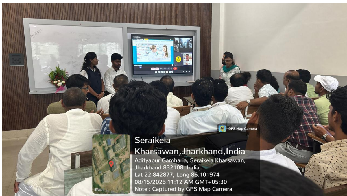
Figure 1: Faculty members, and students are seen attentively engaging with the session.