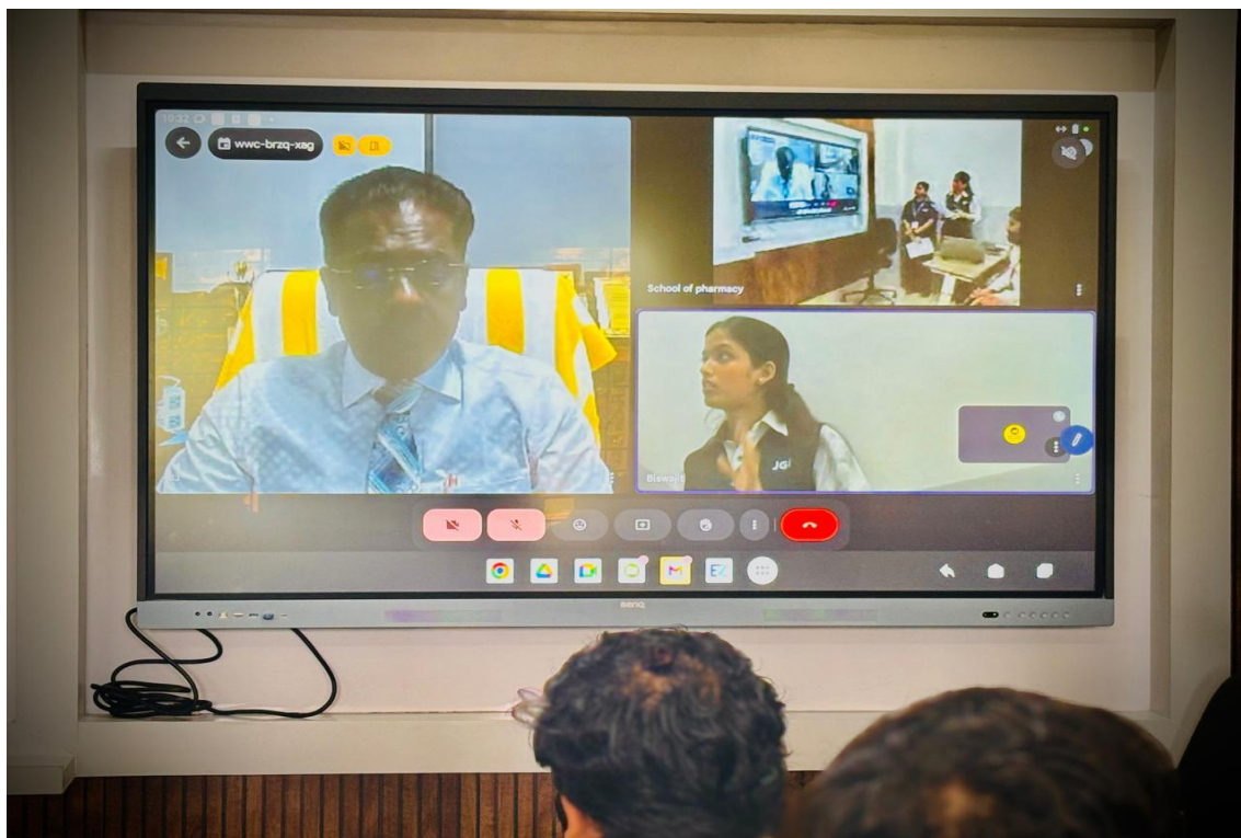
Fig. 3- Speaker delivering his talk