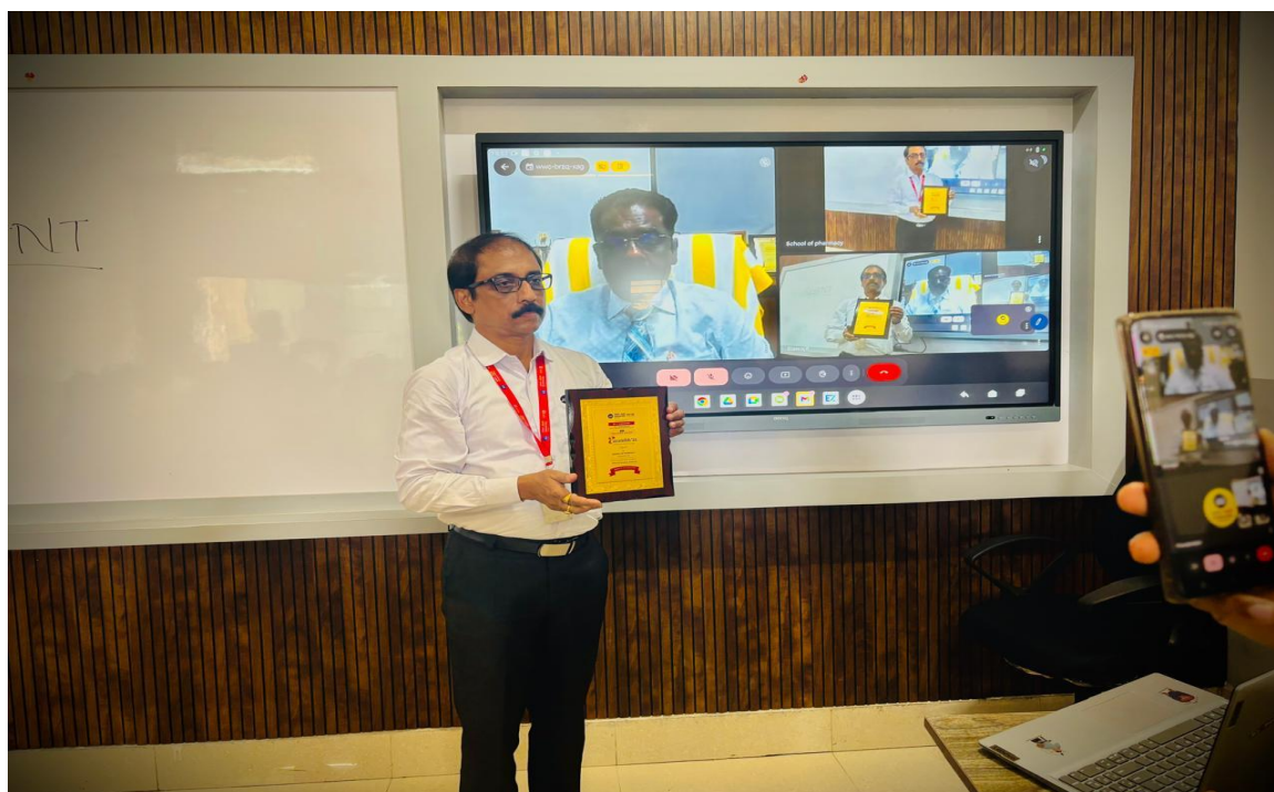
Fig. 4- Dean, School of Pharmacy presenting memento to the speaker