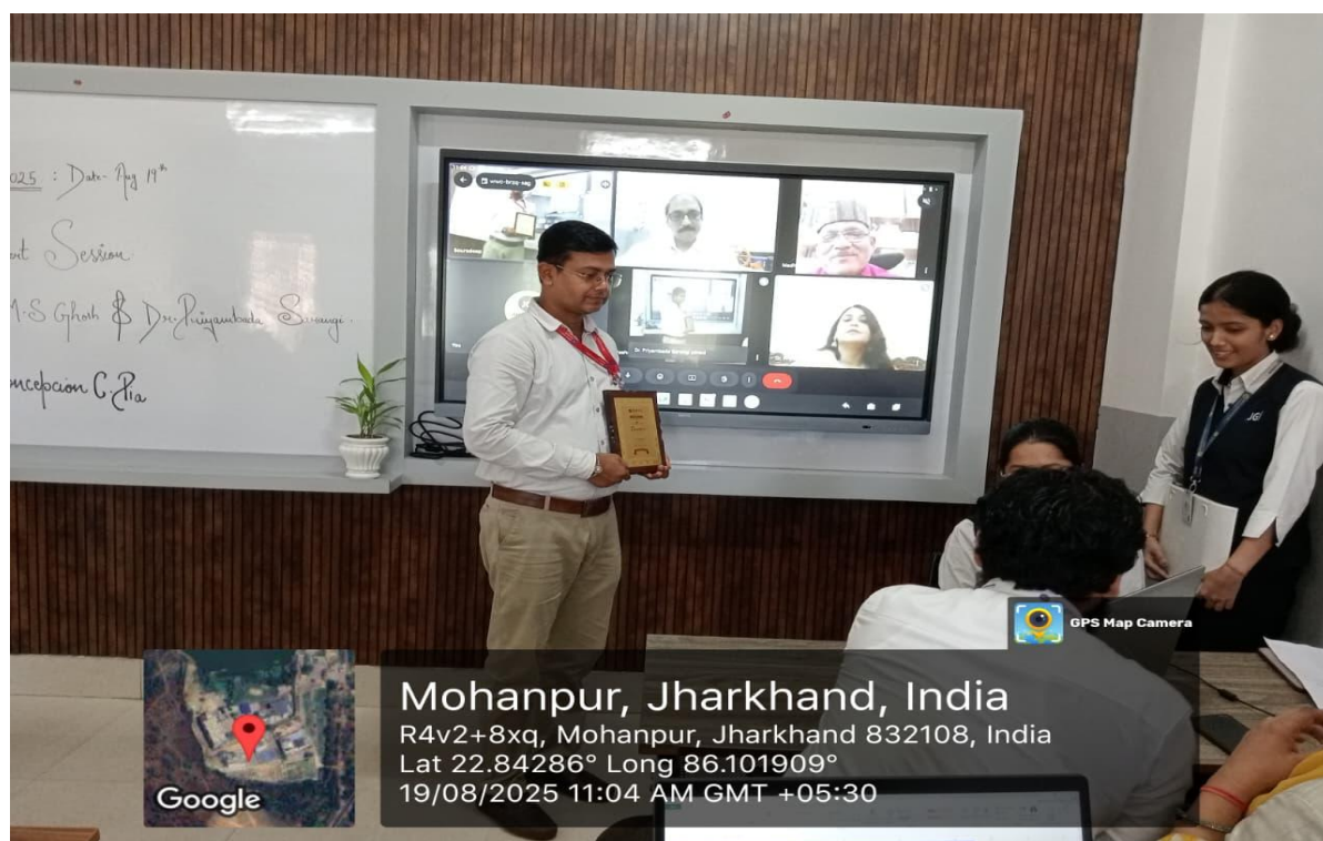
Fig:1-The Speaker is being felicitated with a memento