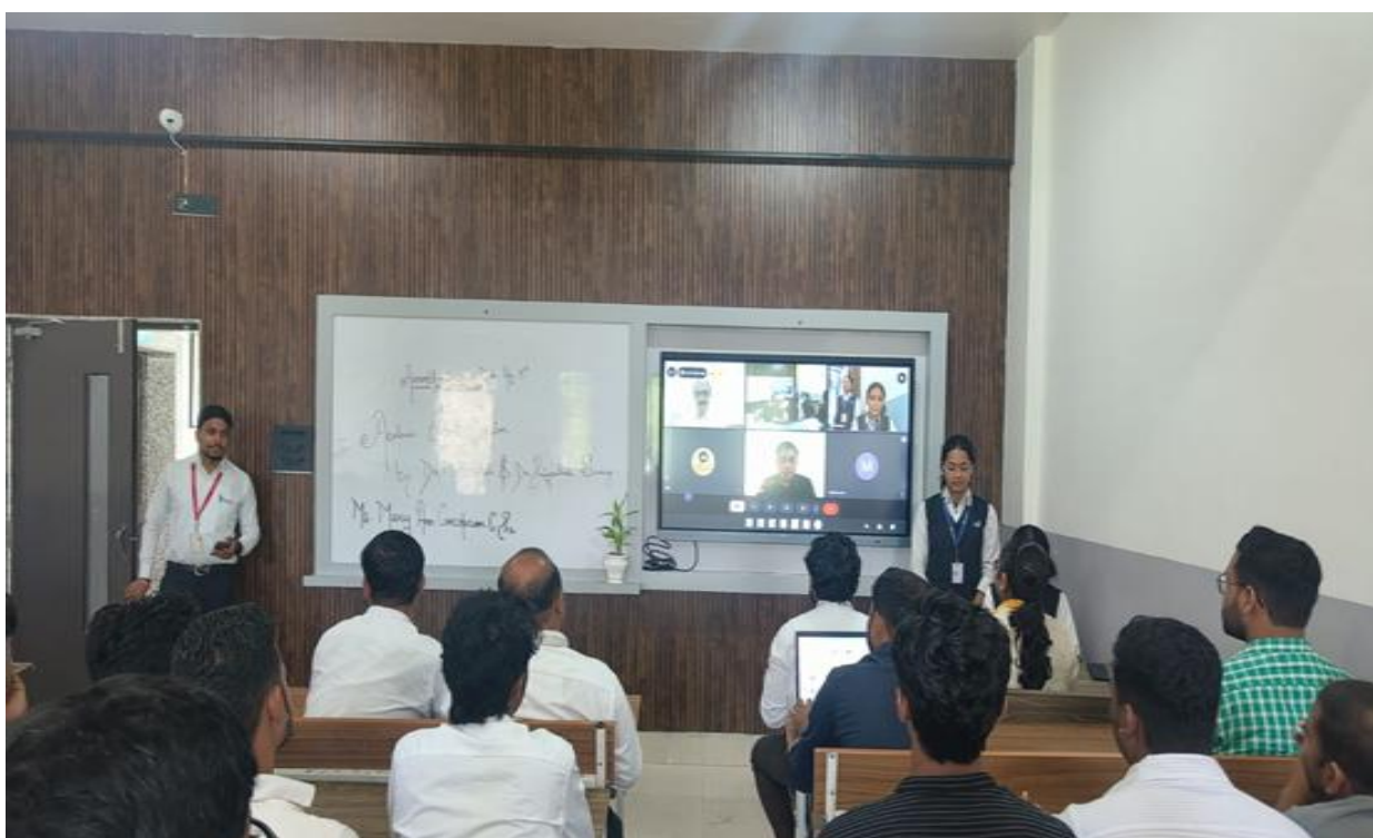
Fig4: Students interacting with the speaker