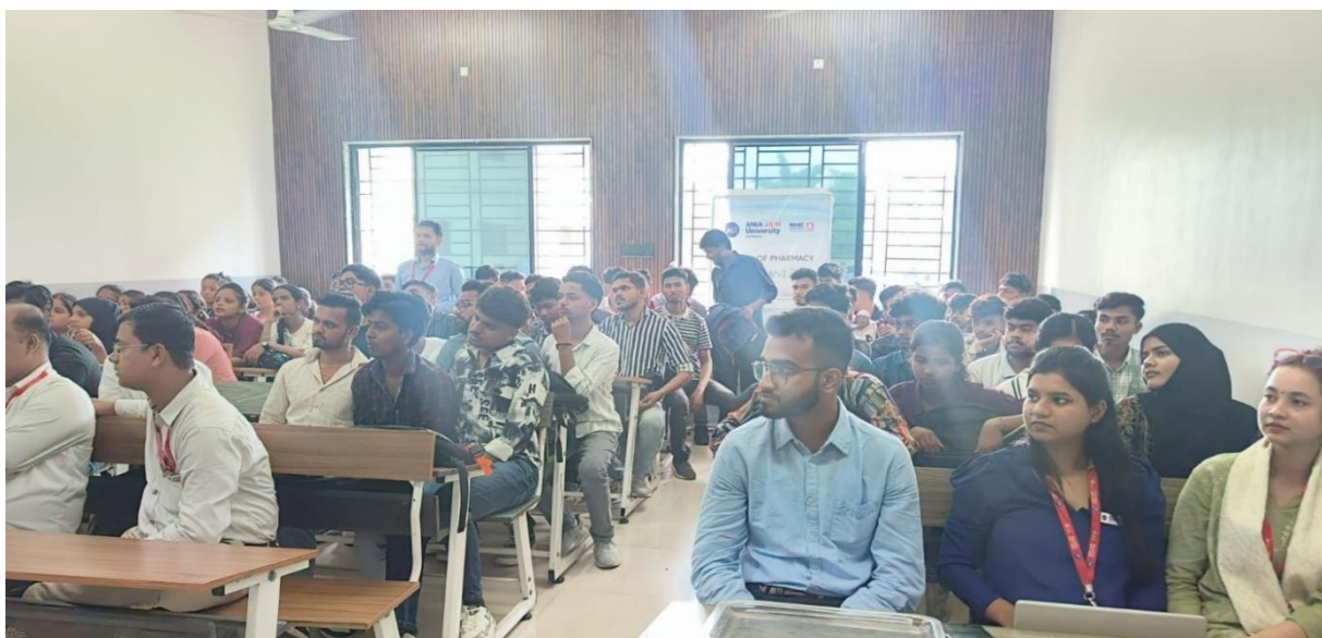
Fig.3- Students and faculties attending the session