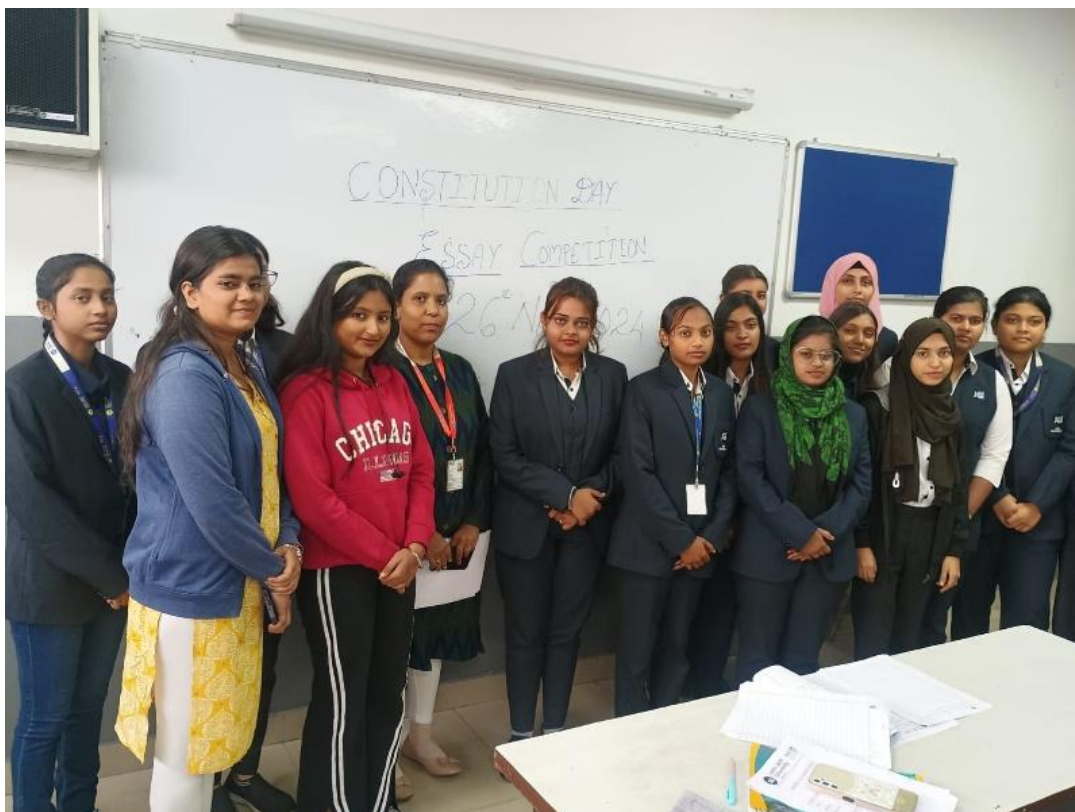
Fig 2. Group Photo