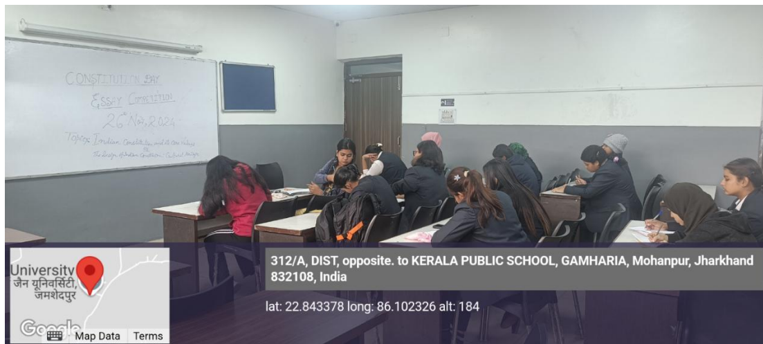
Fig 1. Competition Going on