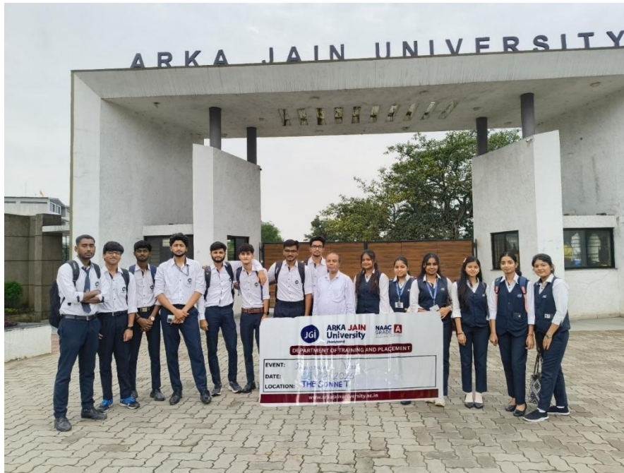
Fig.1 Participants at AJU Campus