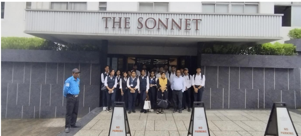
Figure 4: Group Photo at The Sonnet