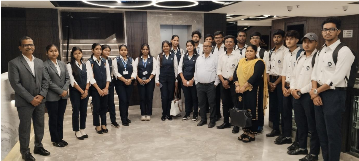
Figure 3: Participants Knowing about a Hospitality Management