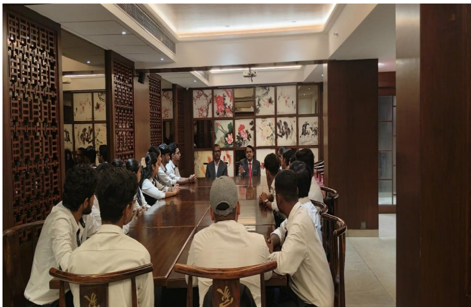
Fig.2 Resource Person Answering the Queries of the Participants