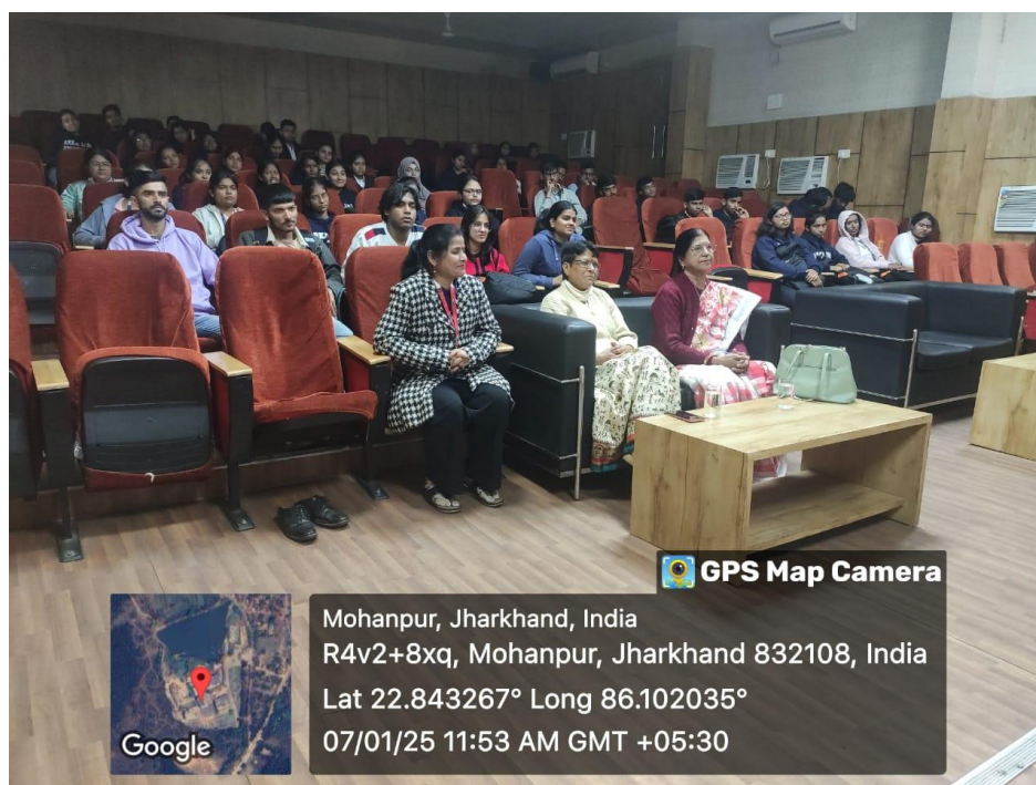
Figure 2: Guest Speaker with audience