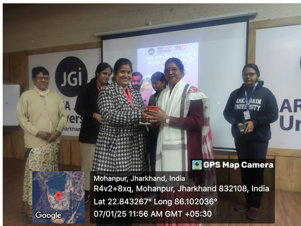
Figure 6: Falisitation of Guest Speaker