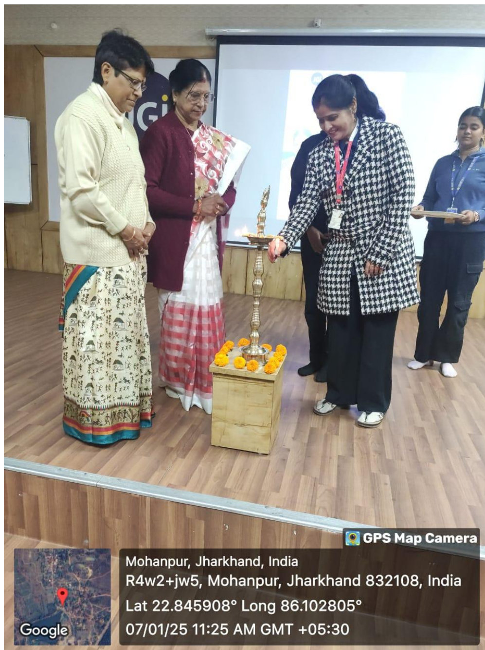
Figure 1: Lightening of the Lamp