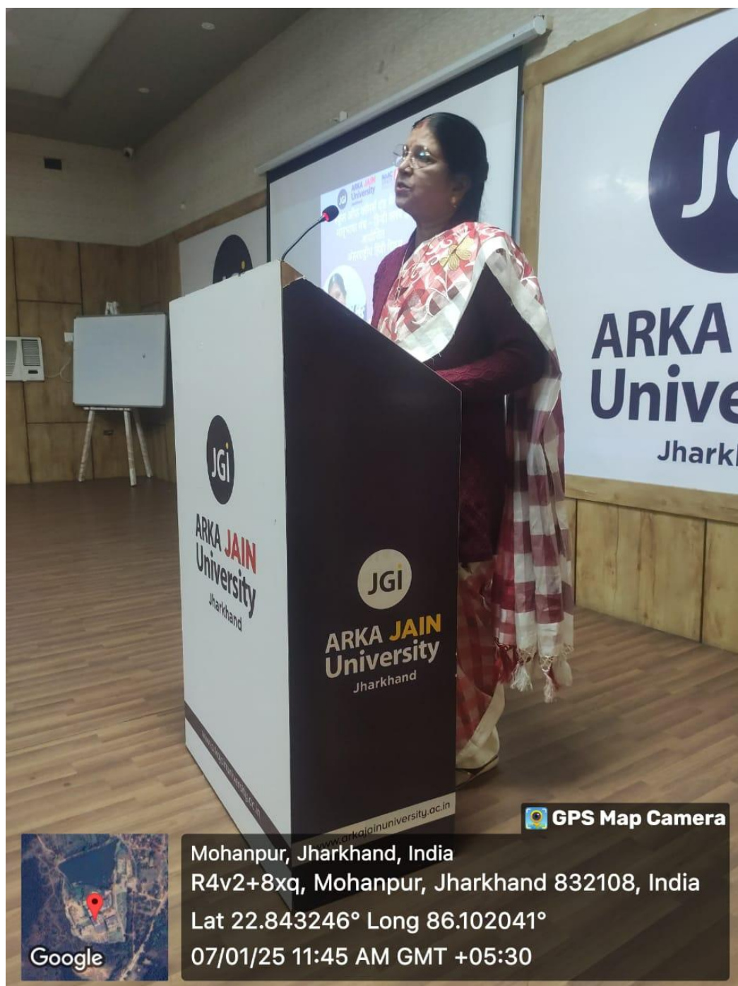
Figure 5: Guest Speaker communicating with the students of university