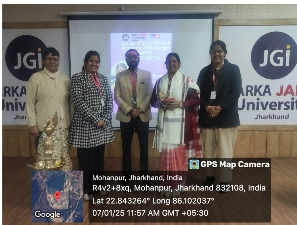
Figure 7: Guest Speaker with Event Coordinatirs