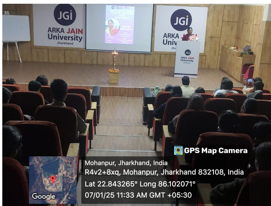
Figure 3: Guest Speaker Delivering her Valuable thought about Importance of Hindi at international platform