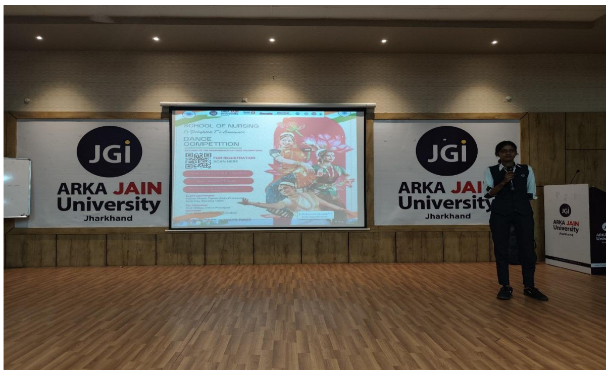
Fig. 1- Inaugural of the Event.