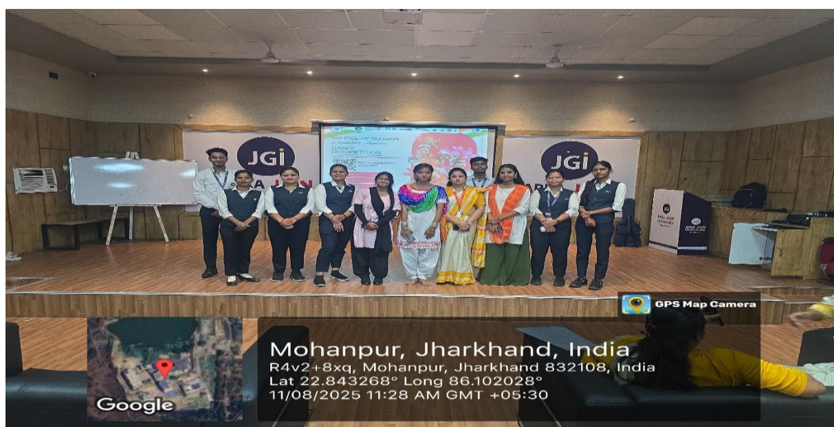
Fig. 6-Group Photo of the Event