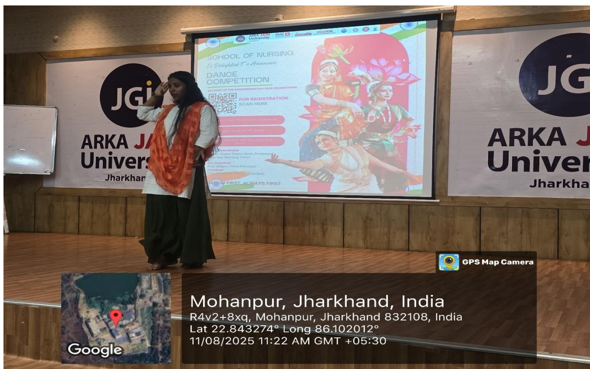
Fig.3- Patriotic Dance Performed by Student