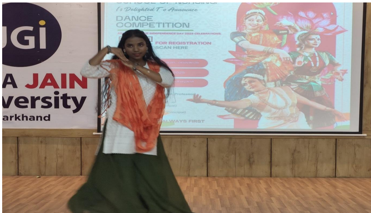
Fig. 2- Inaugural Dance