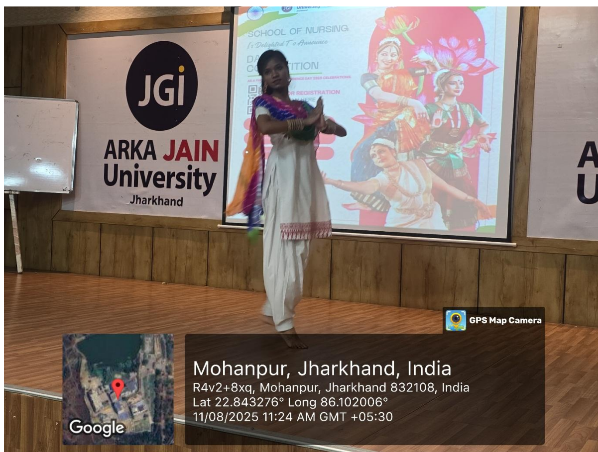
Fig.5- Patriotic Dance Performed by Student