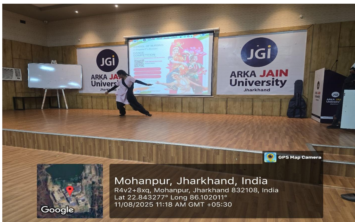
Fig.4- Patriotic Dance Performed by Student