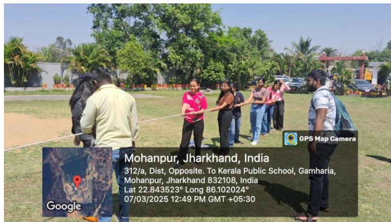
Fig.2 Glimpses from the starting moments