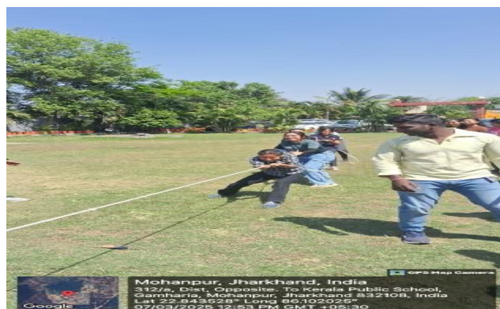
Figure 3: Participants showcasing their strength