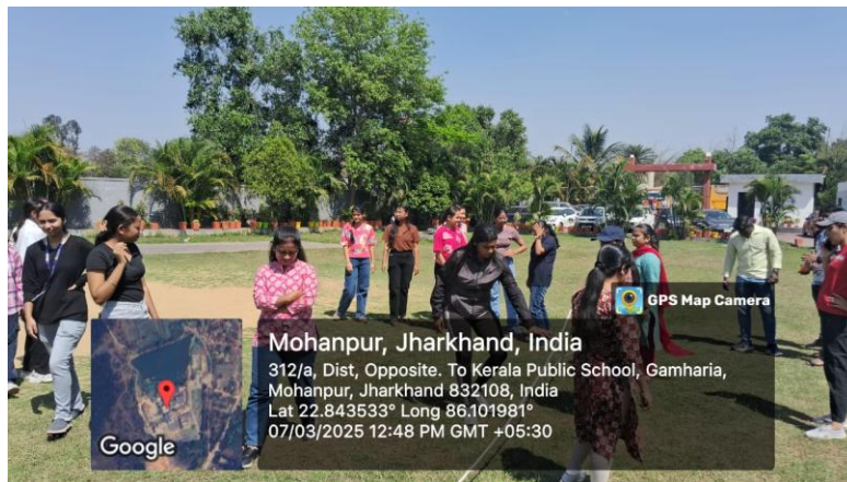
Fig.1 Teams gearing up for the Tug-of -War