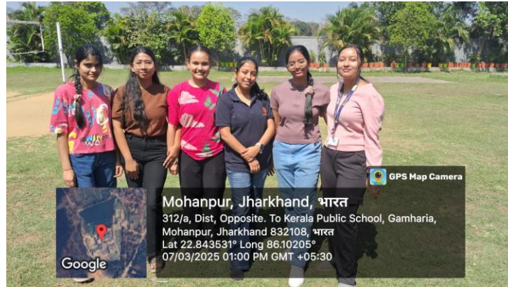
Figure 4: Members of the Winning Team