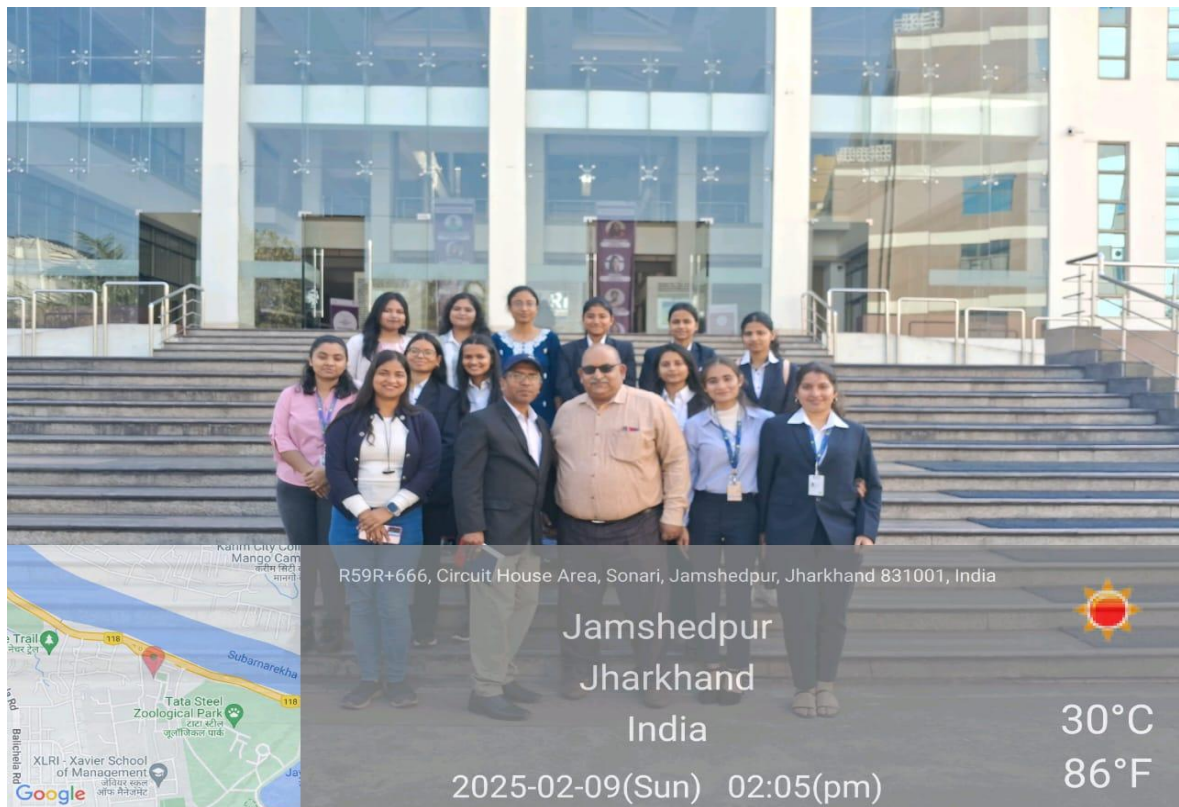
Fig. – 2 Students with Faculty members at the Learning Center, XLRI Campus