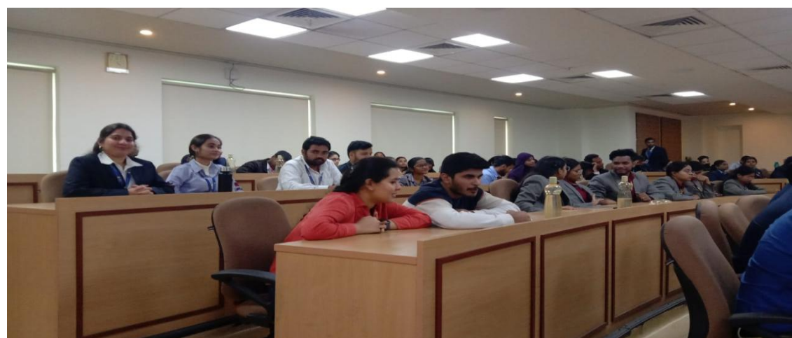
Fig.5 –Students attending the Panel Discussion