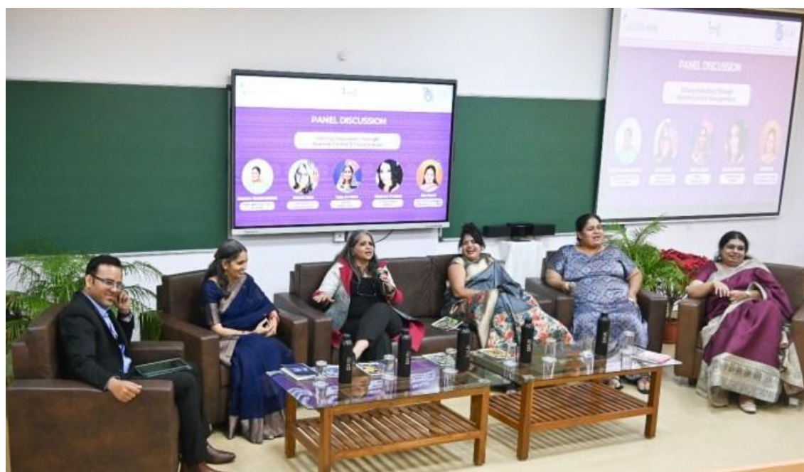
Fig, 4 – Panel Discussions in Progress