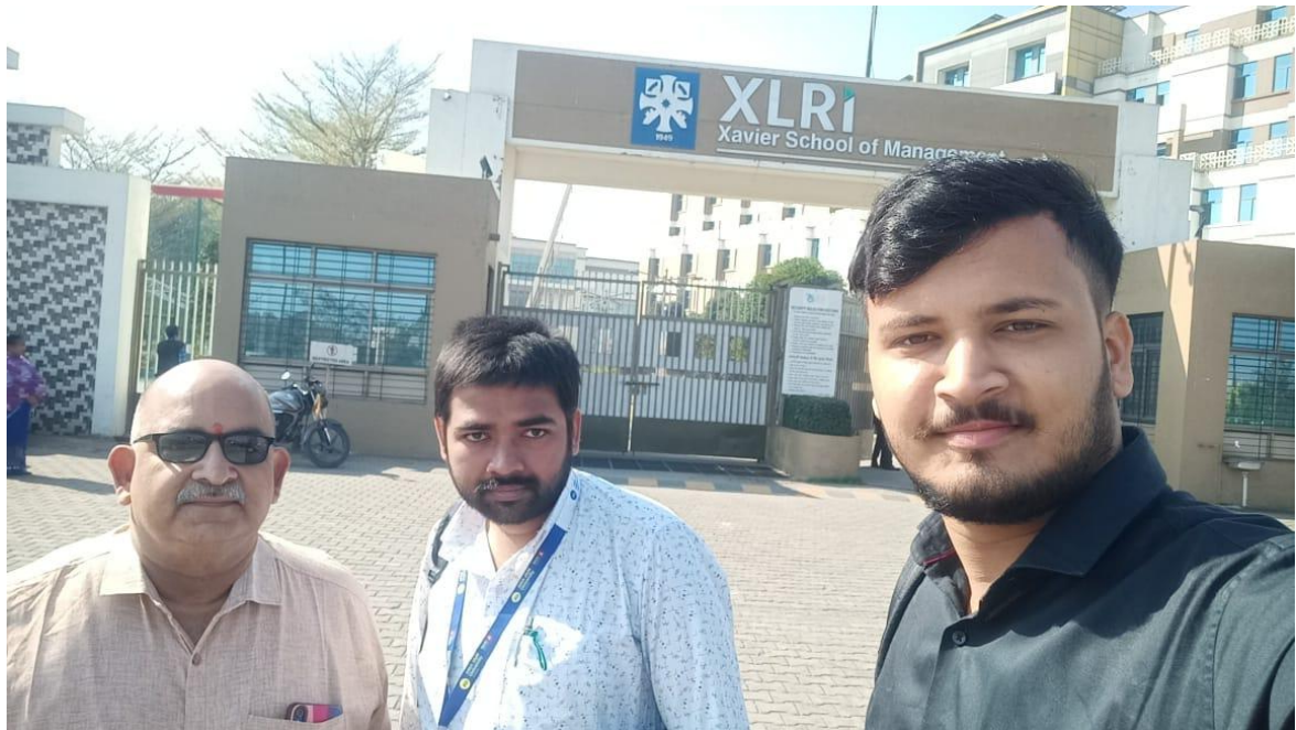
Fig.-1 Students at XLRI Entrance for attending the Panel Discussion