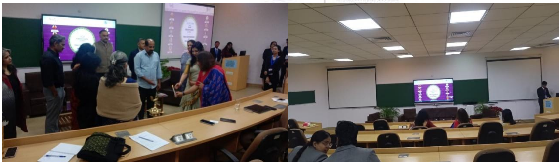
Fig. 3 – Inauguration of the Panel Discussion