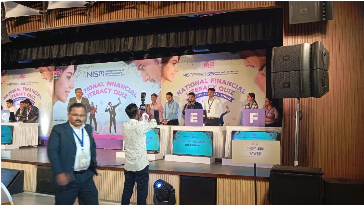
Fig.1 Participants Discussing their Queries on NISM