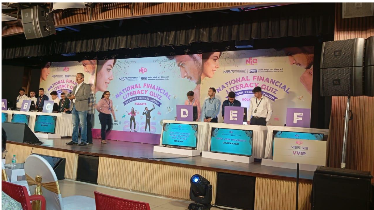
Figure 4: Quiz Masters of NISM