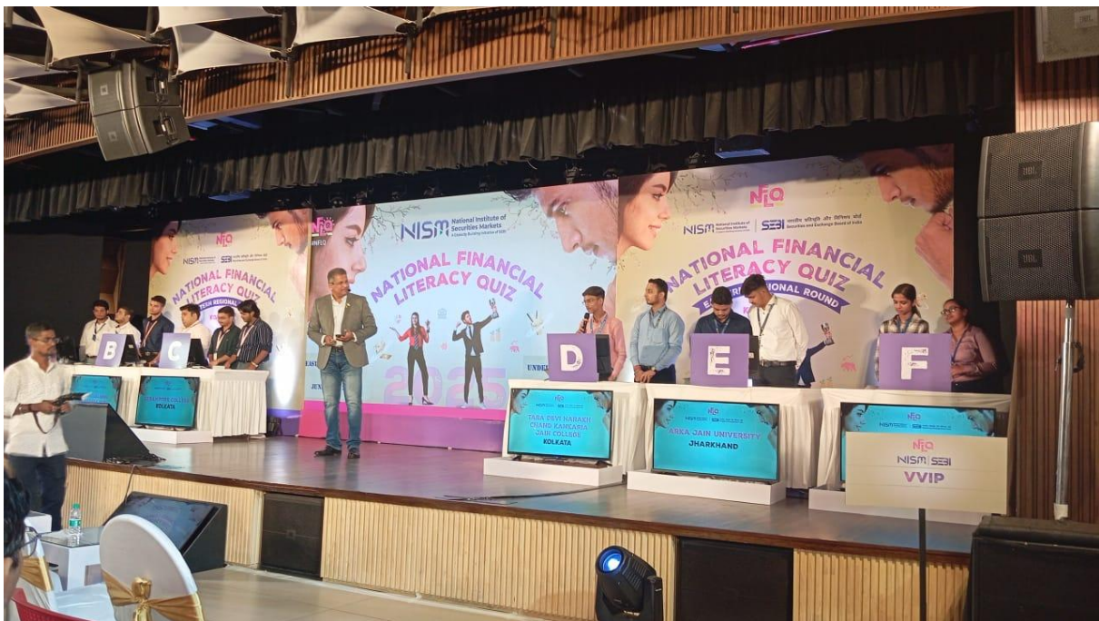
Fig.2 Resource Person Answering the Queries of the Participants