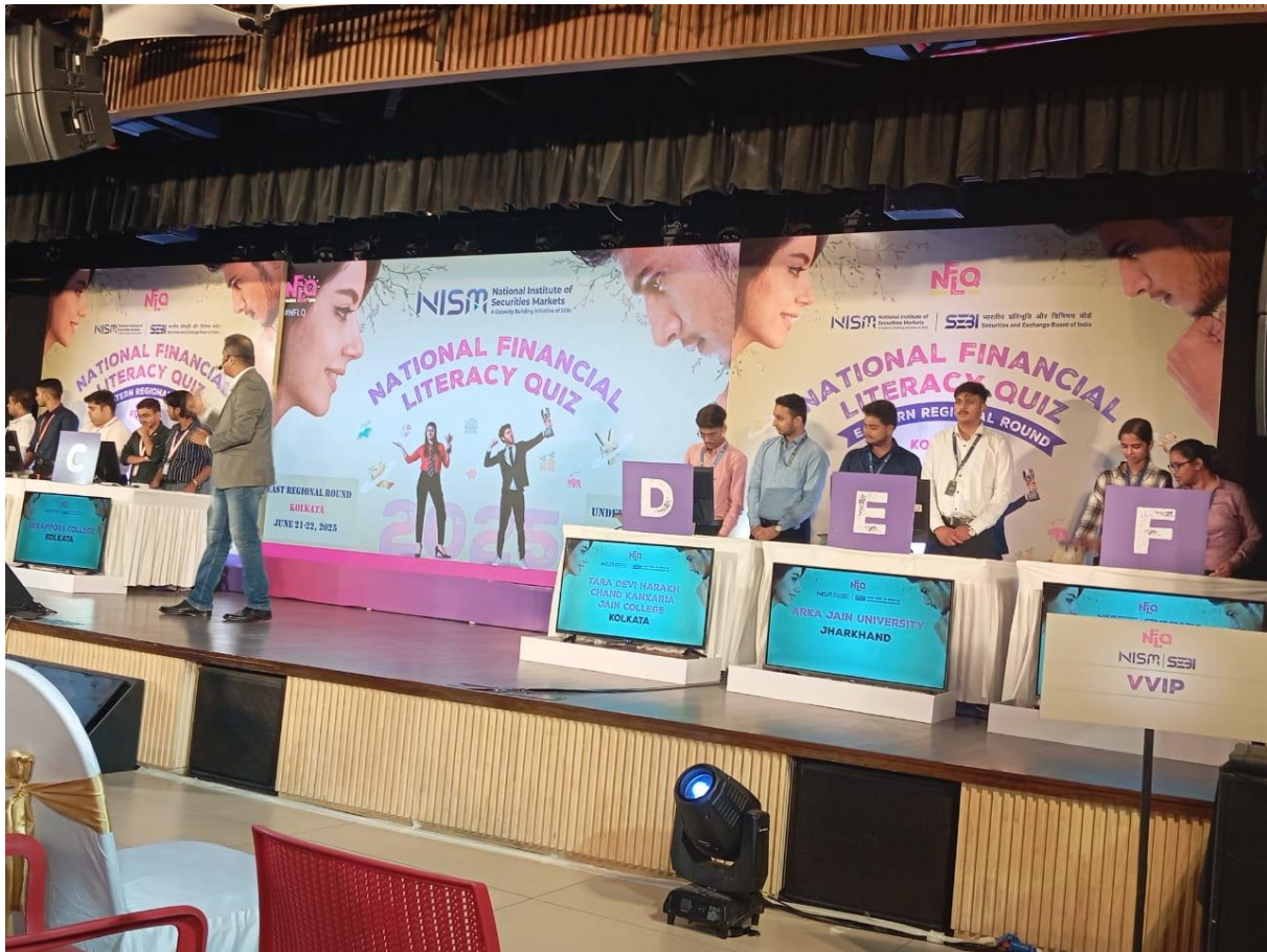
Figure 3: Participants Knowing about a Financial Quiz