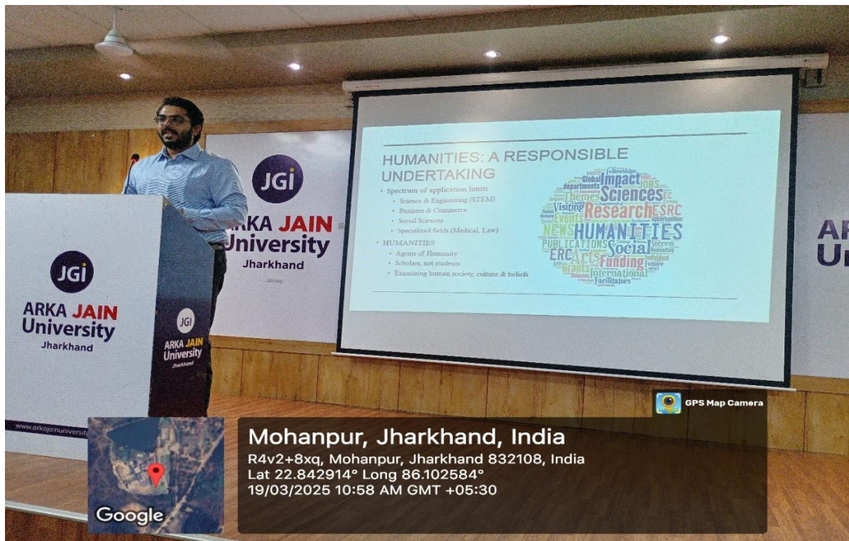
Fig. 5- Group photograph of the faculties and students attending the session.