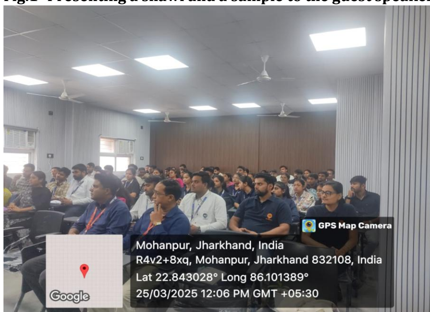
Fig.2- Students attending a session on interview skills and HR insights.