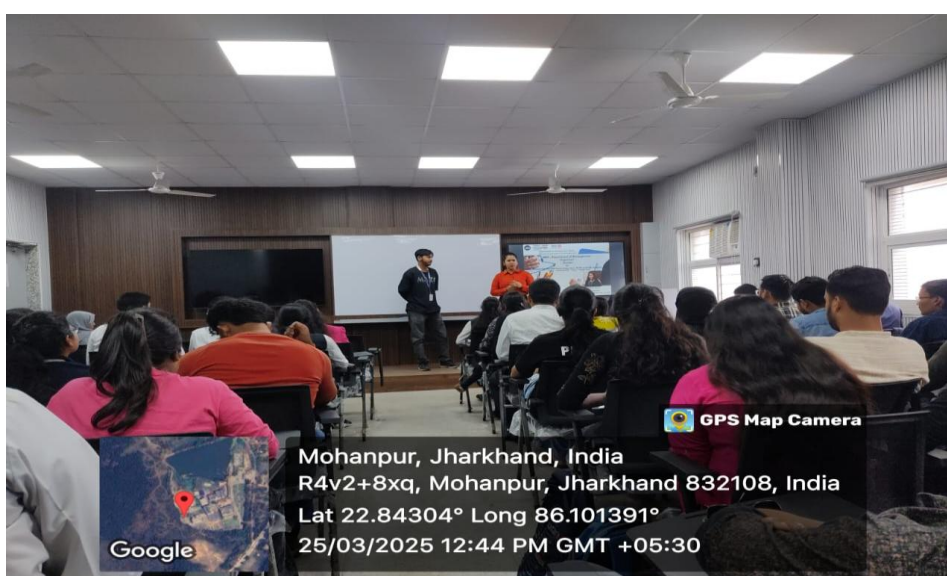
Fig. 4- Students participating in activities to refine their job-hunting skills.