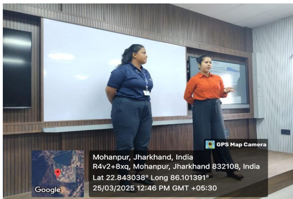
Fig. 3- Students engaging in activities to master job hunt techniques.