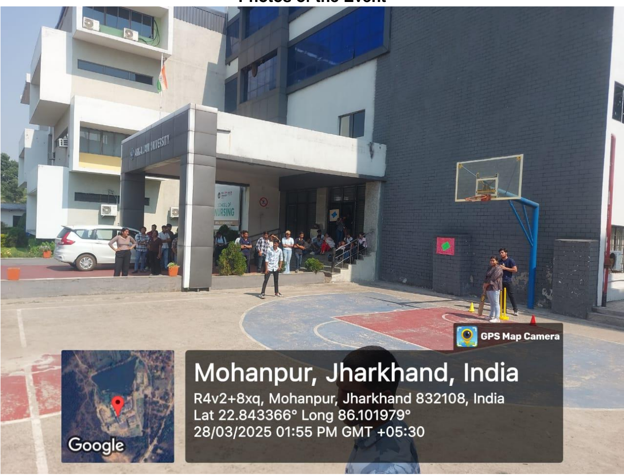
Figure 2: Students Playing Cricket during the event