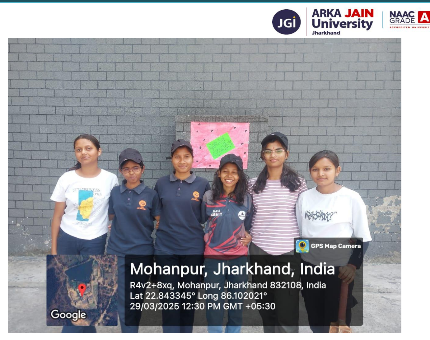
Figure 5: Smiling faces of the winners after winning the Final game