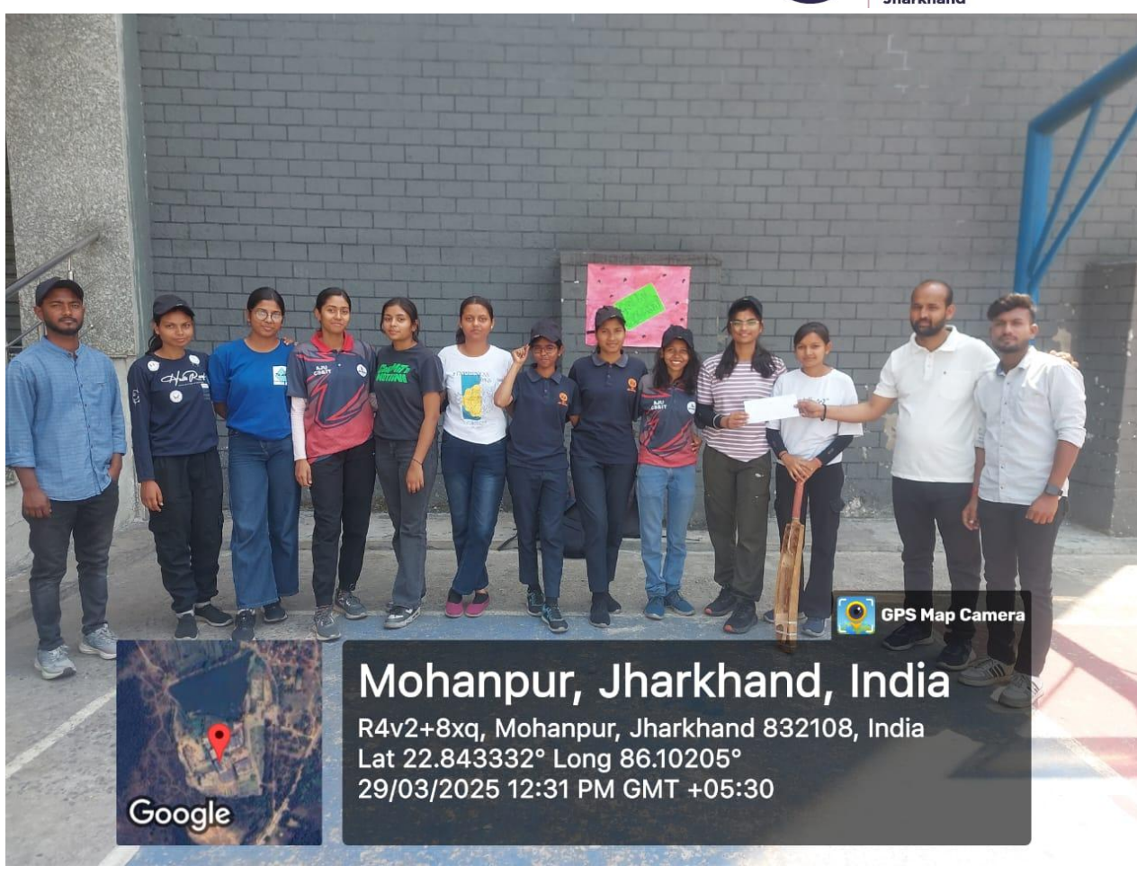
Figure 6: Faculty member providing cash prize to the winners