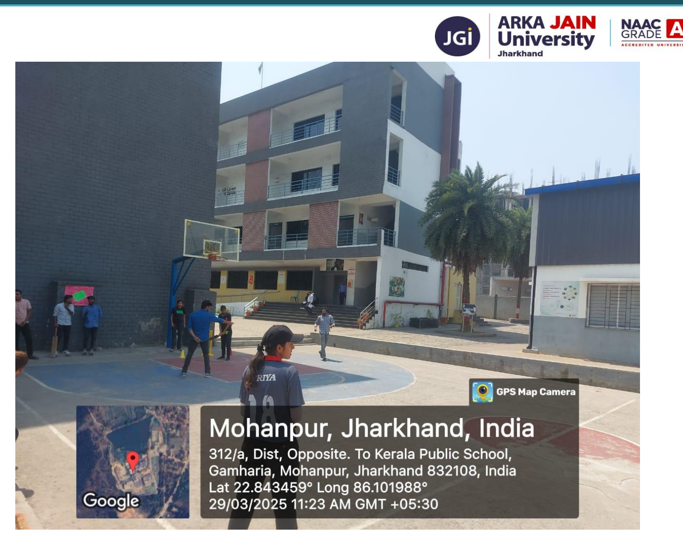
Figure 4: Students Playing Cricket during the event