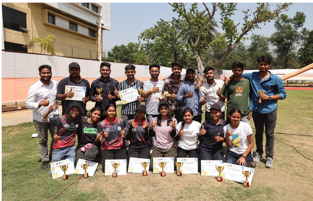
Figure 9: Group Photo of Winners and Team YUVA 4.0