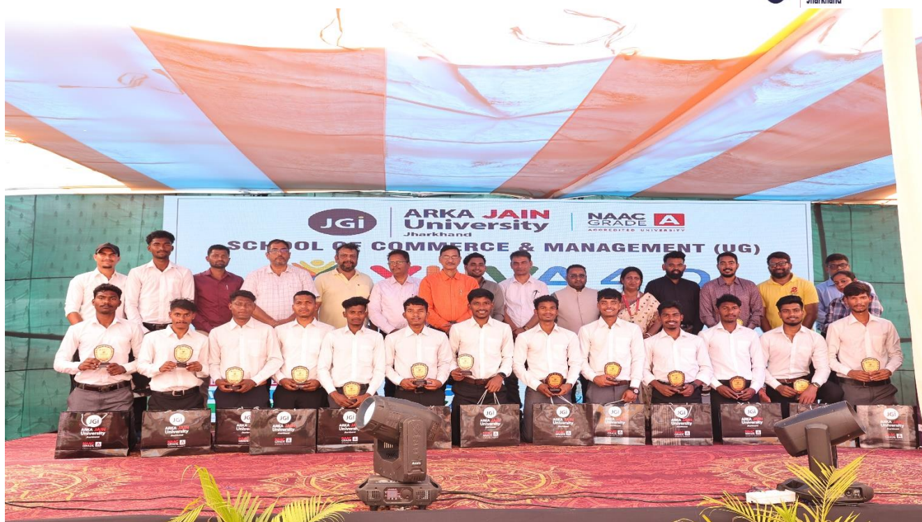
Figure 4: Photo of Felicitating National Hockey Team in YUVA 4.0