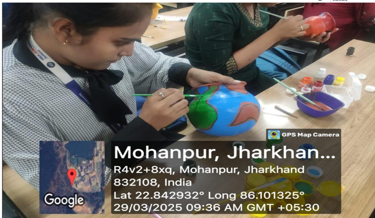
Figure 8: GPS tagged photo of students participated in Kalakriti in YUVA 4.0