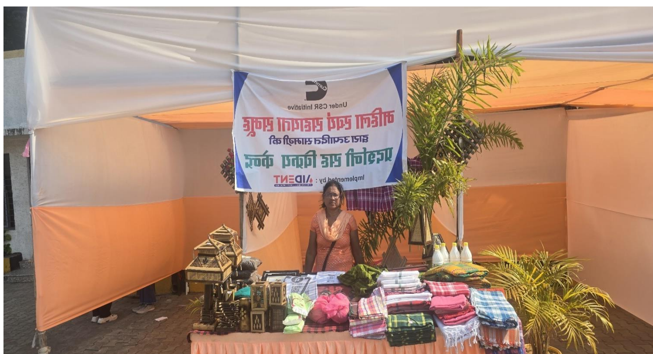
Figure 5: Photo of Local Artisans & NGO- Showing the rich tradition and culture of Jharkhand