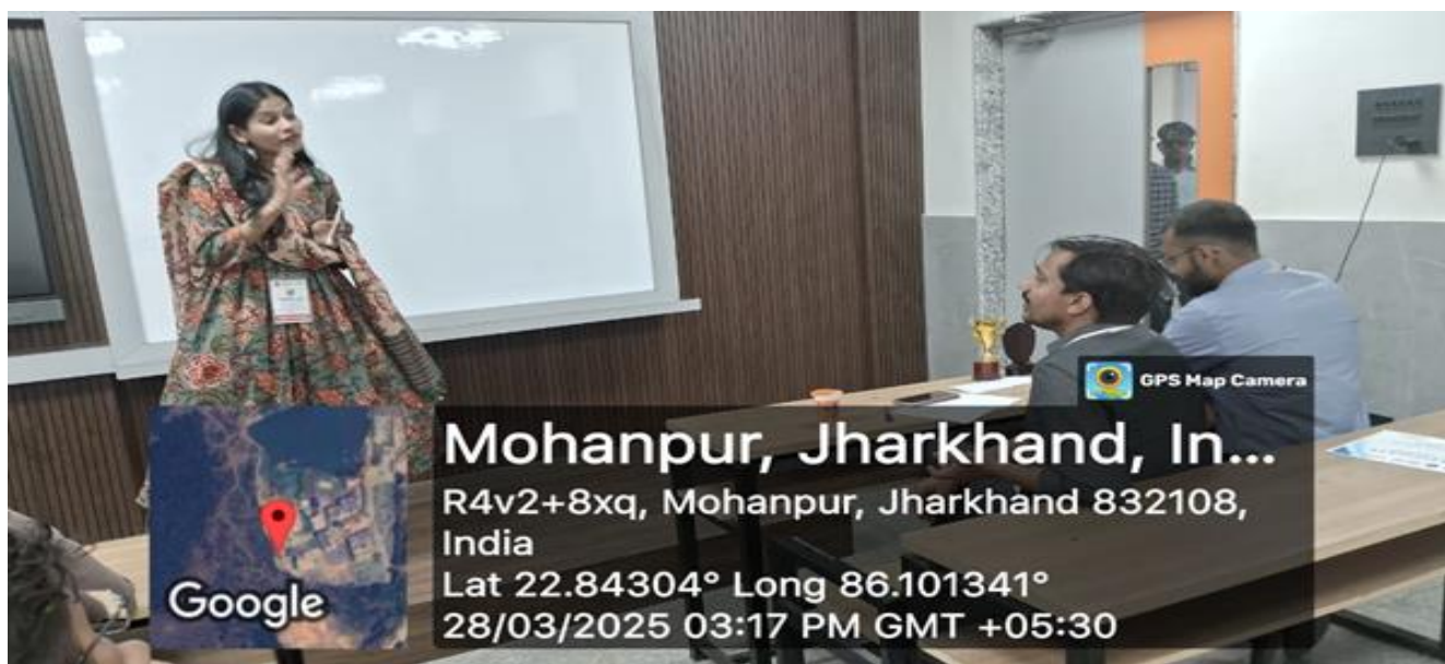
Figure 6: GPS tagged photo of students participated in Kurukshetra in YUVA 4.0