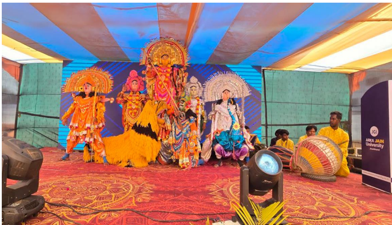
Figure 3: Chhau Dance Performance- Showing the Culture of Jharkhand