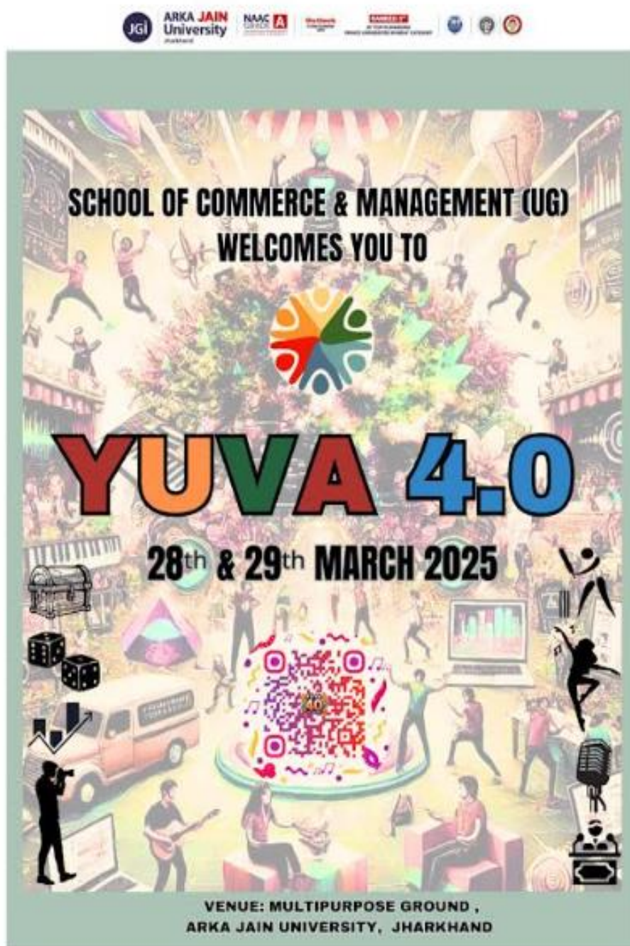
Figure 1: Poster of YUVA 3.0