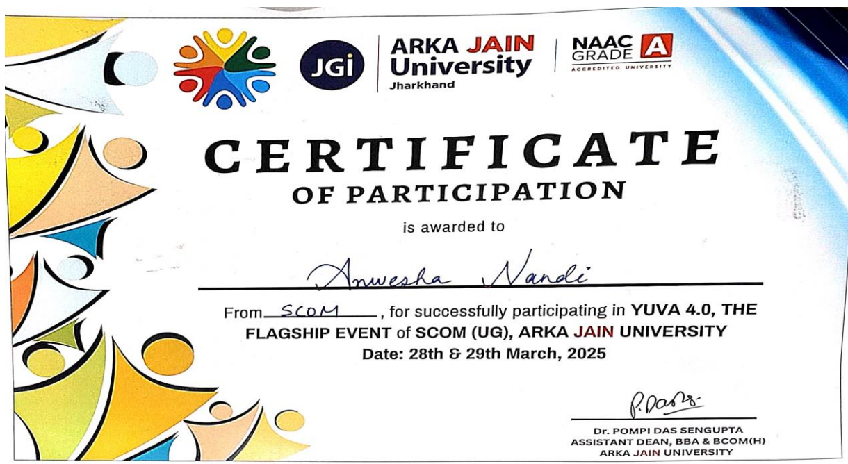
Figure 11: Participation Certificate (Sample)