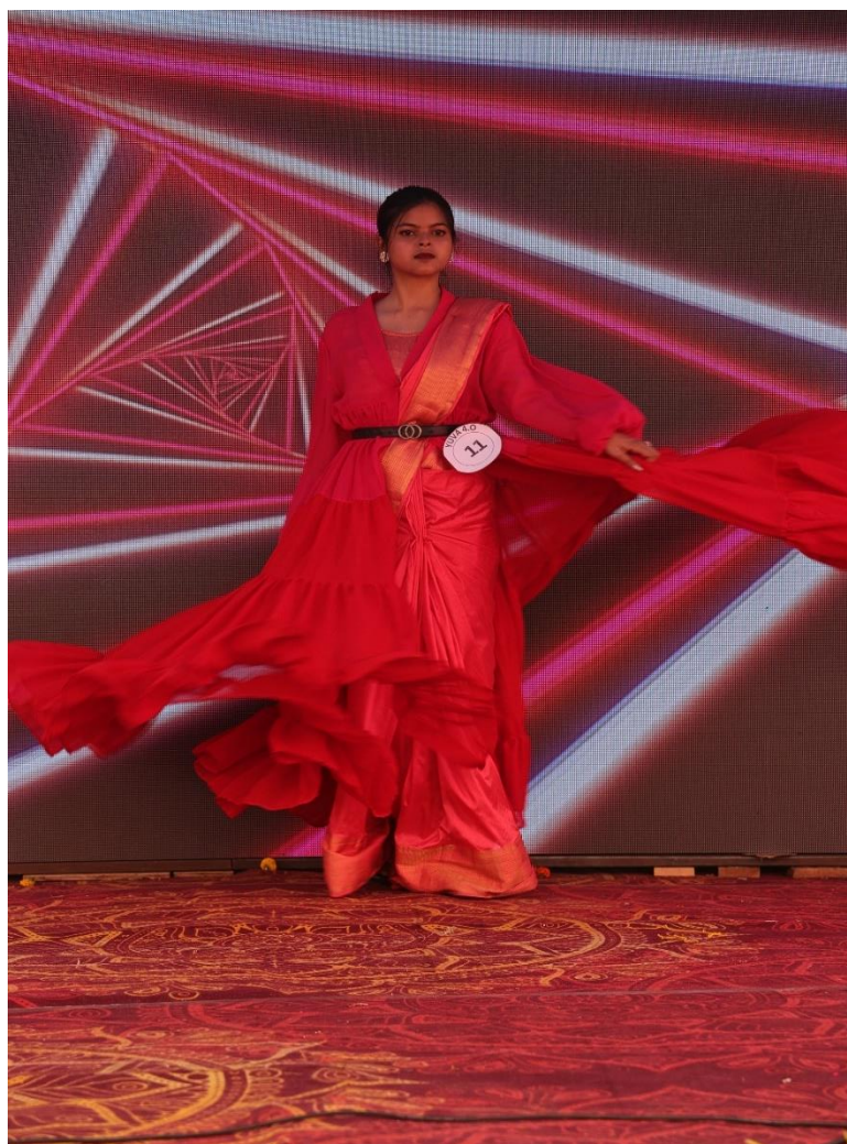
Figure 7: Photo of Fashion Show Competition in YUVA 4.0