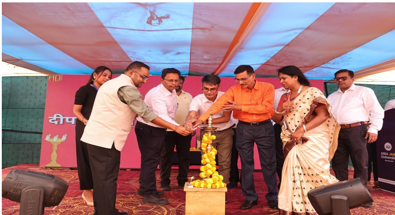
Figure 2: Lamp Lighting Ceremony- YUVA 4.0