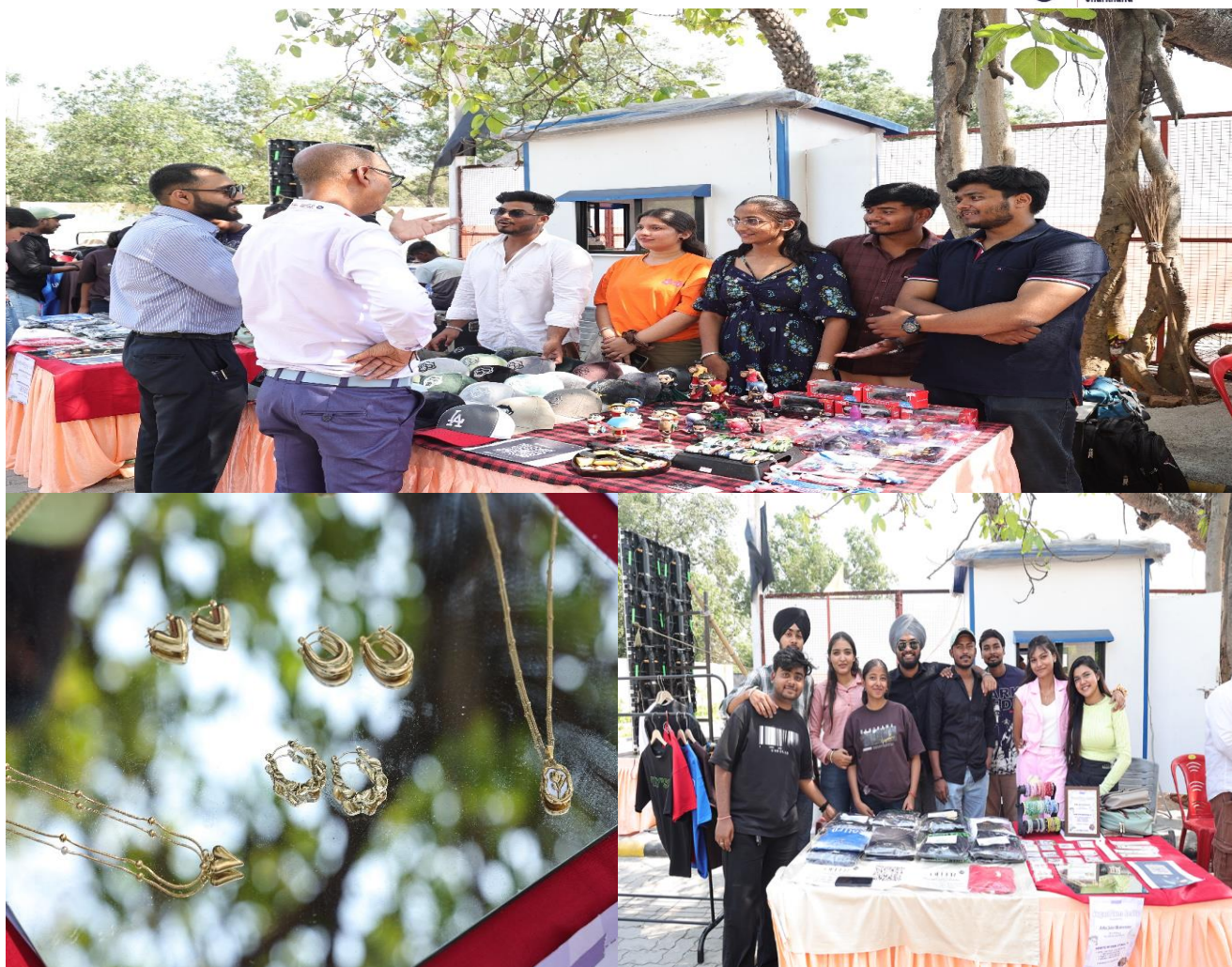
Figure 6: Photo of Emerging Entrepreneurs of SCOM selling their products in YUVA 4.0