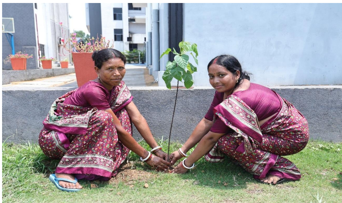
Fig.5 Tree plantation