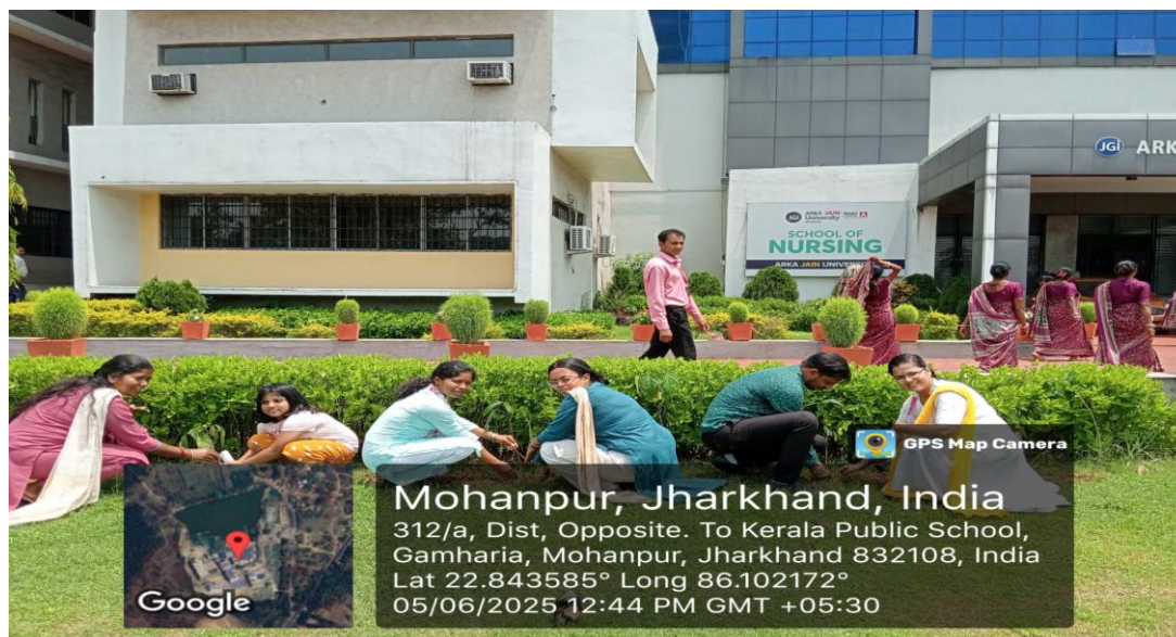
Fig .1 Tree plantation