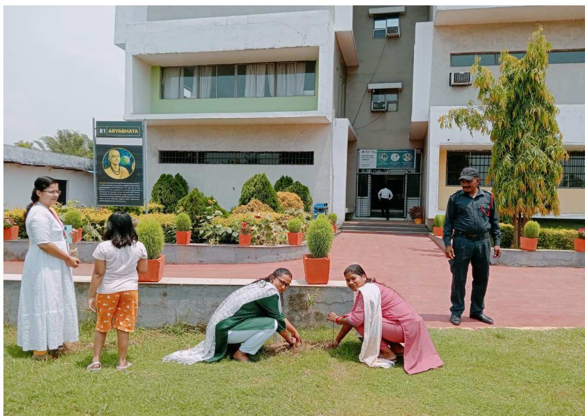
Fig .2 Tree plantation