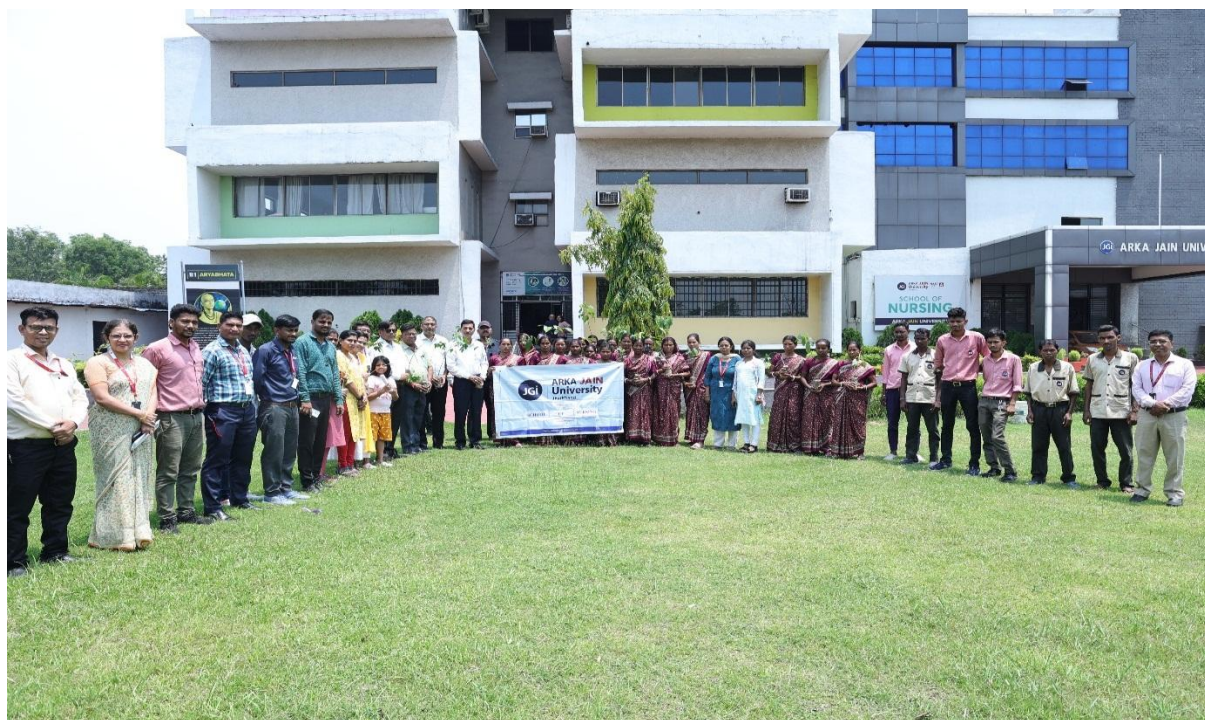
Fig.3 group photo of the world environment day