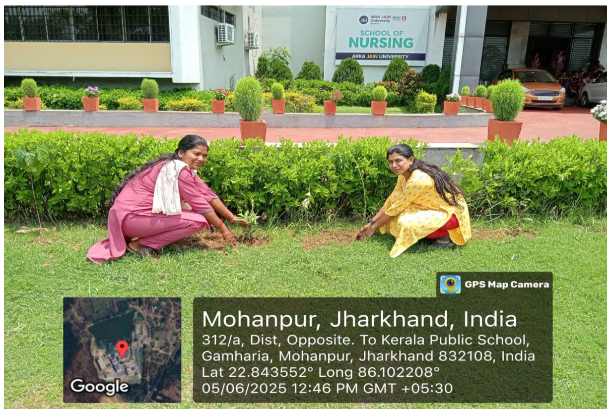
Fig.4 Tree plantation