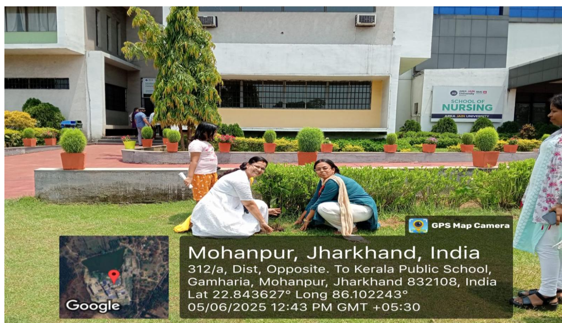
Fig.6 Tree plantation