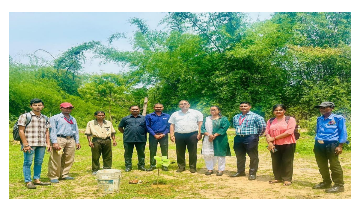
Fig. 3 - Resource Persons and Participants in a frame at the end