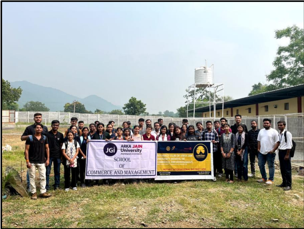
Figure 3: Group photo during the visit