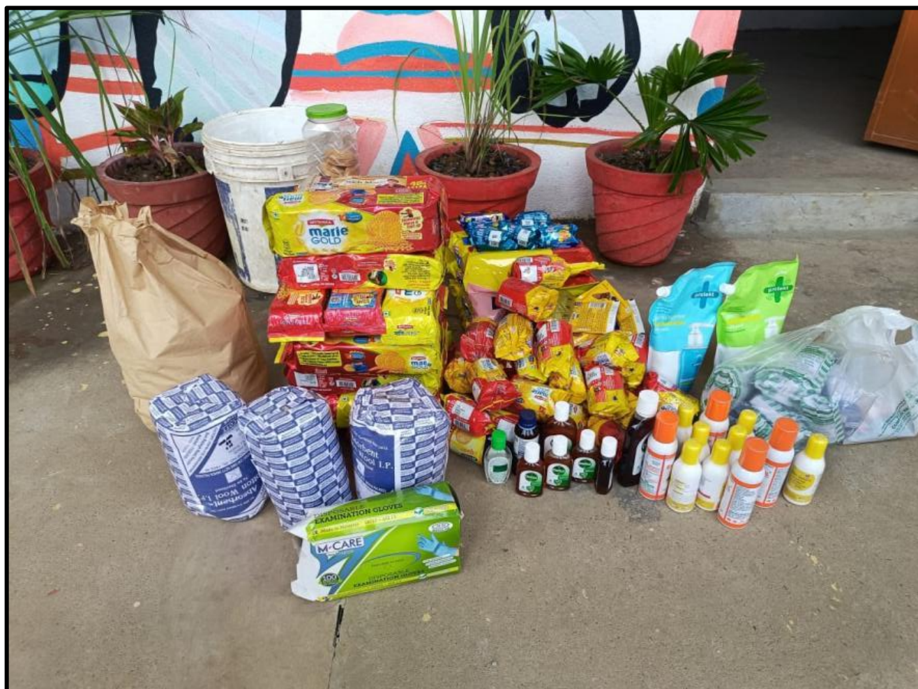
Figure 2: Essentials donated at Stray Army, Dalma