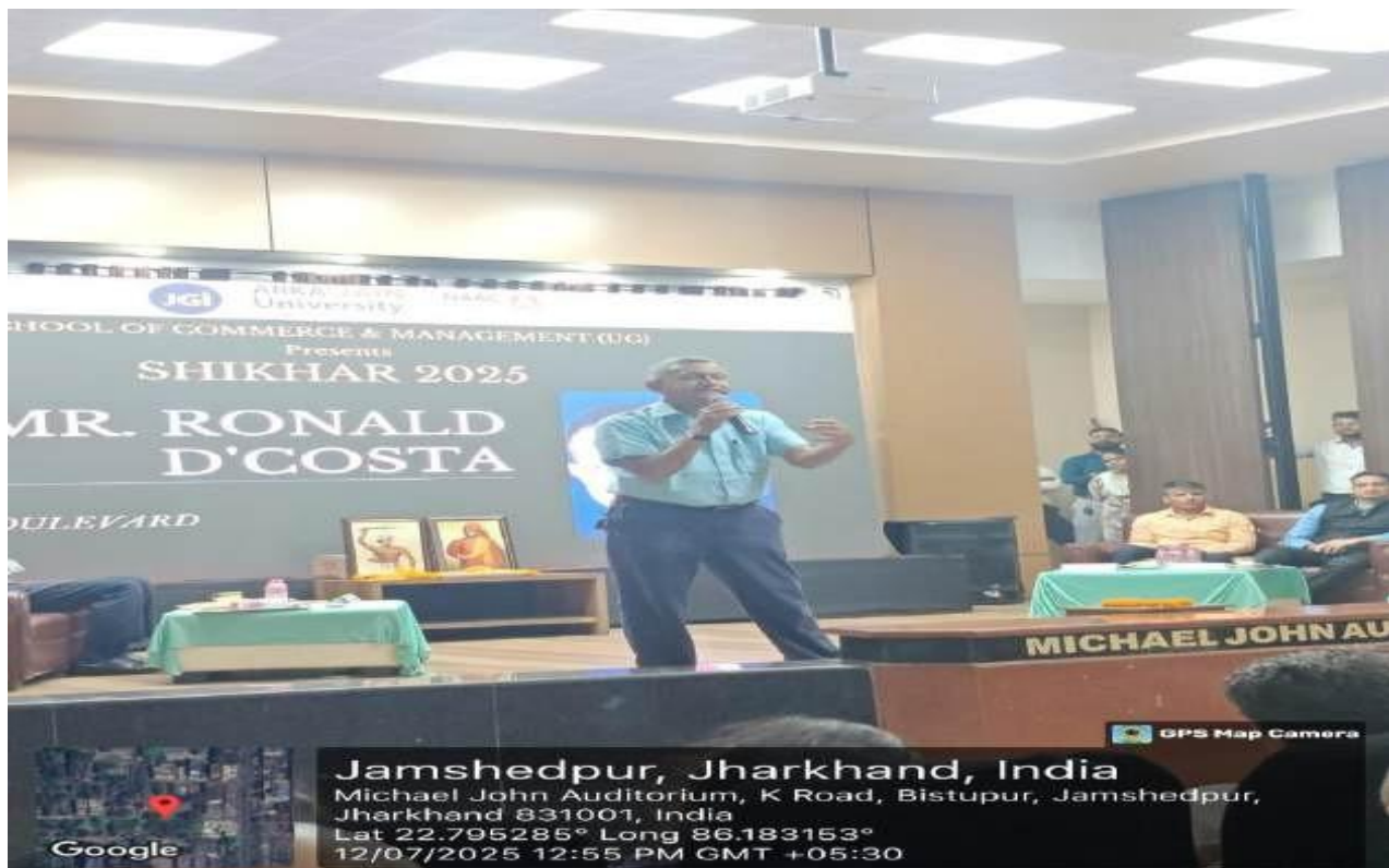
Figure 6: Photo of Guest Speaker addressing the students.