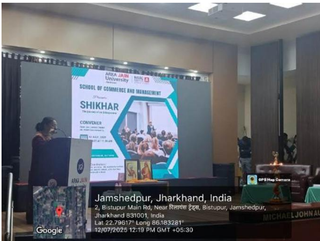
Figure 4: Photo of Faculty Member Introducing the Event