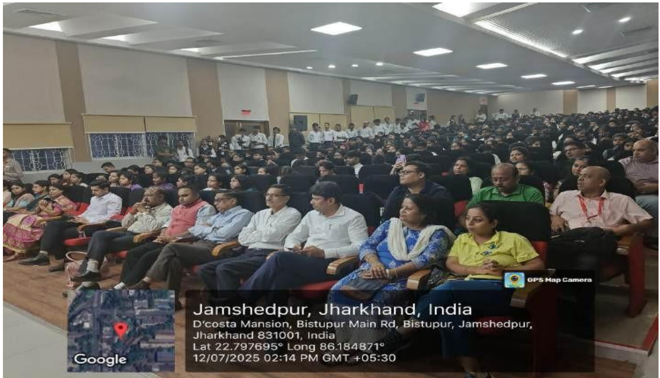
Figure 5: Photo of Faculty members and students listening carefully the event.