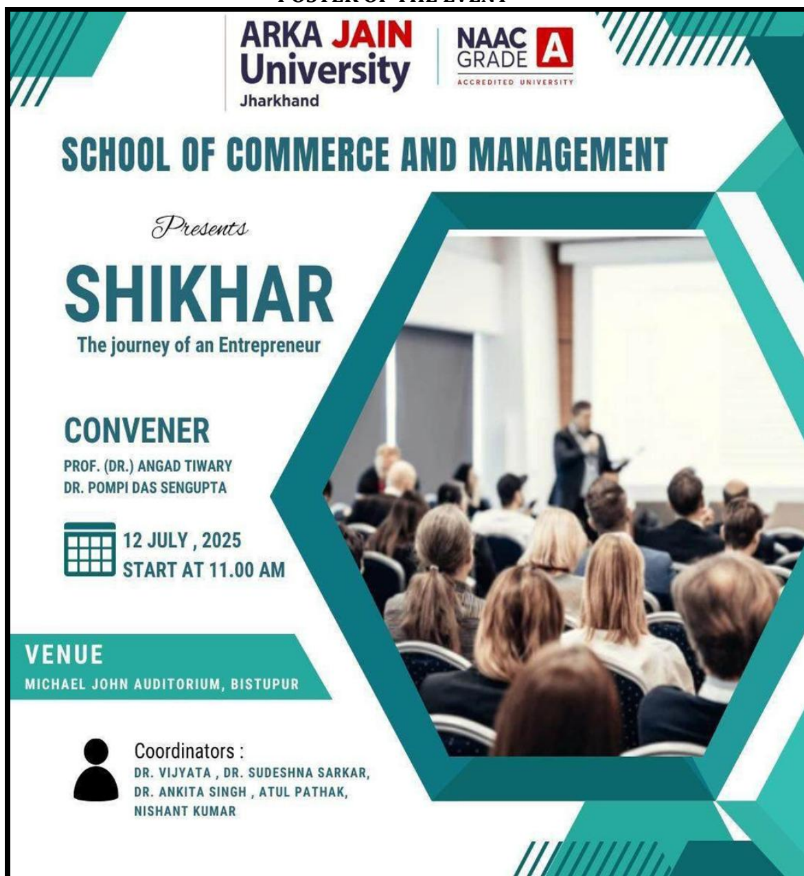
Figure 1: Poster of the Event Shikhar 2025- The Journey of an Entrepreneur