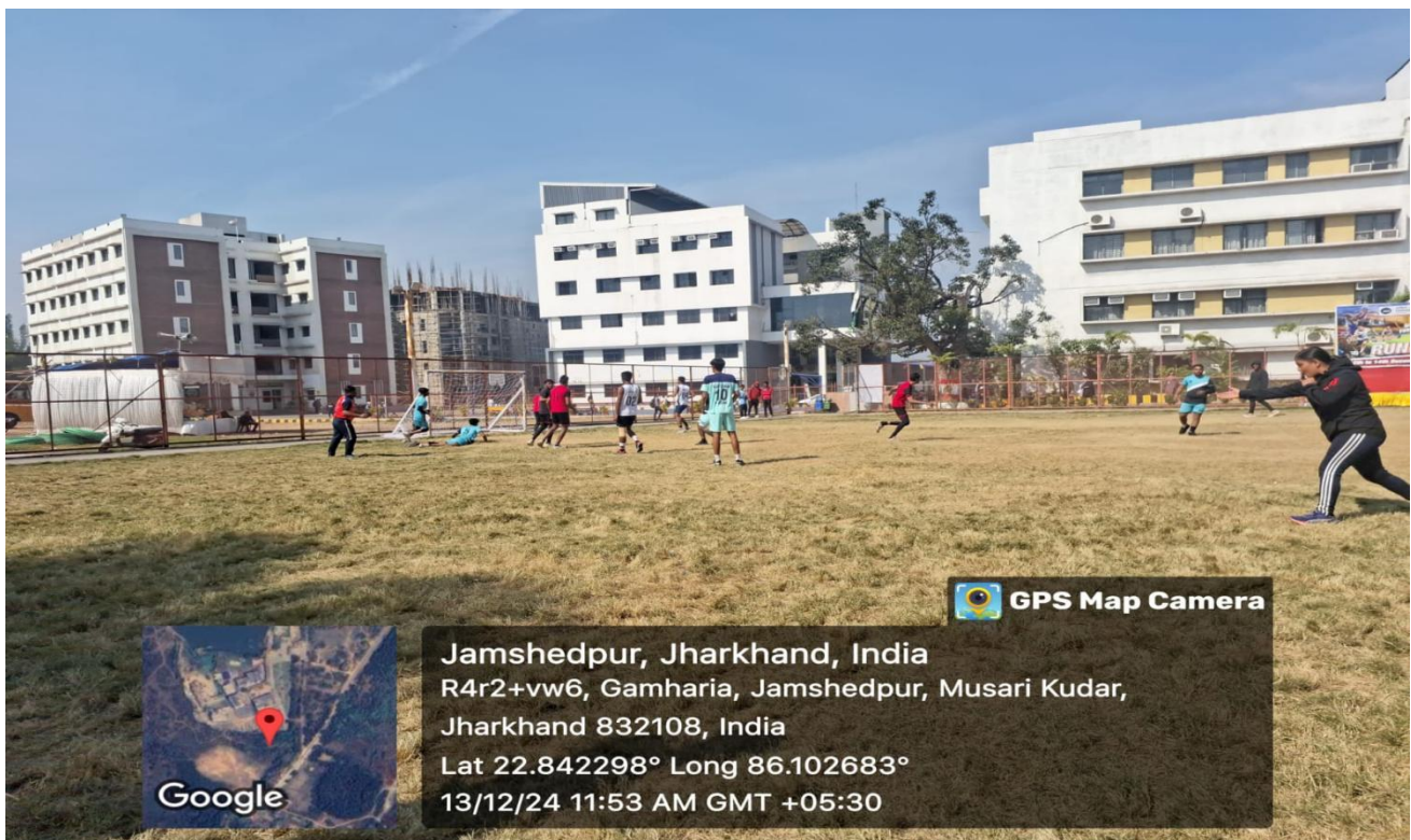
Photo 1: Runbhoomi (Hand Ball- Boys) 2024-25 winner & runner up team

Jamshedpur, Jharkhand, India R4r2+vw6, Gamharia, Jamshedpur, Musari Kudar, Jharkhand 832108, India Lat 22.842298° Long 86.102683° 13/12/24 11:53 AM GMT +05:30