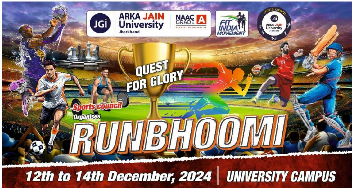
Poster of the Event: Runbhoomi 2024