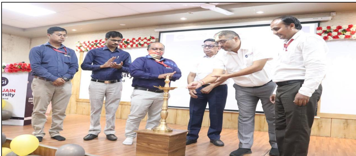
Figure 4: Dignitaries lighting the lamp to inaugurate the farewell event.