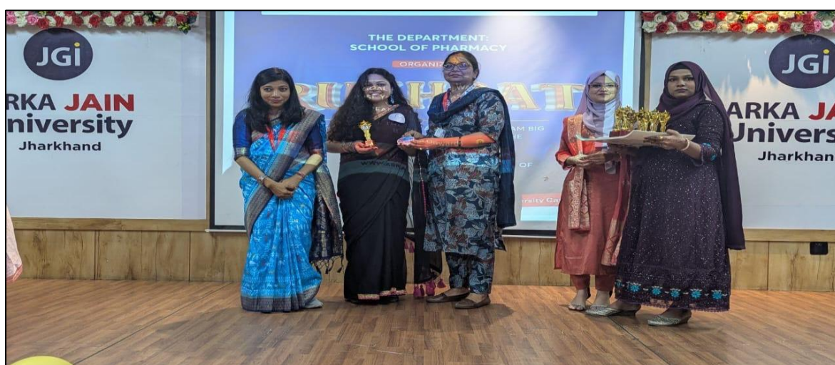
Figure 6: Faculties presenting memento to the outgoing batch.