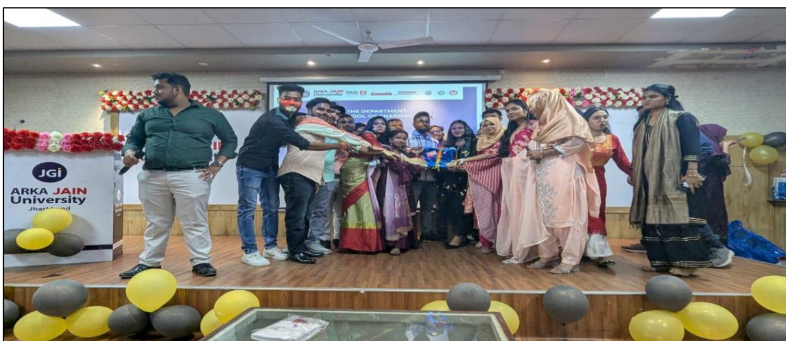
Figure 5: The Outgoing Batch presenting token of appreciation to their juniors.