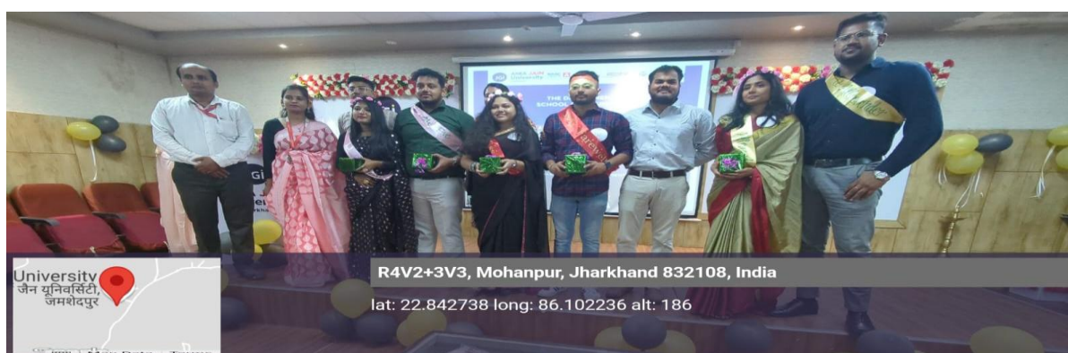
Figure 3: Mr. Farewell and Ms. Farewell along with Mr. and Ms. Eve, Mr. and Ms. Allrounder , and Faculty members of School Pharmacy.