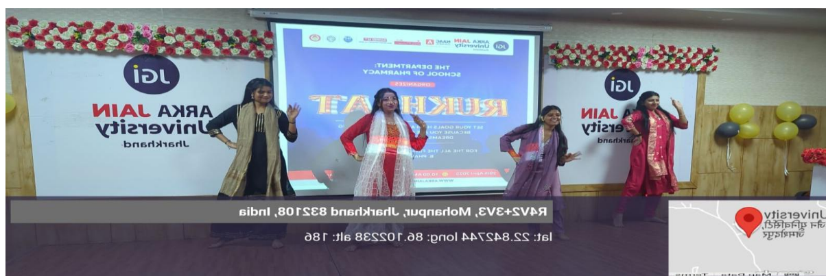
Figure 2: Students performing during the auspicious occasion.