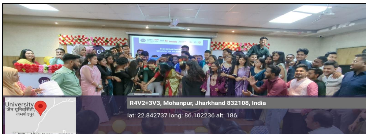
Figure 1: Final year B. Pharm students reminiscing and reliving cherished memories as they gather for the cake-cutting ceremony.