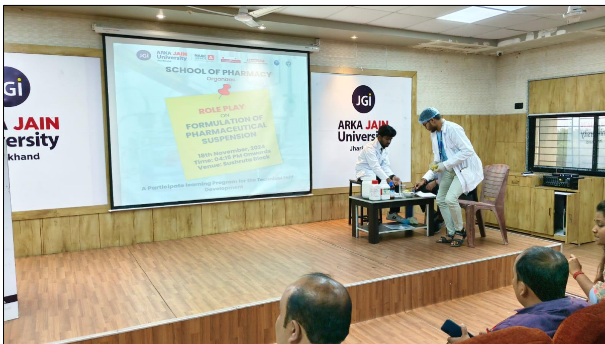
Student acting for explaining the formulation of suspension