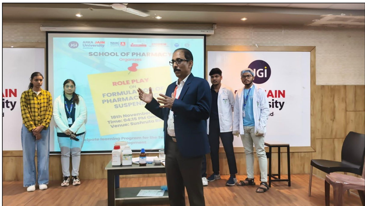
At the end of the play subject teacher explaining