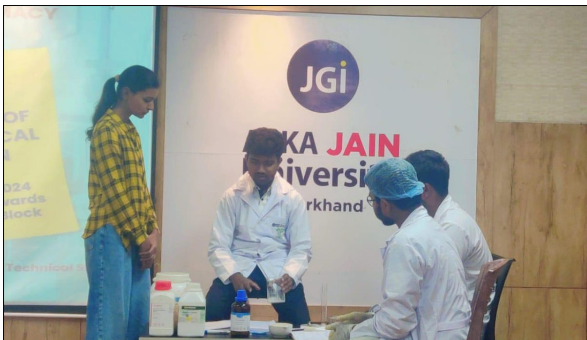
Actors discussing how to formulate suspension