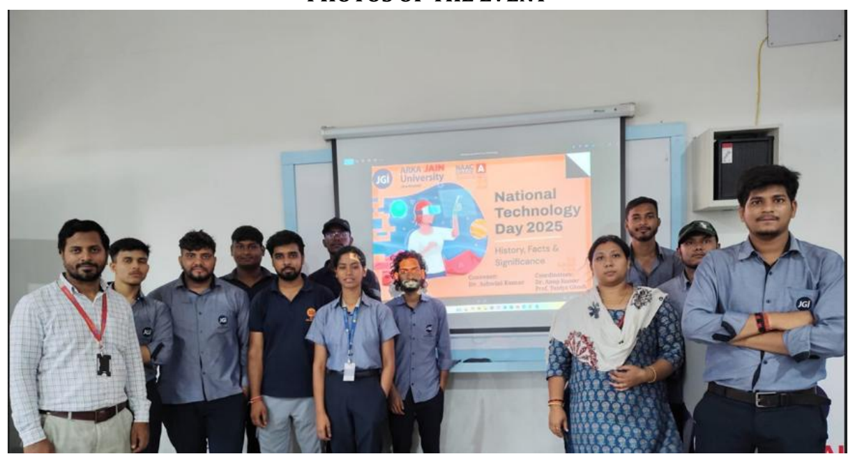
Fig.1- Celebration of National Technology Day