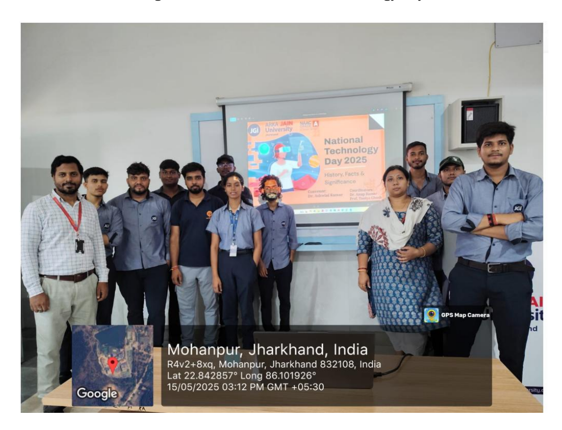
Fig. 2- Geotag Photo Celebration Of National Technology Day