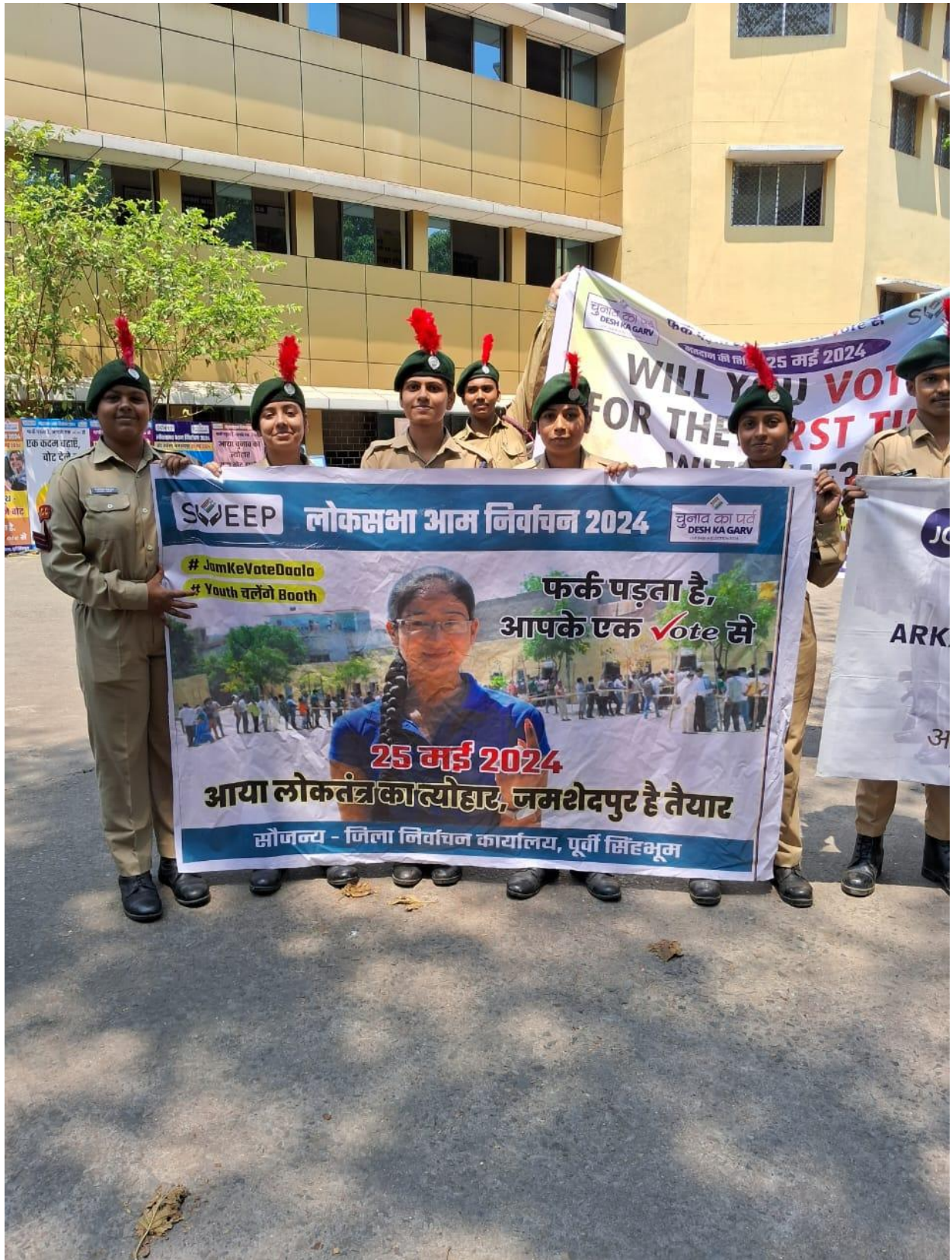
Fig 4: Awareness Programme