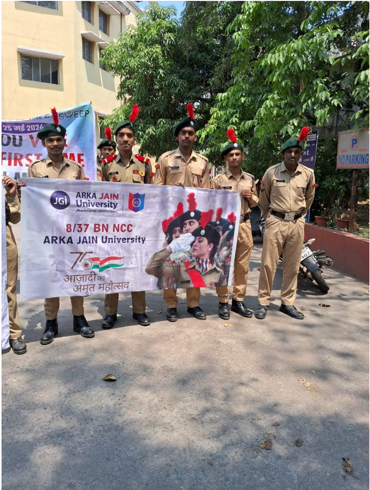
Fig 3: Awareness Programme