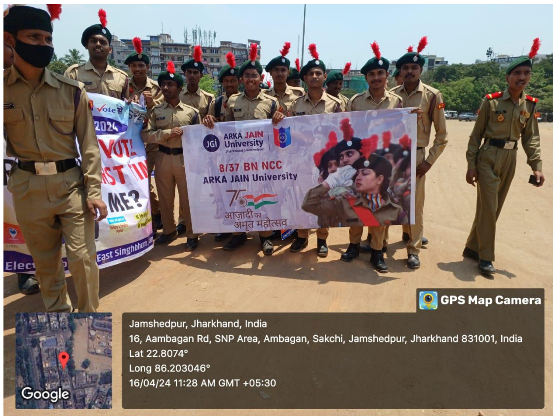
Fig 5: Awareness Programme