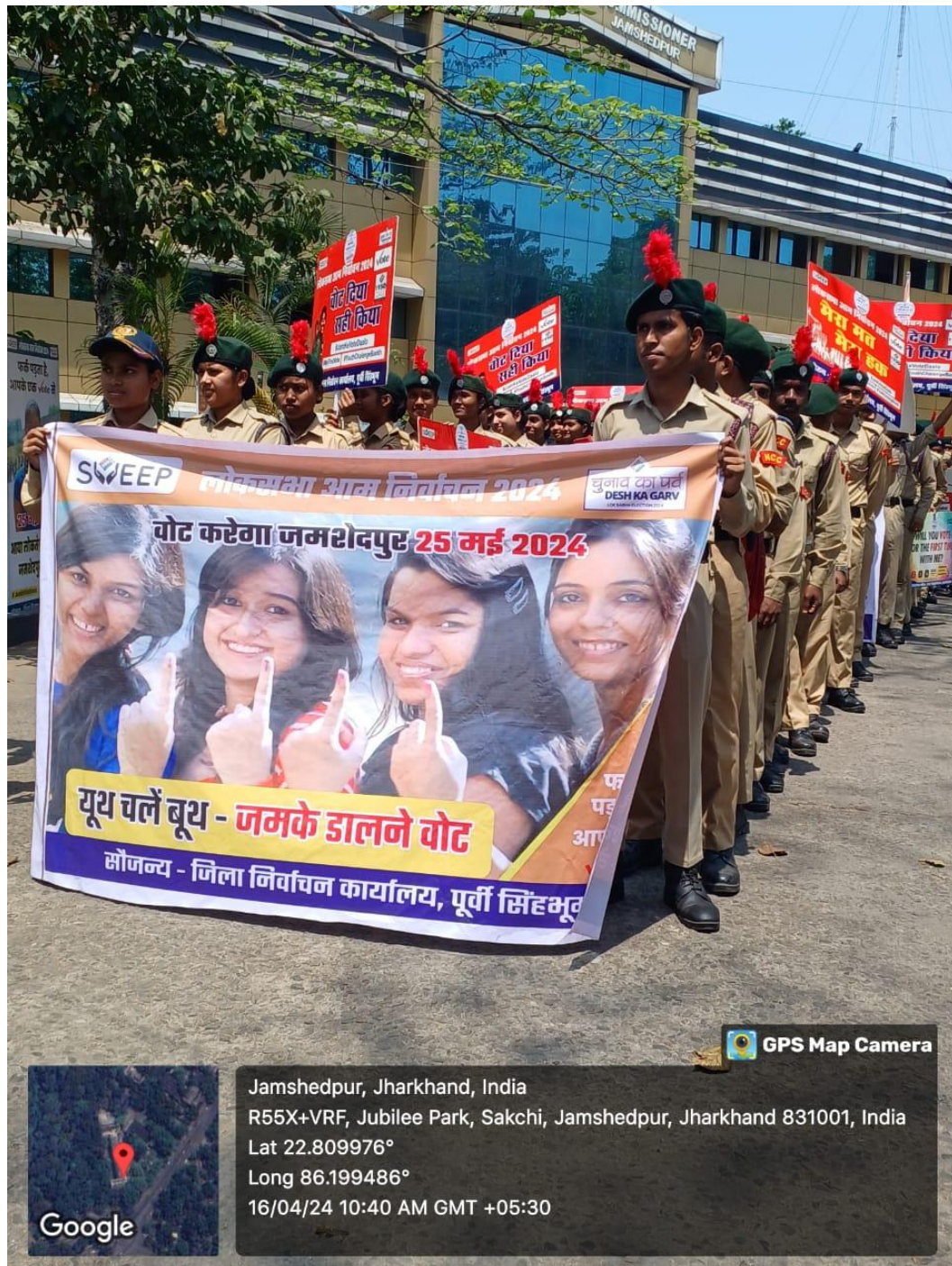
Fig2: Geo Tag Photo of the Event