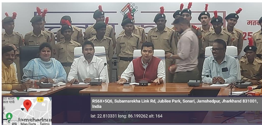
Fig 6: Awareness Programme