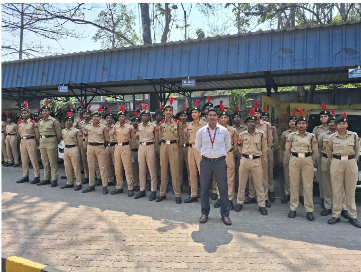
Fig 1: Group Photo