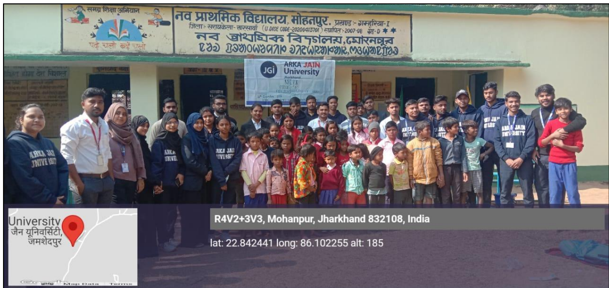
Faculties and students of School of Pharmacy with the faculties and students of Mohanpur Primary School