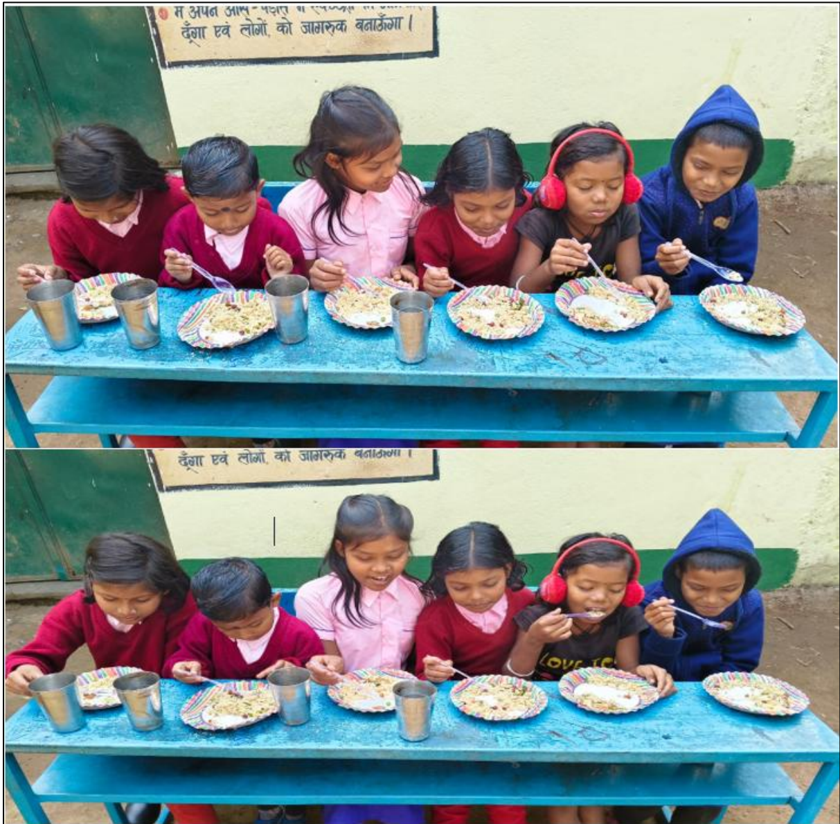
Primary students of Mohanpur School enjoying the food