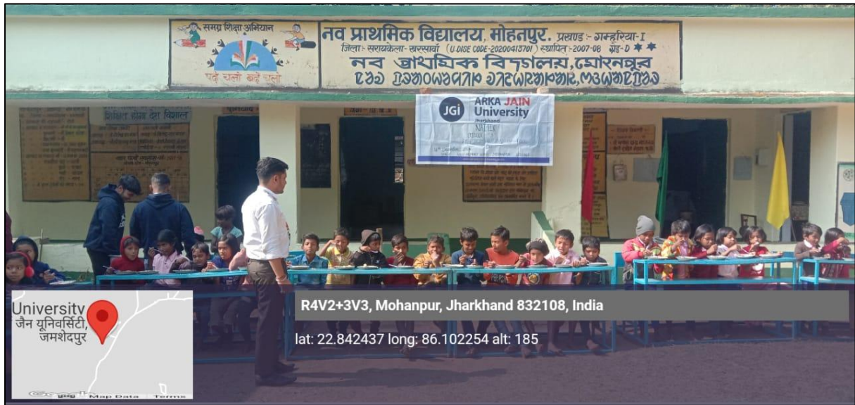
Geotag glimpses of NAITIK 3 The True Happiness