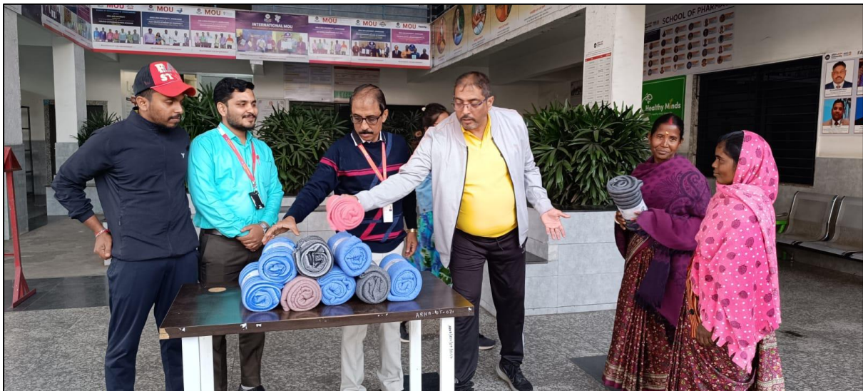
Distributing warm clothes to the departmental house-keeping staff during KANGRI IV