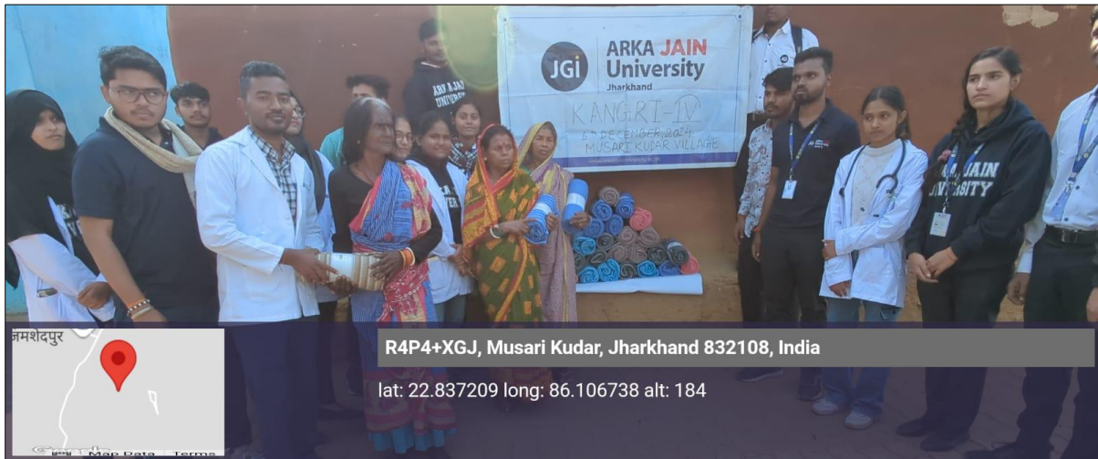
Distributing warm clothes to the under privileged at Musari kudar village in KANGRI IV