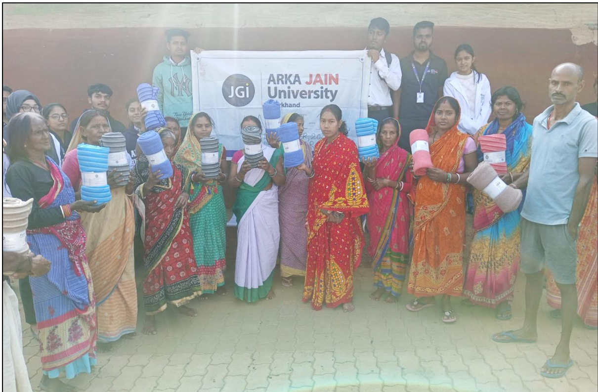
Distributing warm clothes to the under privileged at Musari kudar village in KANGRI IV