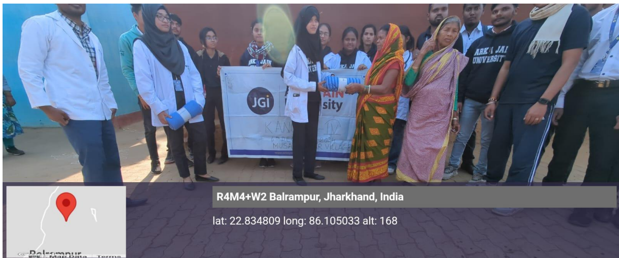
Distributing warm clothes to the under privileged at Musari kudar village in KANGRI IV