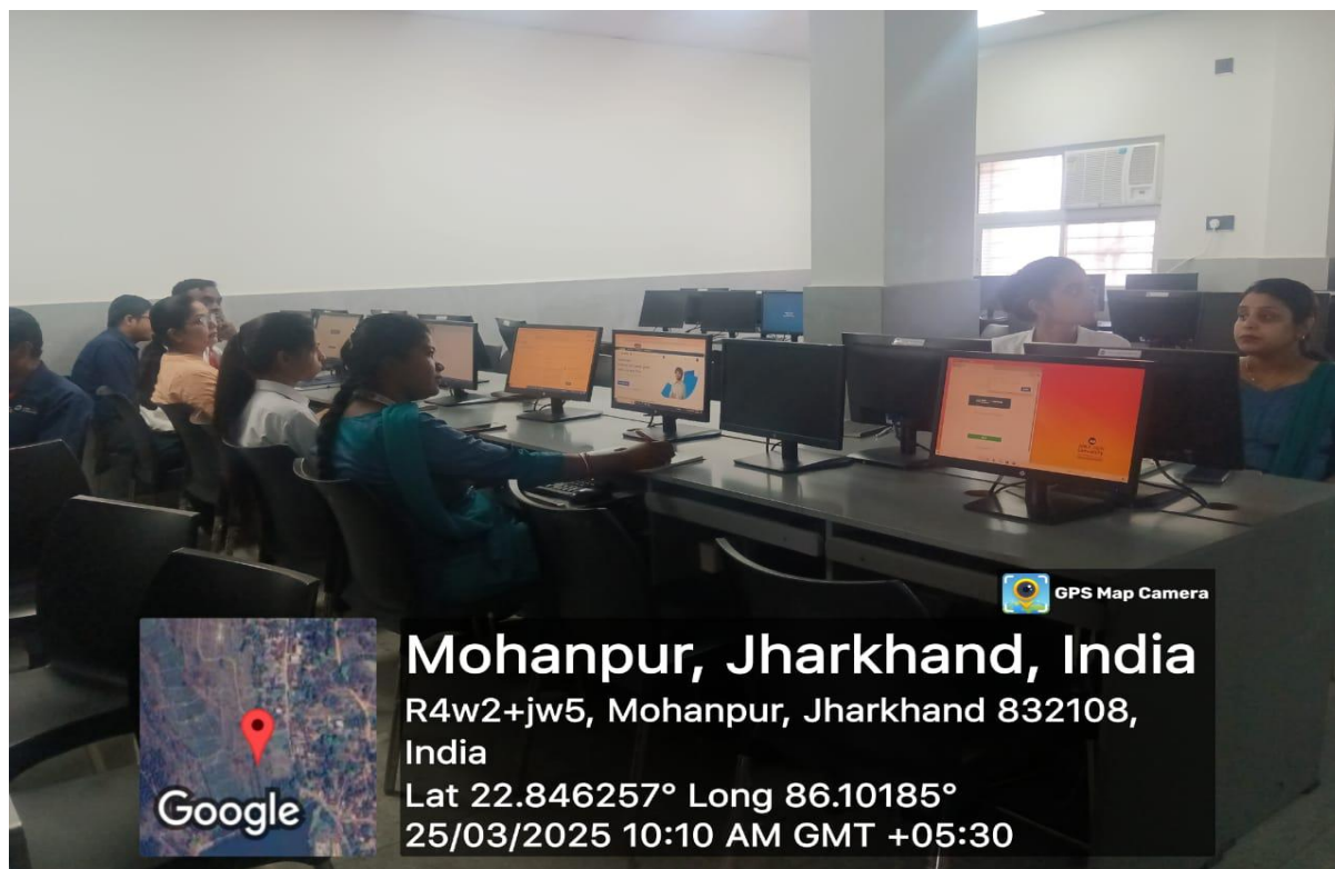
Figure 3: Coursera Learning Leaders and Program Admins attending the Coursera Refresher Session