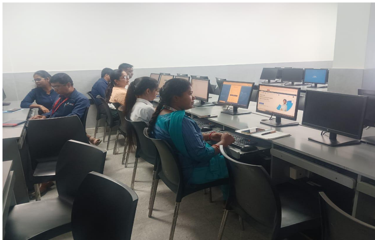
Figure 4: Coursera Learning Leaders and Program Admins attending the Coursera Refresher Session