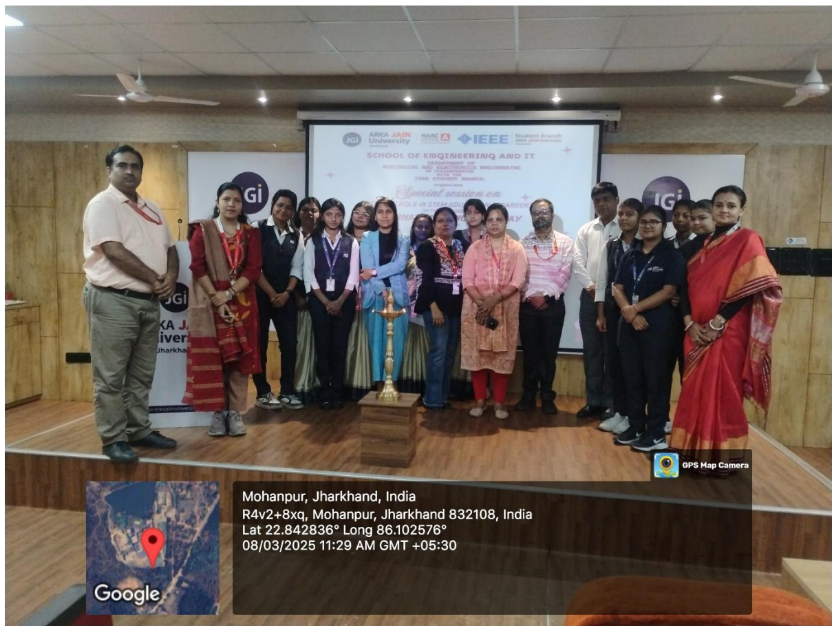
Fig1. Lamp Lighting Ceremony