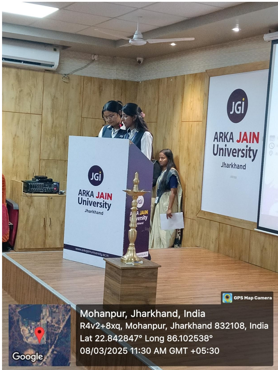
Fig 3. Students Program