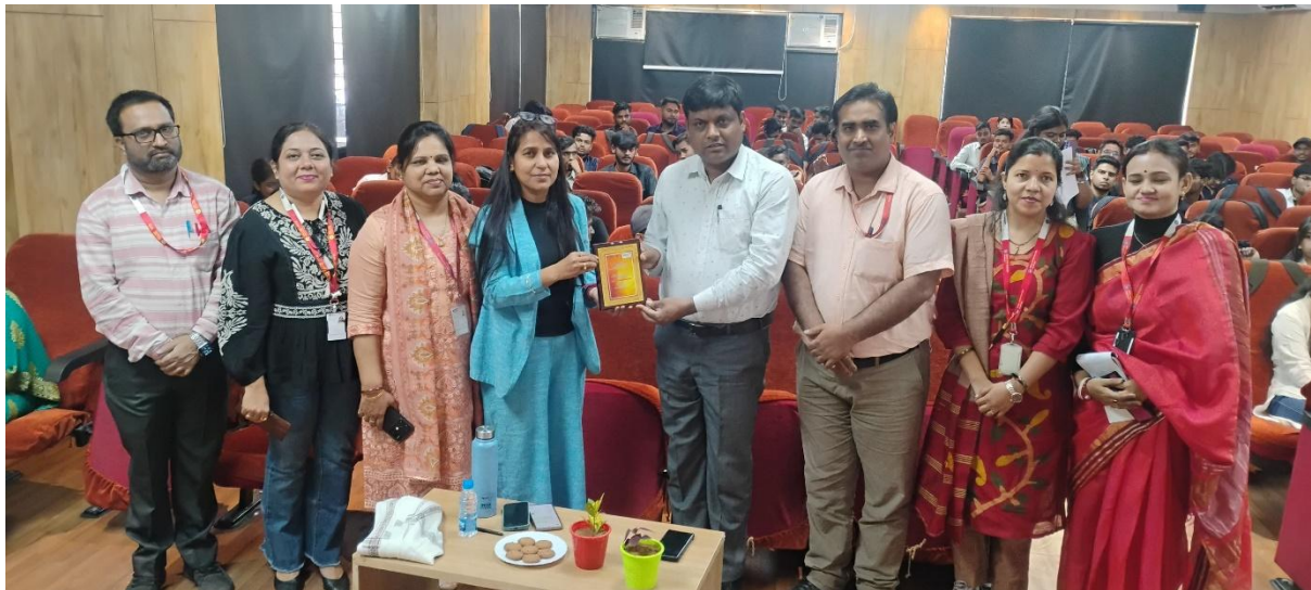
Fig 2. Facilitation of the Guest