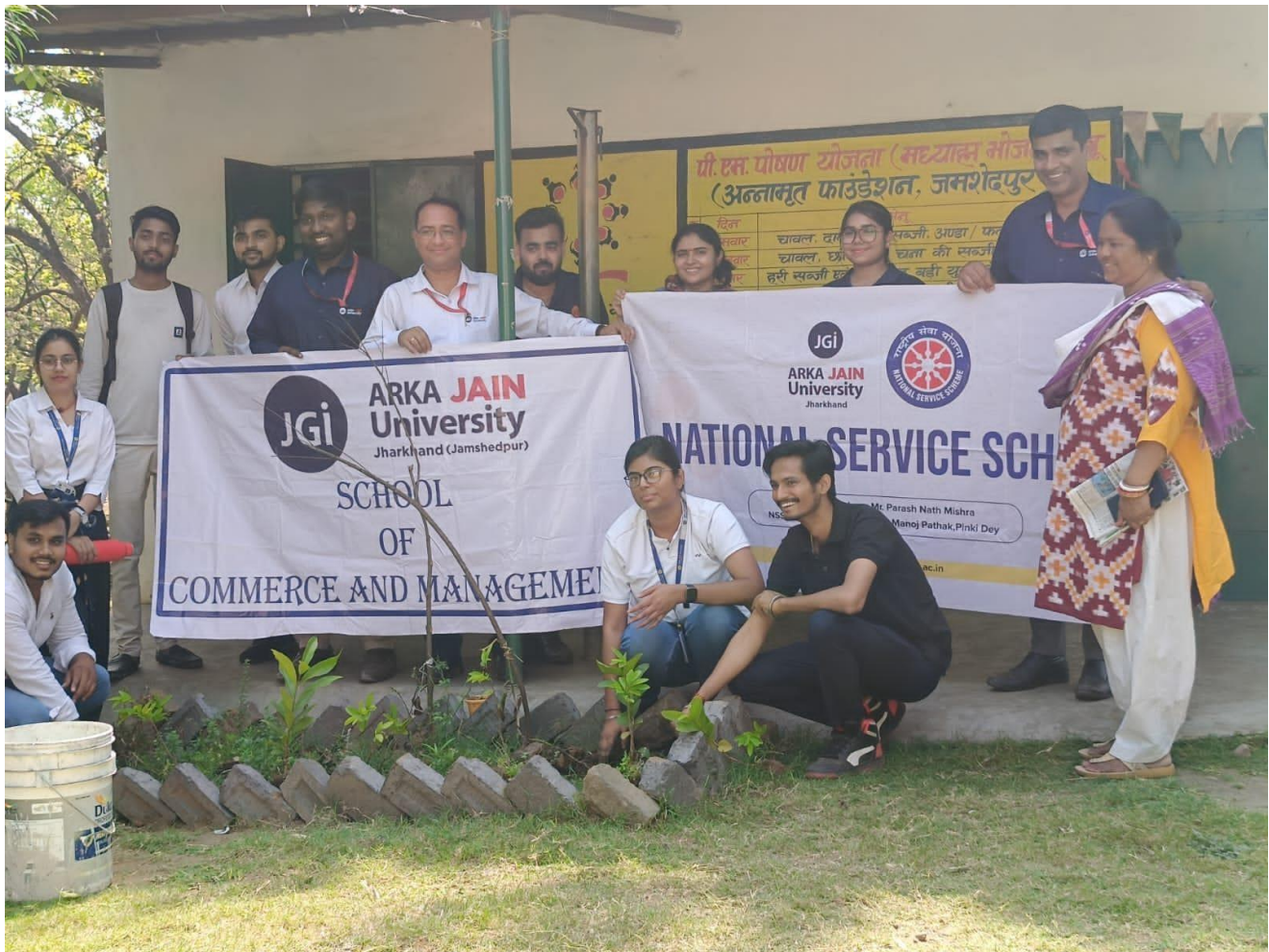
Figure 2: Group Photo at Musari Kuder Village