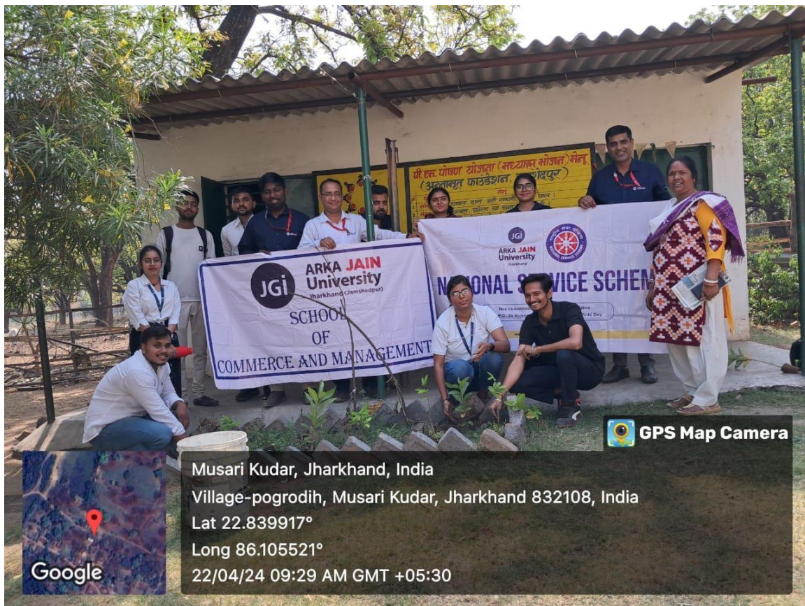
Figure 1: Students of MBA Dept. planting saplings at Musari Kuder Village