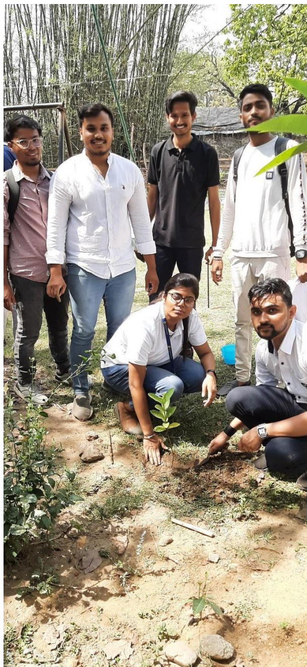
Figure 3: Students are planting samplings