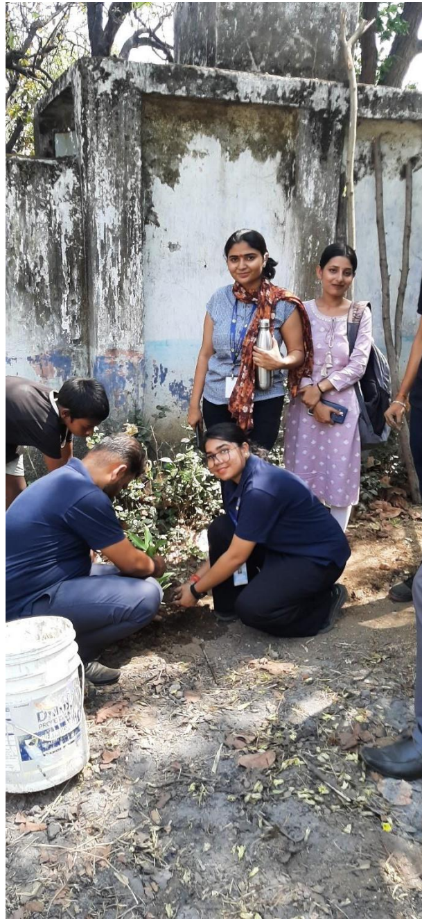
Figure 4: Students of MBA Department planting saplings