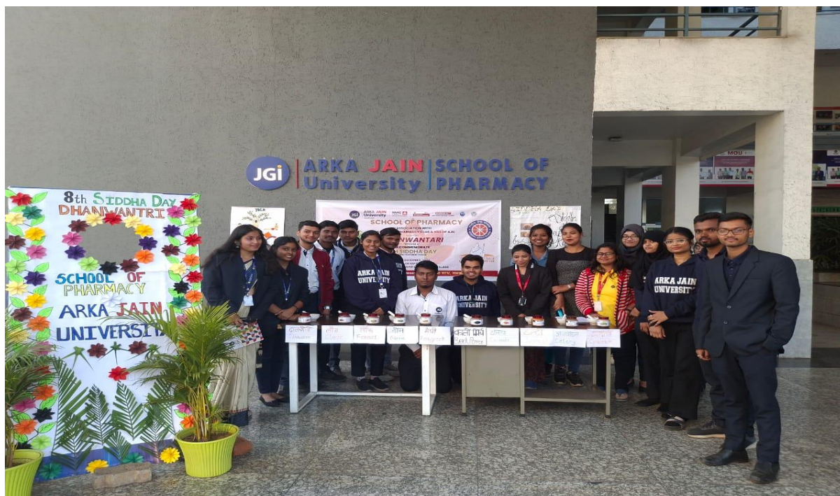
Students observing 8 th Siddha Day 2024