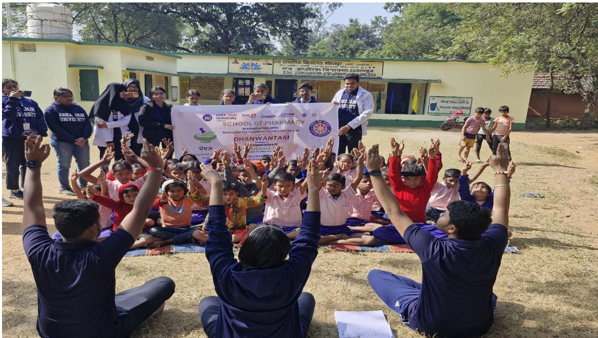
Students of the University trying to train the primary students of Mohanpur New Primary School to add yoga in daily life during 8 th Siddha Day 2024