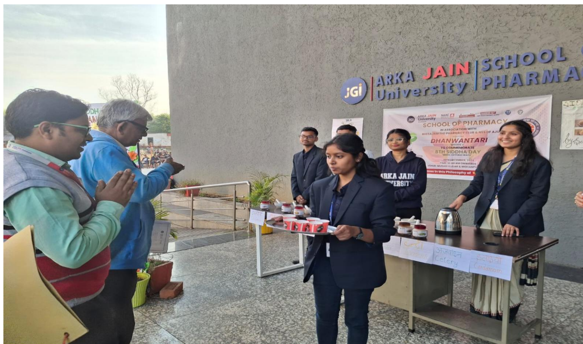
Herbal tea prepared and served by the students during observation of 8 th Siddha Day 2024