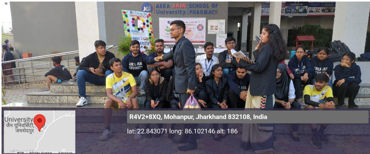
Geotag glimpses of the event 8 th Siddha Day 2024