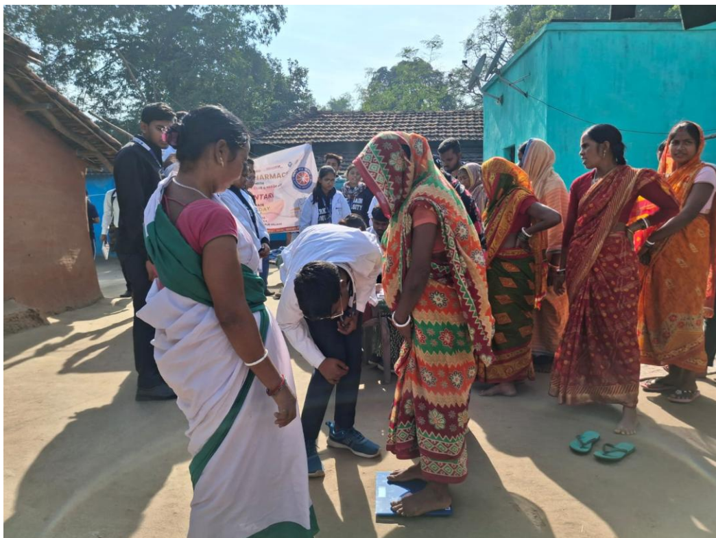
Health camp at Musari kudar village during 8 th Siddha Day 2024