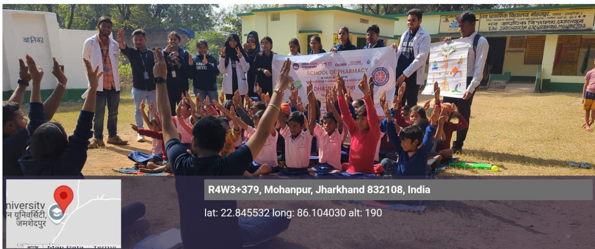
Geotag glimpses of the event 8 th Siddha Day 2024