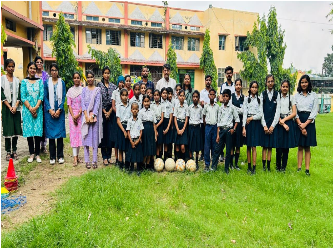
Fig 04:- Resource Persons and Participants in a frame at the end