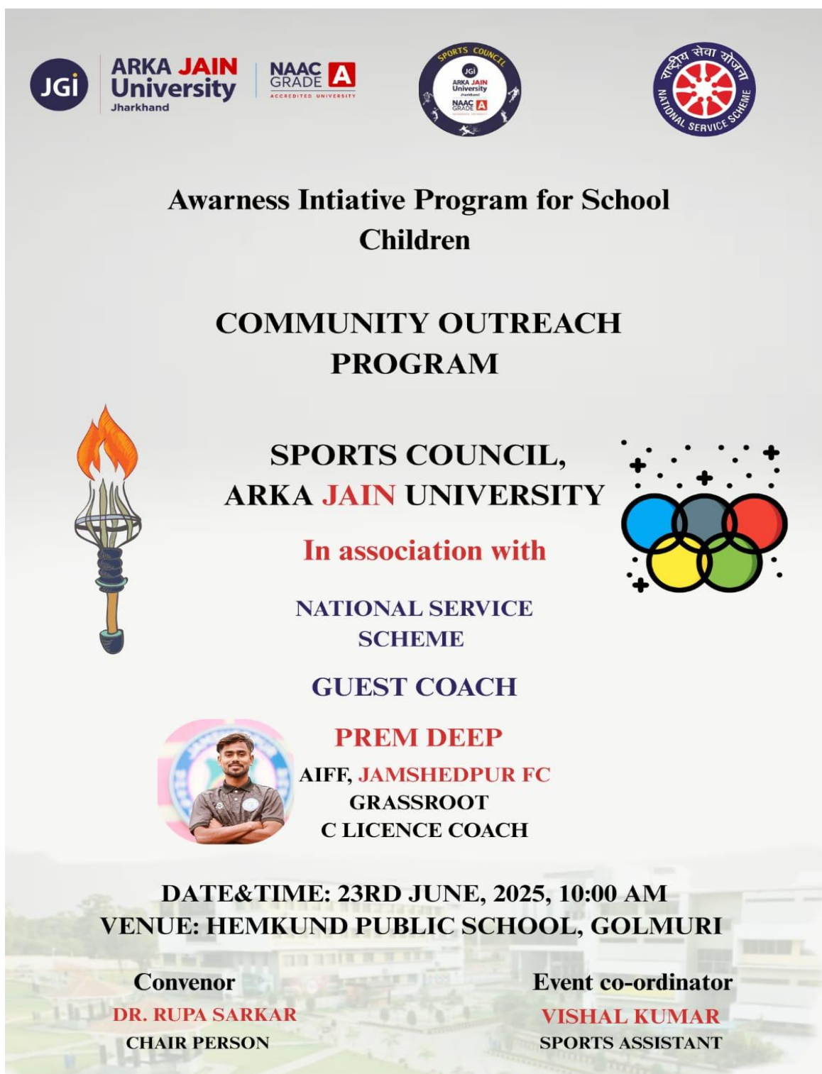
Fig.1- Poster of the Event