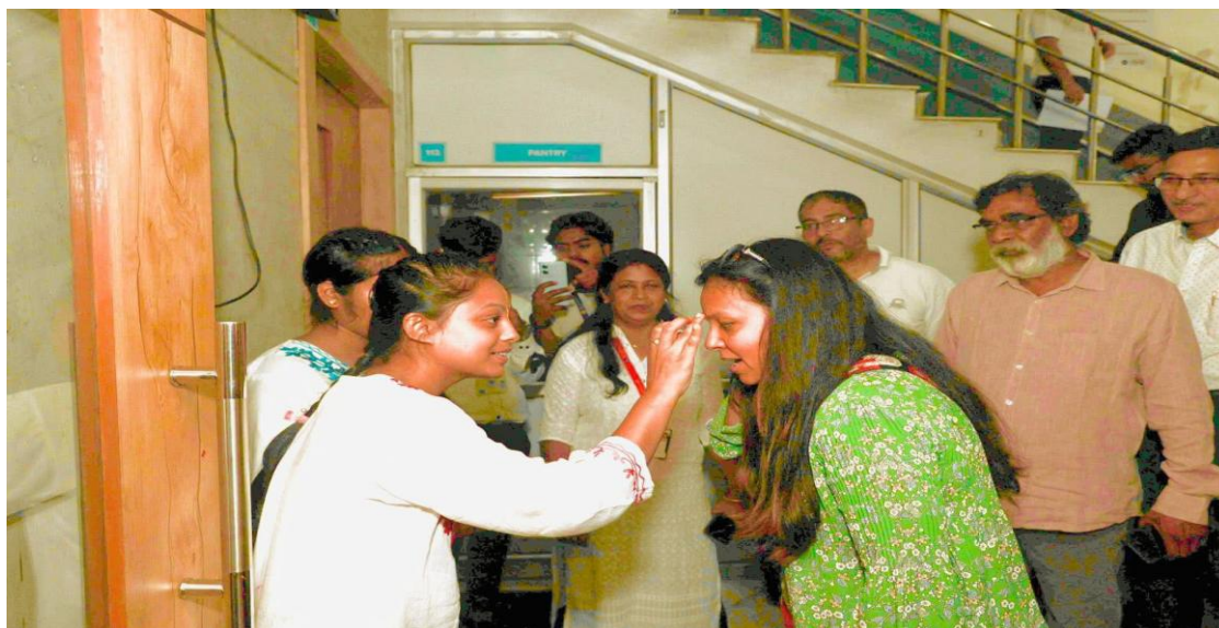
Fig. 2: On the day of the Opening ceremony, the guest dignitary (Head of Sports, JRD Tata Sports Complex) is welcomed with a traditional tilak.