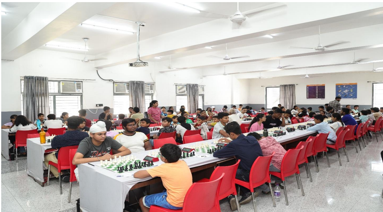
Fig. 4: Day 1 Players playing during the chess tournament.