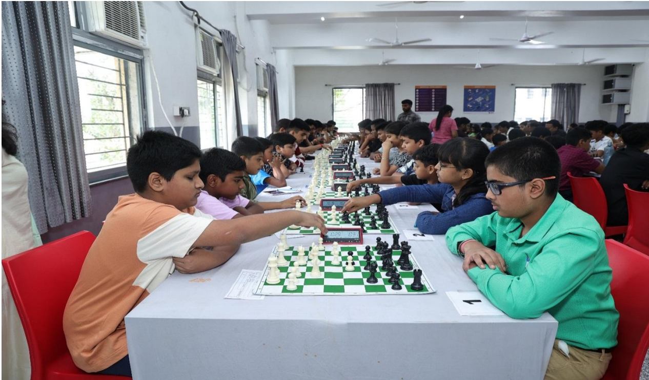
Fig. 5: Day 2 Players playing during the chess tournament.