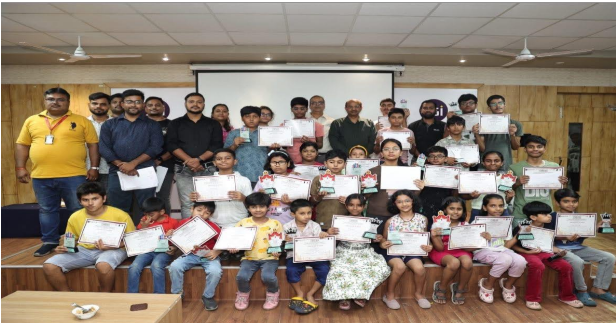
Fig. 8: Group photo of the winning players with the guests.