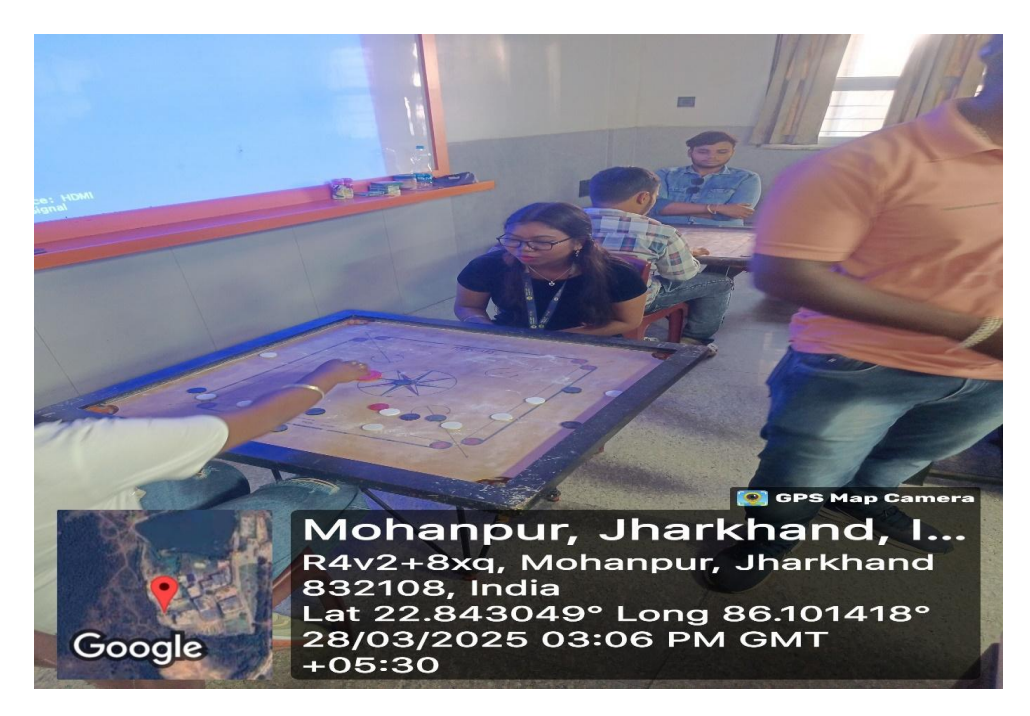
Fig 2: Students Playing Carrom