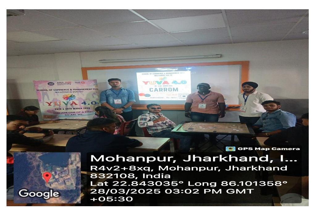
Fig I Photo During Competition