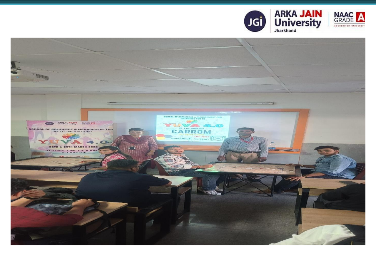
Fig 3: Students Enjoying Carrom Competition