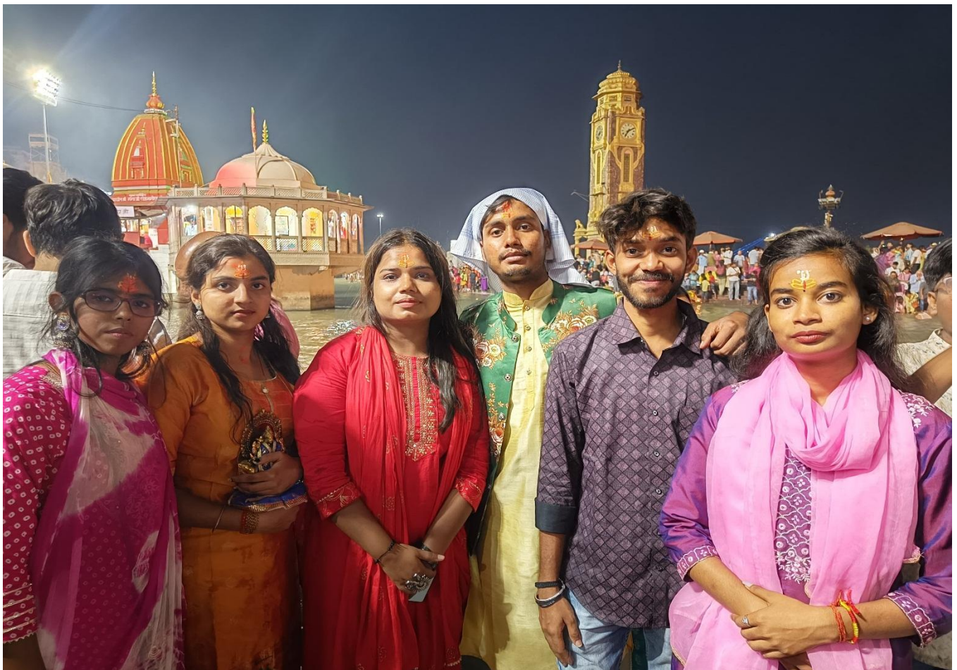
Fig 6 :- Students participated in the Ganga Aarti