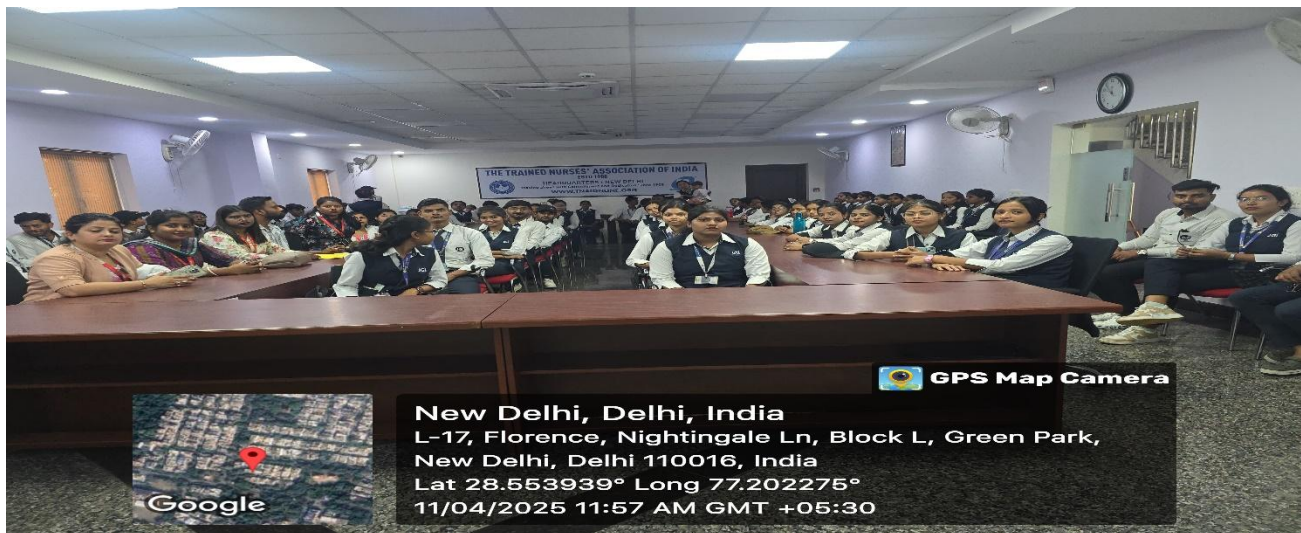
Fig 5 :- Students attending a session at TNAI, New Delhi