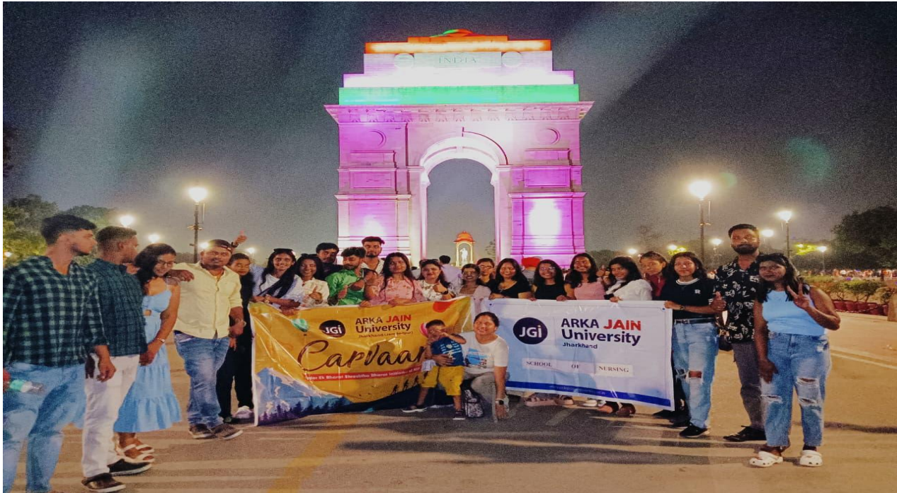
Fig.3: Visit to India Gate