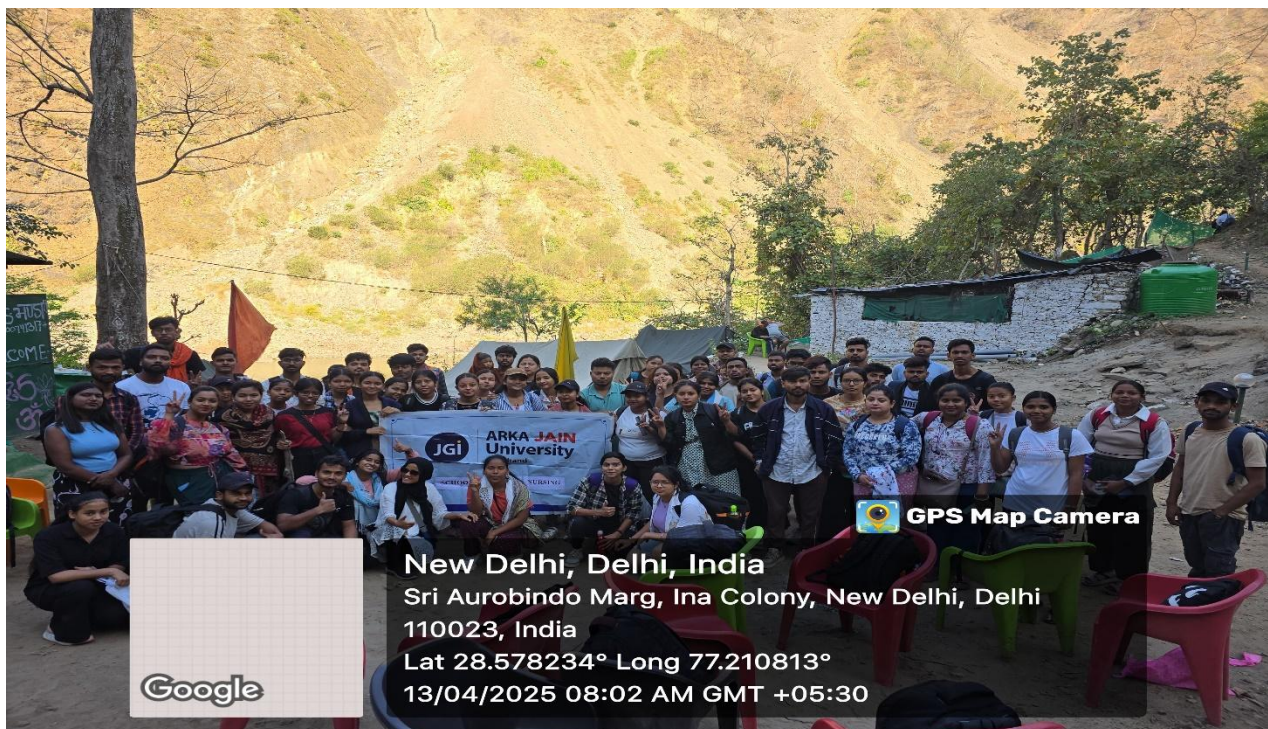
Fig.2: Students having Basecamp at Rishikesh