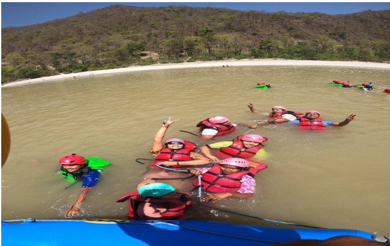
Fig.4: Students Boat Rafting at Rishikesh