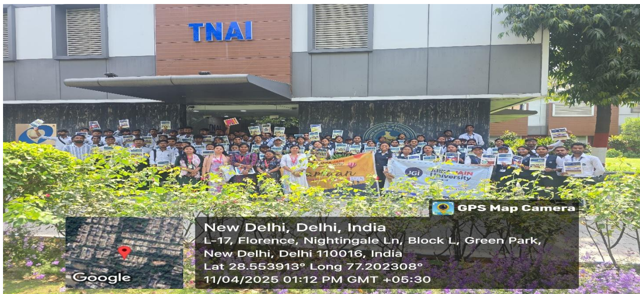
Fig.1: Students visit to TNAI along with Faculties