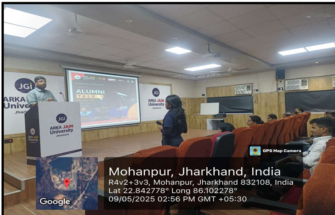
Fig. 2- Question and answer session with alumni