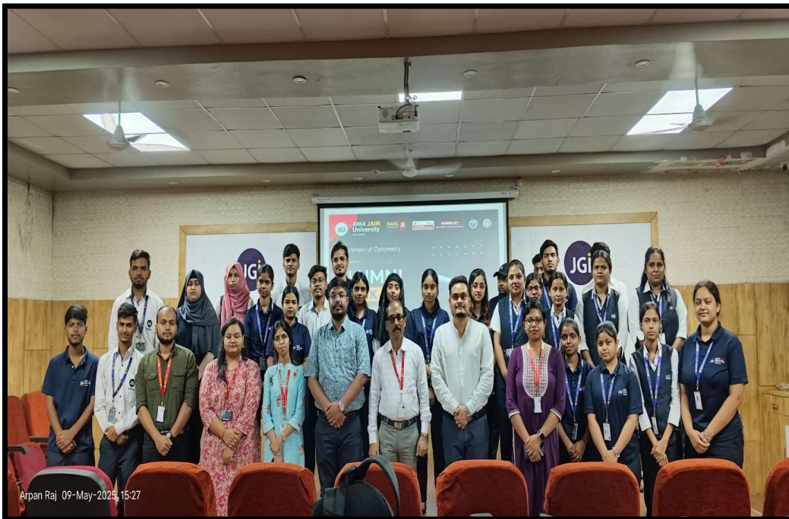
Fig. 4- Faculties and students attending the Program