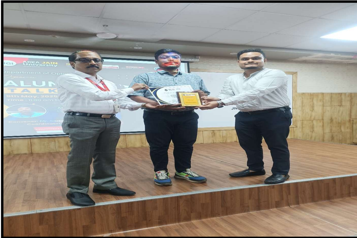
Fig. 3- Certificate of appreciation and memento giving ceremony