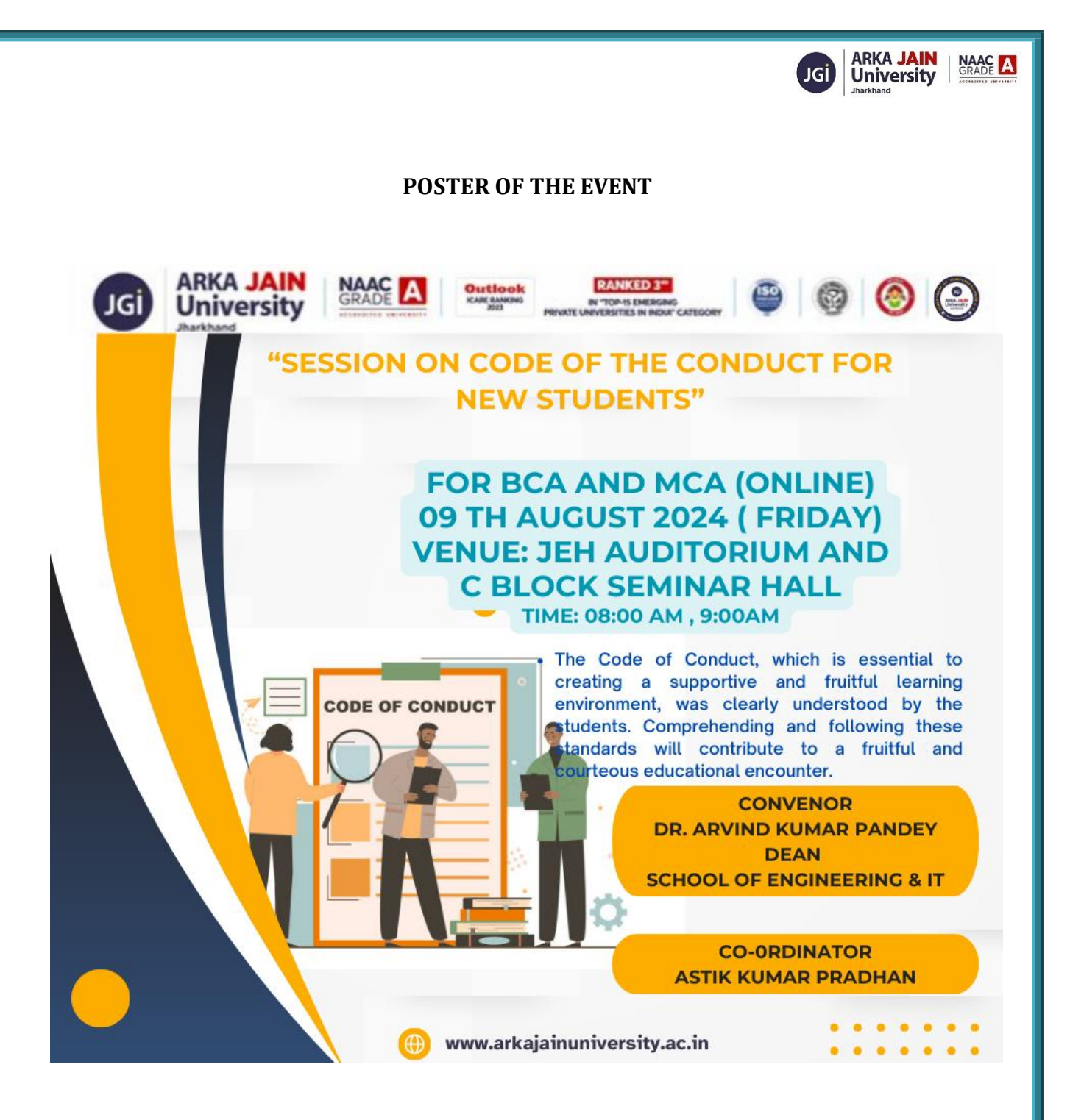
Figure 1: Poster of An Introductory Session on Code of Conduct for New Students