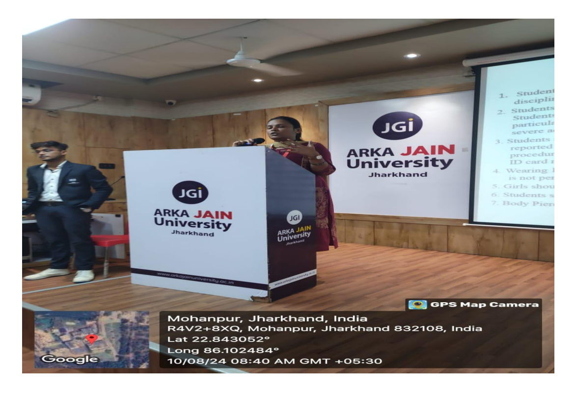
Figure 2: Photo of An Introductory Session on Code of Conduct for New Students