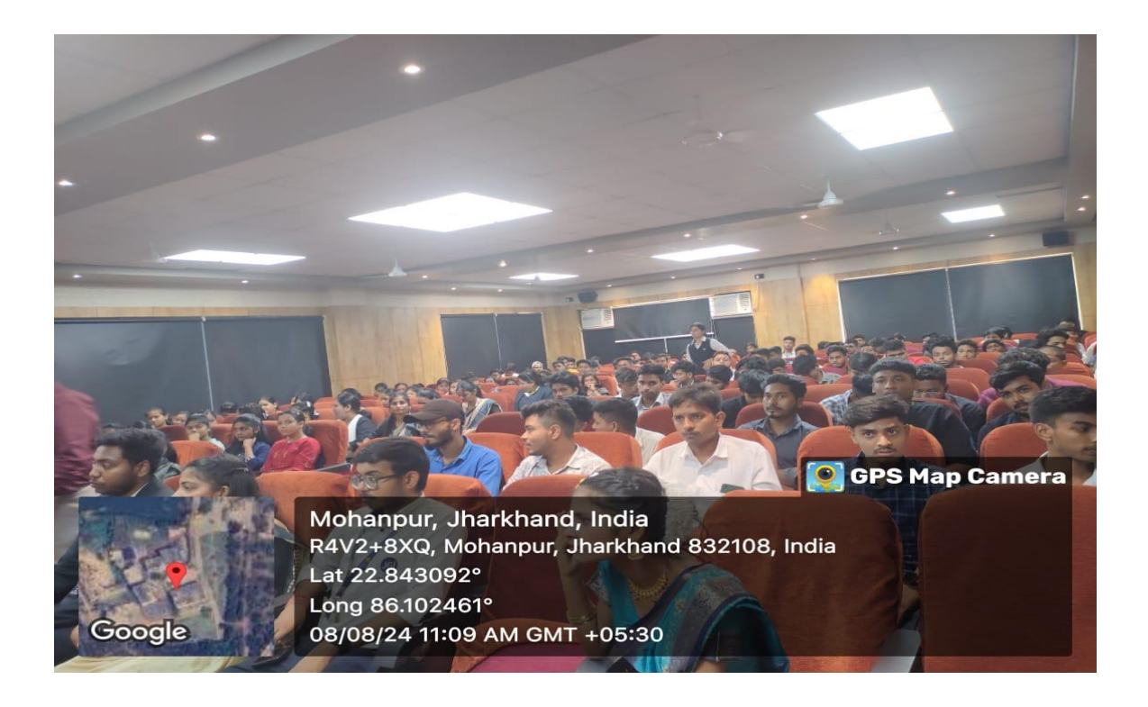
Figure 5: Photo of An Introductory Session on Code of Conduct for New Students