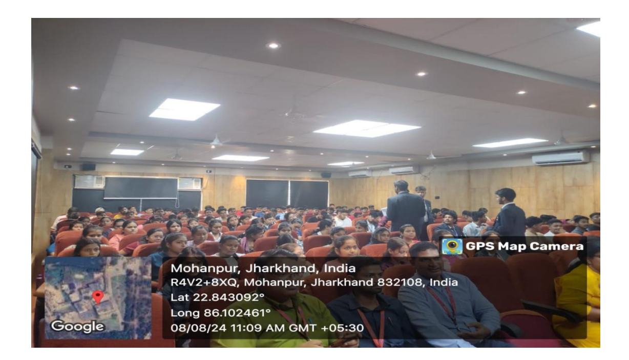
Figure 3: Photo of An Introductory Session on Code of Conduct for New Students