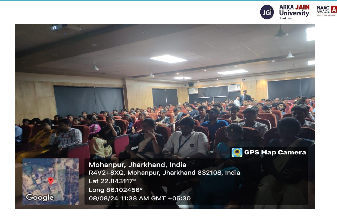
Figure 4: Photo of An Introductory Session on Code of Conduct for New Students