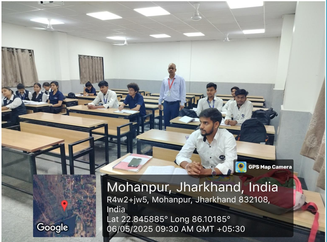
Figure 1: students engage in solving Problem