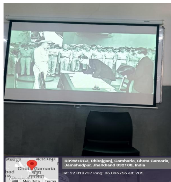
Figure 2 – Attending the event and projection of the event