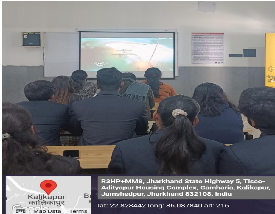
Figure 3 – Showing the documentary on Prakram Diwas.