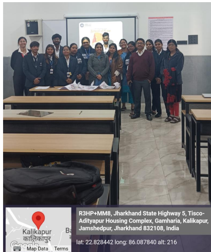
Figure 1: parakram diwas celebration