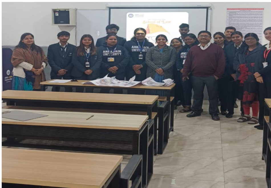
Figure 4- Students with faculty Member's after attending the event