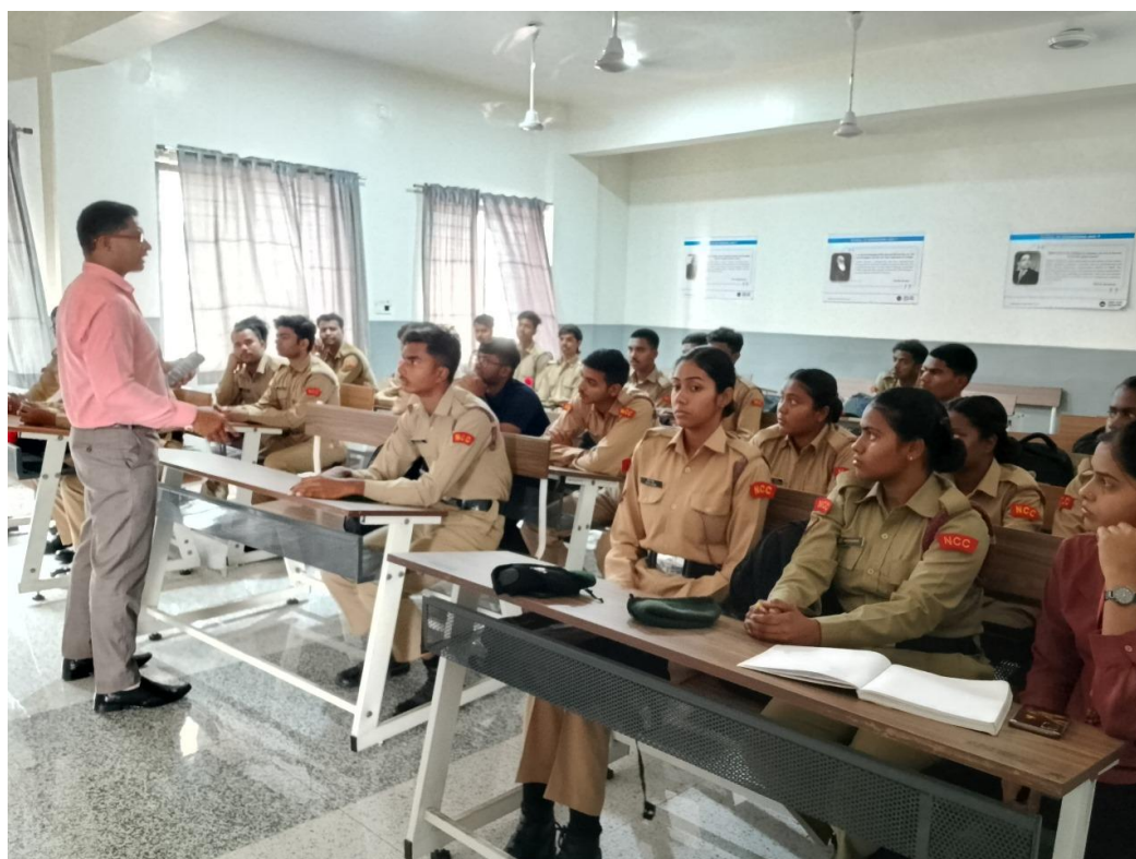
Fig. 2- During Seminar