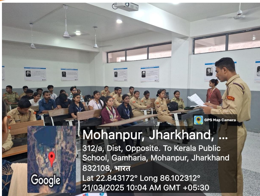
Fig. 3- During Student Presentation