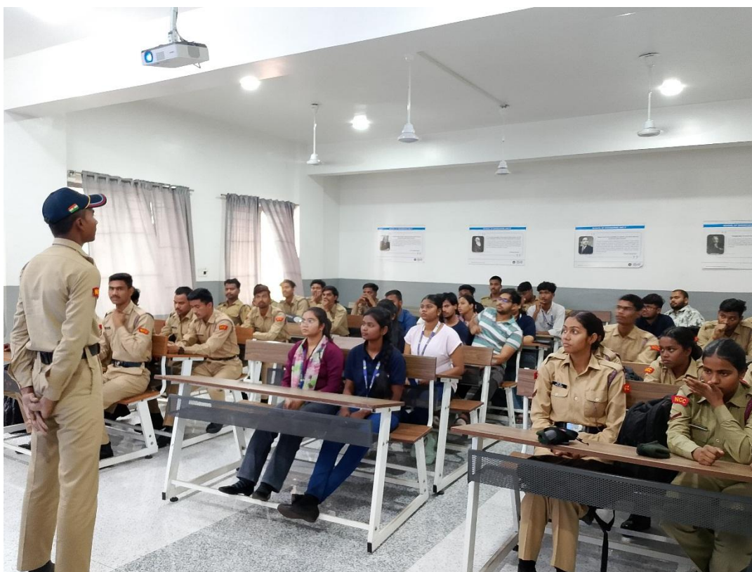
Fig.1- During Group Photo