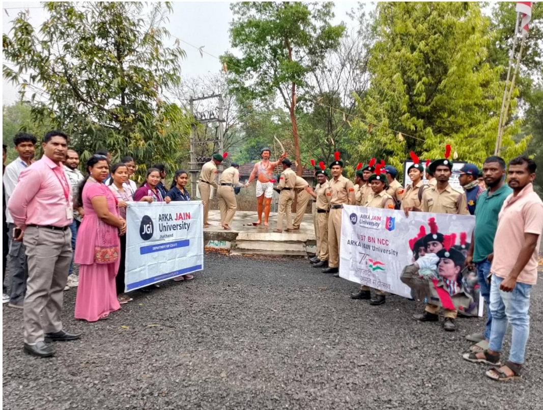
Fig.1- During Group Photo