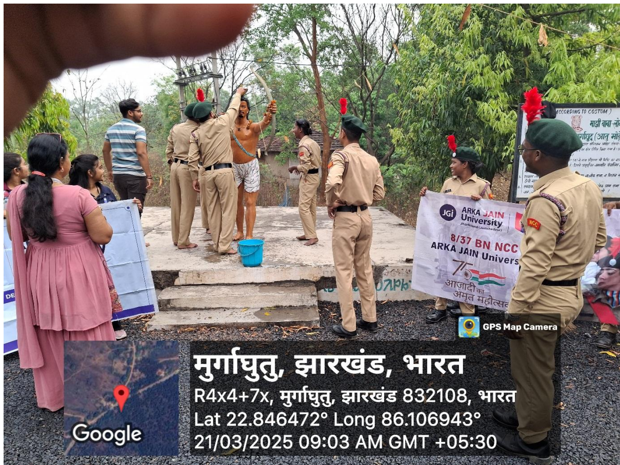
Fig. 4- During Cleaning of Statue of Tilka Ram majhi