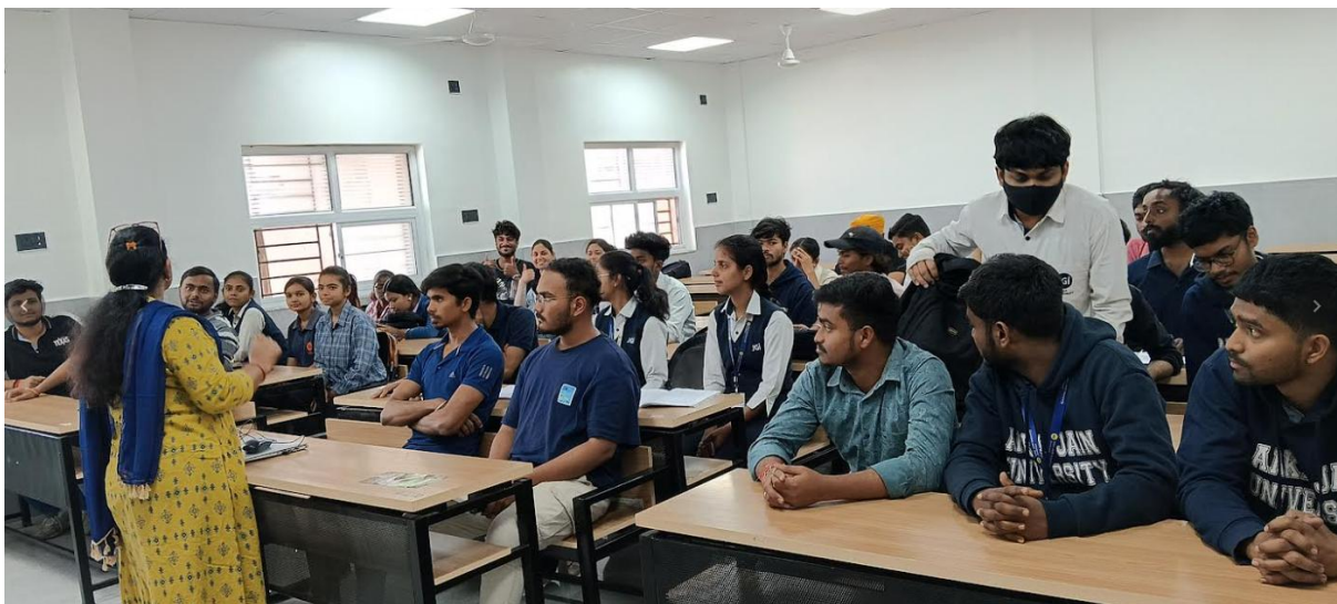
Figure 5: Image of an event “Mentor-Mentee Meeting, BCA-VI Sem, Batch: 2022-25”