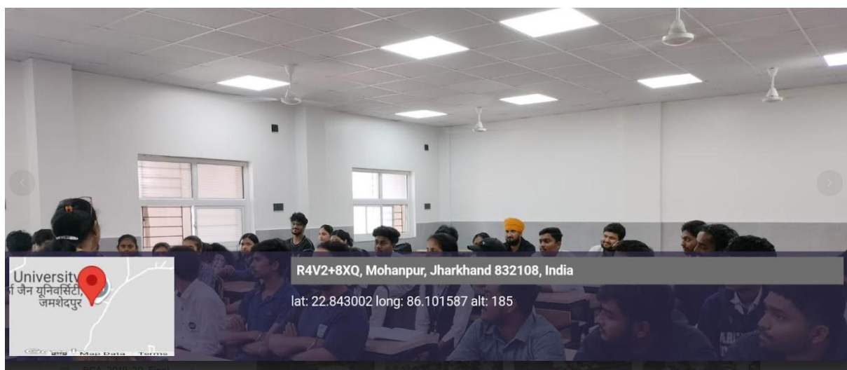
Figure 3: Image of an event “Mentor-Mentee Meeting, BCA-VI Sem, Batch: 2022-25”