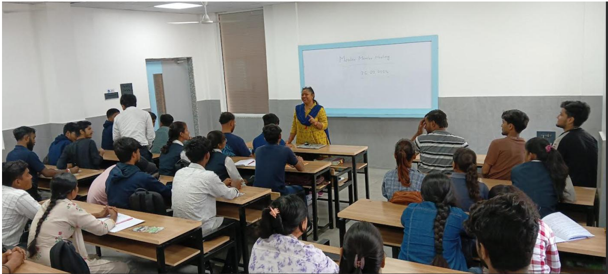
Figure 4: Image of an event “Mentor-Mentee Meeting, BCA-VI Sem, Batch: 2022-25”