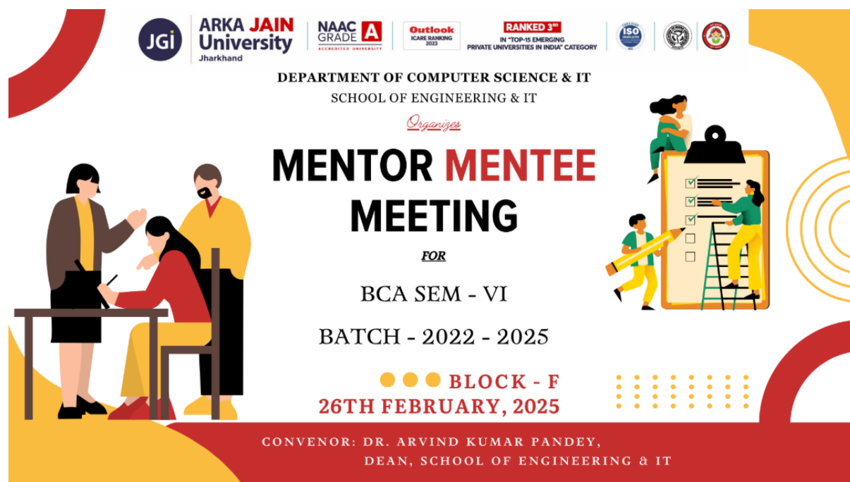
Figure 1: Poster of an event “Mentor-Mentee Meeting, BCA-VI Sem, Batch: 2022-25”