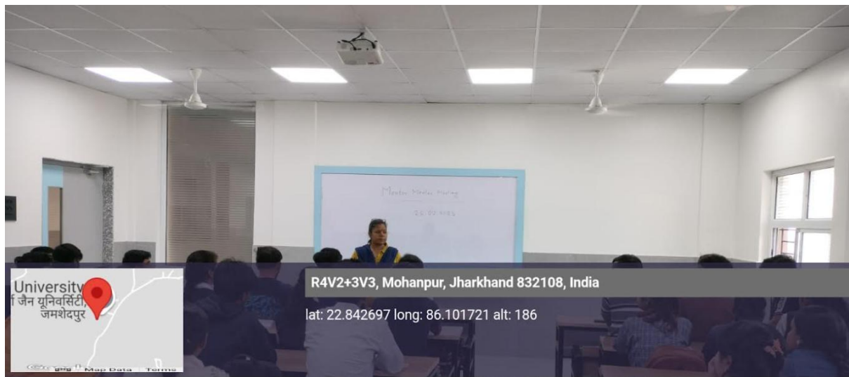
Figure 2: Image of an event “Mentor-Mentee Meeting, BCA-VI Sem, Batch: 2022-25”