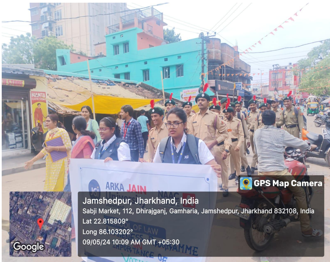
Fig 4. Rally on Awareness programme on 'Importance of Voting' by the both Faculty members and Students of School Of Law along with Students of N.C.C. (AJU Unit ) in the Bhalotia Road, Gamharia area, Jharkahnd.