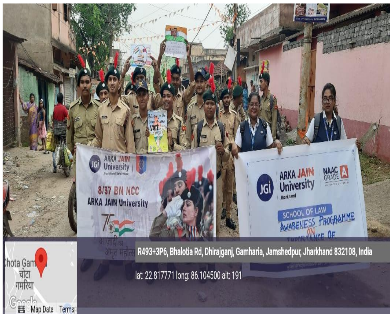
Fig 3. Awareness programme on Importance of Voting by the Students of School Of Law along with Students of N.C.C. (AJU Unit ) in the Bhalotia Road, Gamharia area, Jharkahnd.