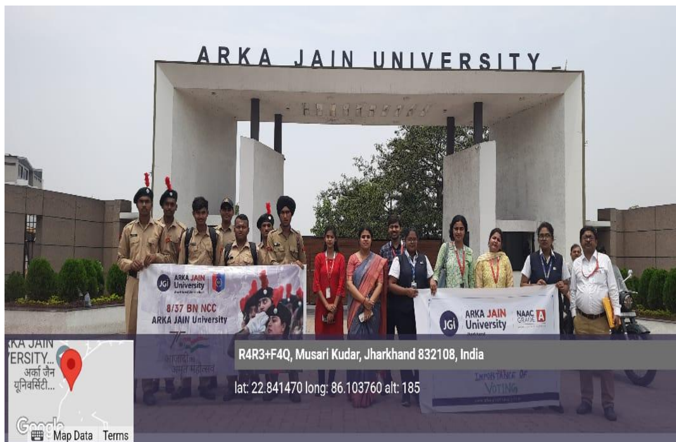
Fig 2. Faculty members and Students of School Of Law along with N.C.C. (AJU Unit)