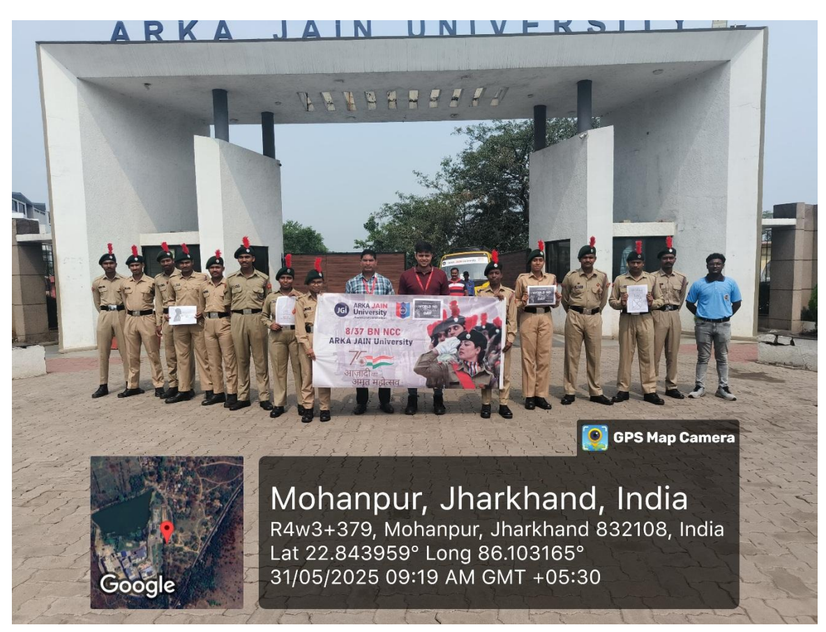
Fig.1- During Group Photo