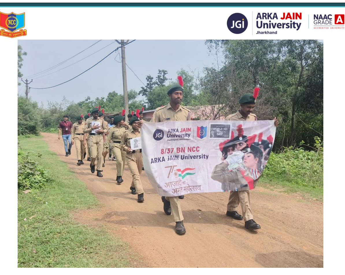
Fig. 2- During rally