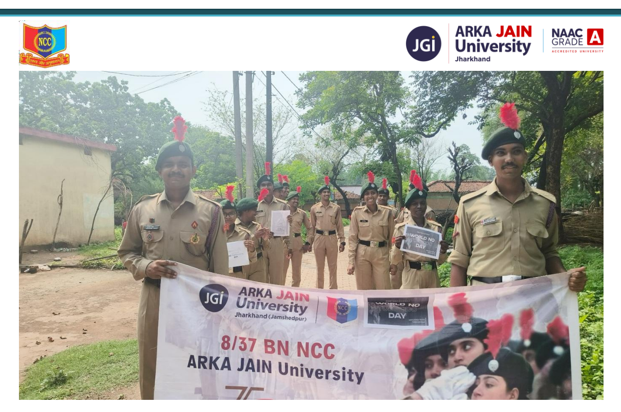
Fig. 4- During Rally