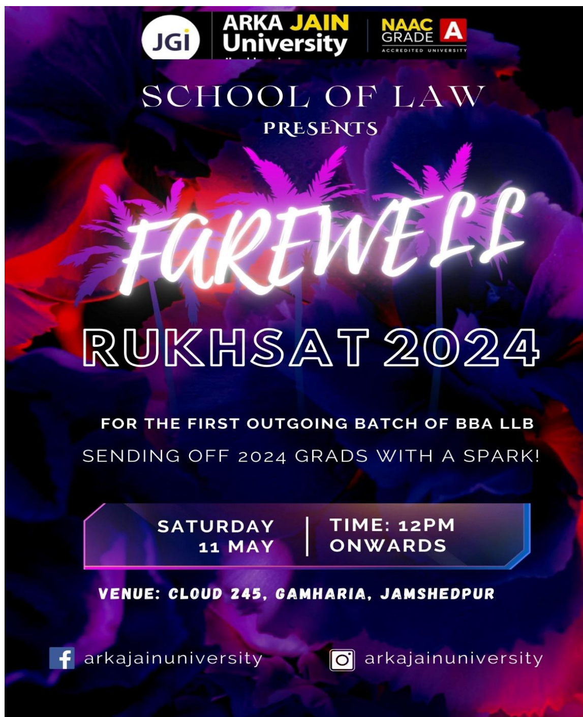
Figure 1: Poster of the event “RUKHSAT 2024”