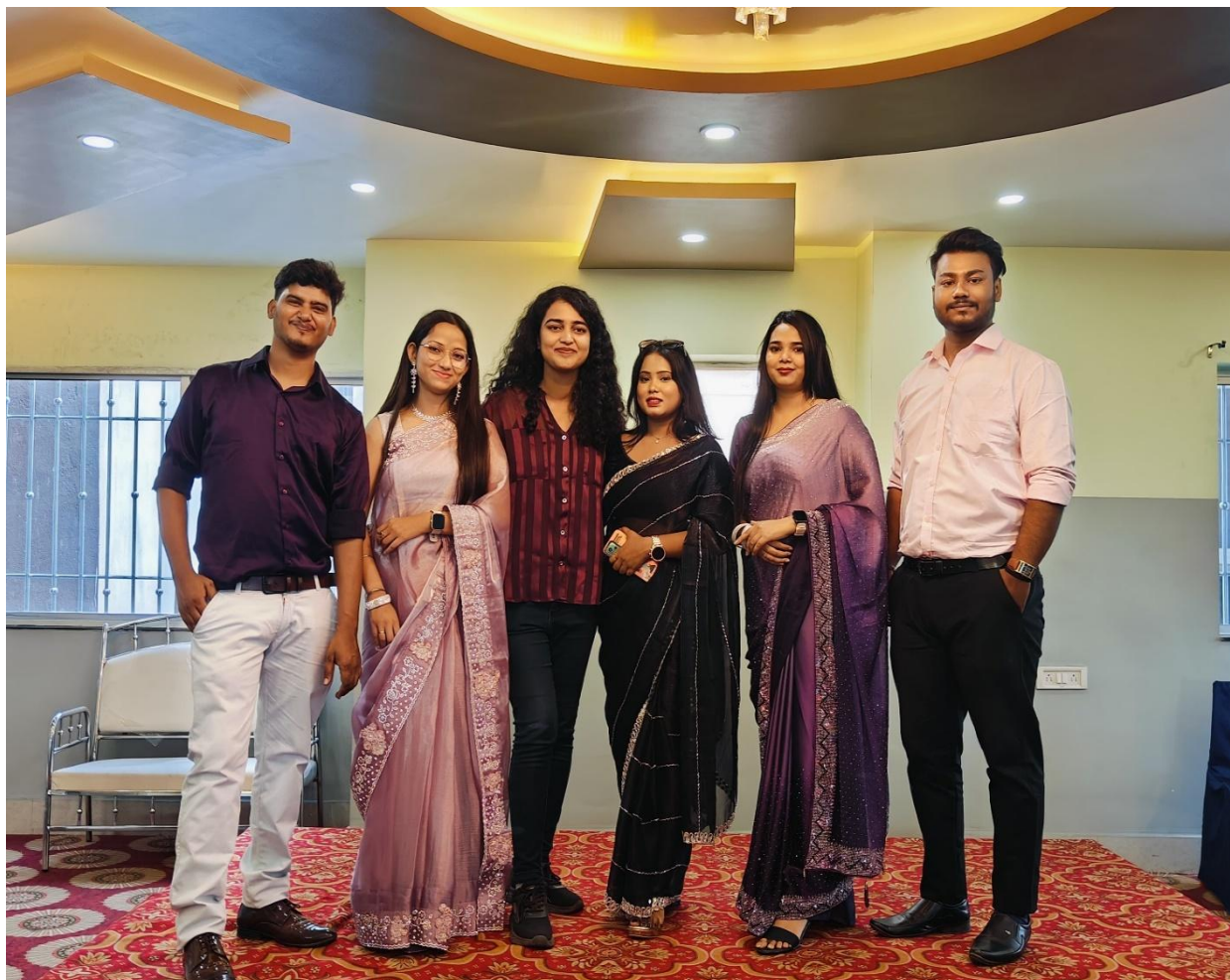
Fig. 3 - Group photo of passing out batch