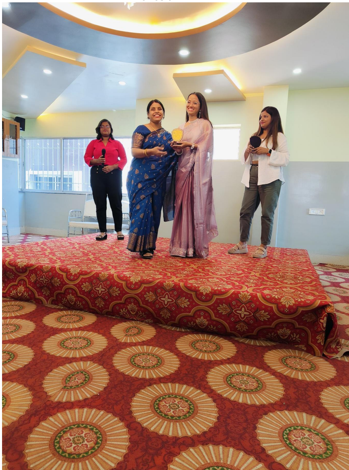
Figure 2: Distribution of Memento