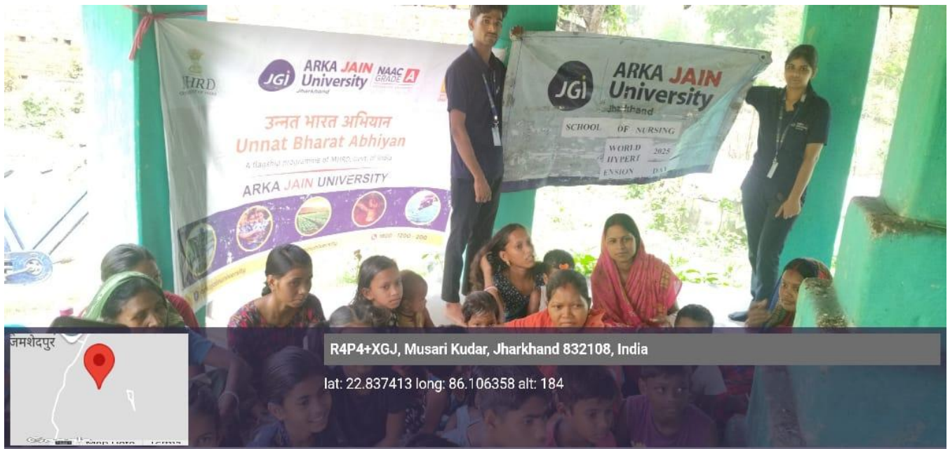
Fig.5: Entranceway Interactive Session on preventing Hypertension by taking healthy diet