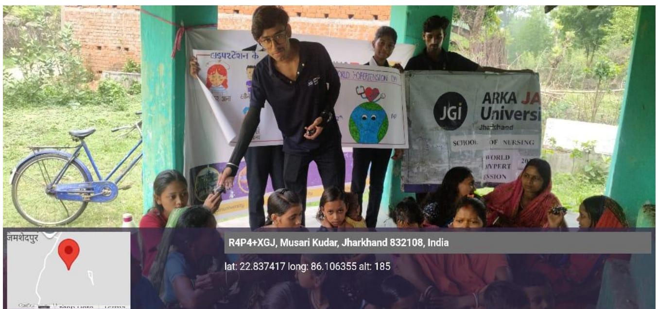
Fig.6: Snacks Distribution