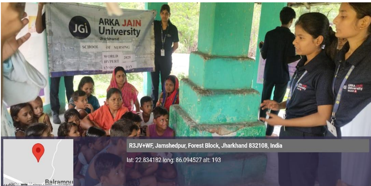
Fig.4: Interactive Session