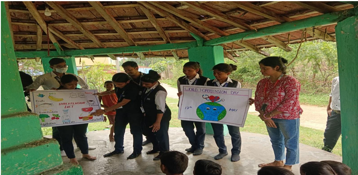
Fig.2: Student introducing about the Hypertension Day event