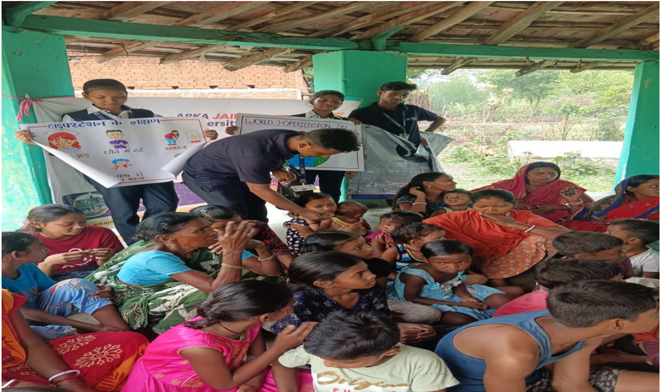
Fig. 3: Students Distributes snacks after the events