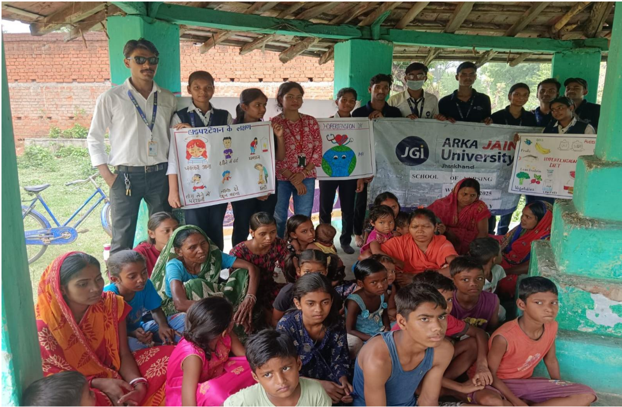
Fig.1: Group Snap of the World Hypertension Day