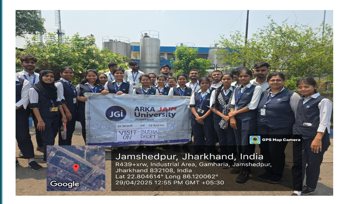
Fig. 2- Students with milk purification plant