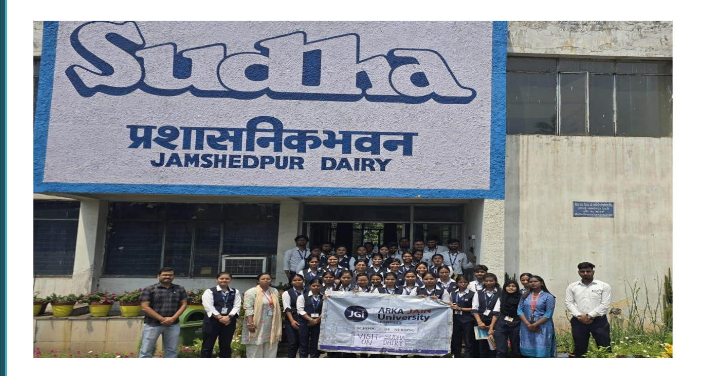
Fig. 4- Students along with faculties and manager of Sudha Dairy