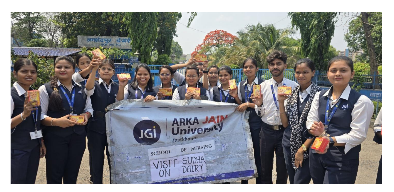
Fig. 3-Students carrying the products of Sudha Dairy