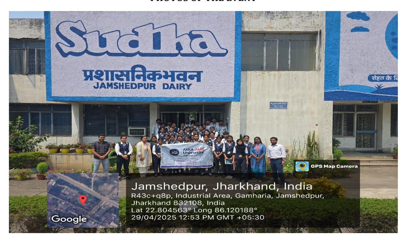
Fig.1- Group photo of students in Sudha Dairy