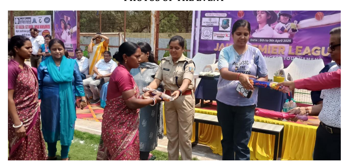
Fig.1-The Honourable Guests distributing the umbrellas