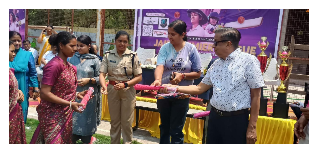
Fig.4- Distribution from the hands of the guests and our Chairman-Board of Management