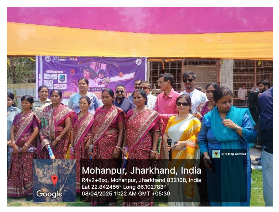
Fig.2 The distinguished and the female house staffs received the umbrellas